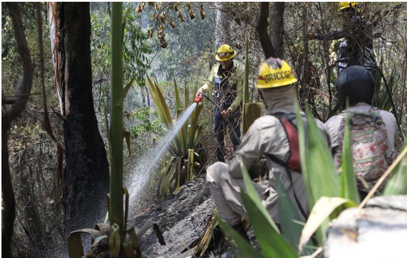
Minec asks urban dwellers not to mistreat animals fleeing forest fires

"These animals normally flee after a fire and end up in urban areas. When this happens, we have always recommended to the population that in any of these cases, they keep calm and do not try to hurt the animal or interfere with its movements, since it is an animal that is in a state of shock, suffering a very big trauma due to the fire. In case you manage to get your hands on it, contact the competent authorities, who will know what to do at the right time, and where to transfer it for its subsequent reinsertion into its natural habitat", he concluded.