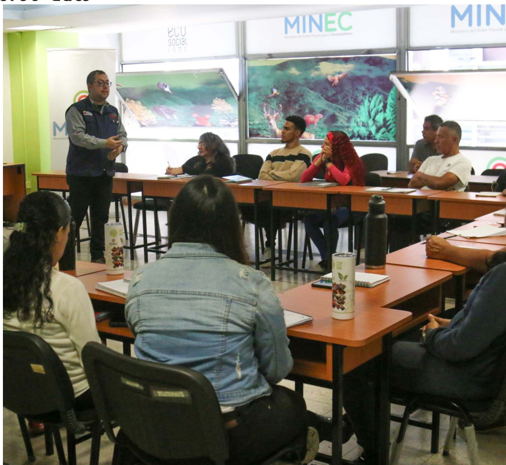
Legal, technological and environmental assistance personnel trained

The Law of Data Messages and Electronic Signatures is an instrument created by the Venezuelan State to grant certainty and responsibility in the issuance of acts and messages, and thus validate in a real, effective and verifiable way, the information that is issued.