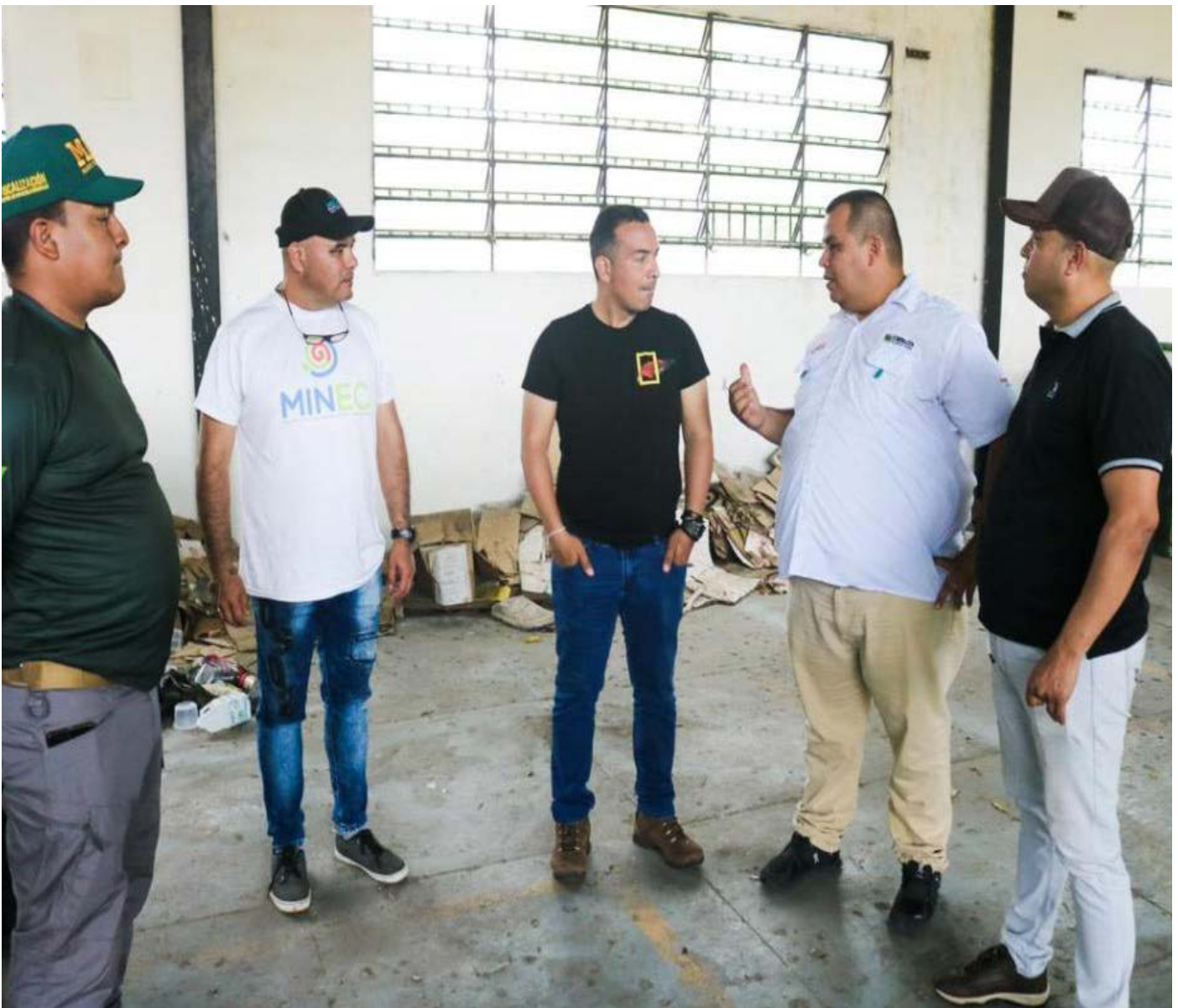
Project will strengthen the Fifth Historic Objective of the Homeland Plan