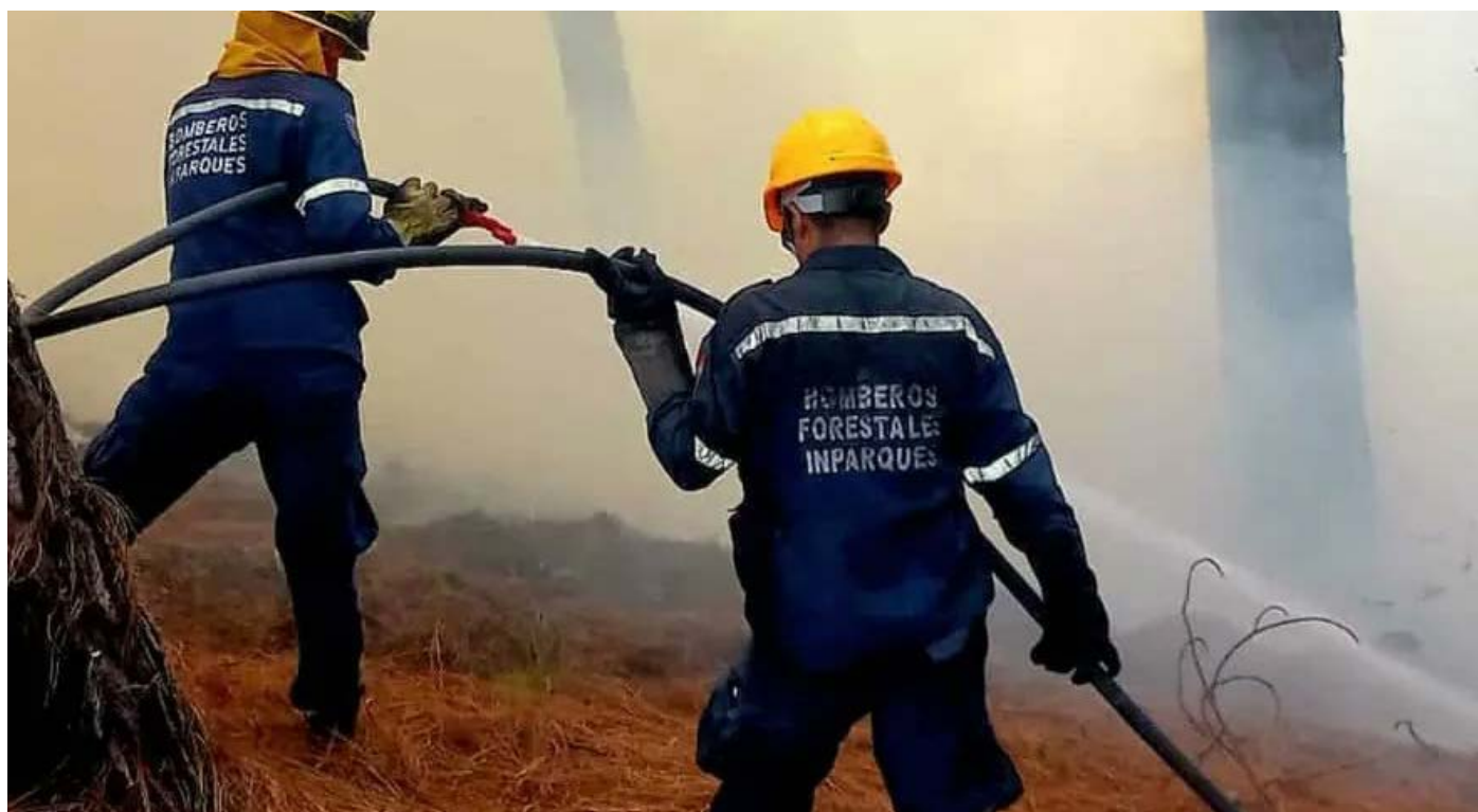
National Government calls for caution and to report burnings through 0800-Ambient

T he Minister of People's Power for Ecosocialism, Josué Lorca, indicated that so far in the country there have been 1,970 forest fires "fought and ended for a total of 23,000 hectares (ha) affected".