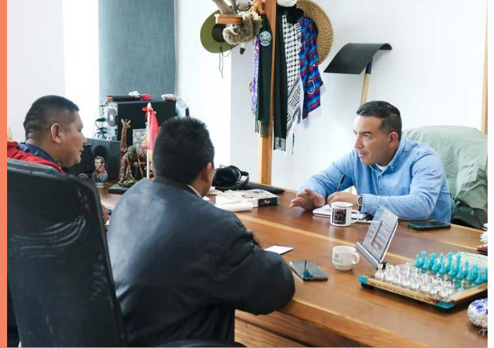
1x10 of Good Governance attends to the population of Amazonas

He will be the mate of Makumba, a male of the same species