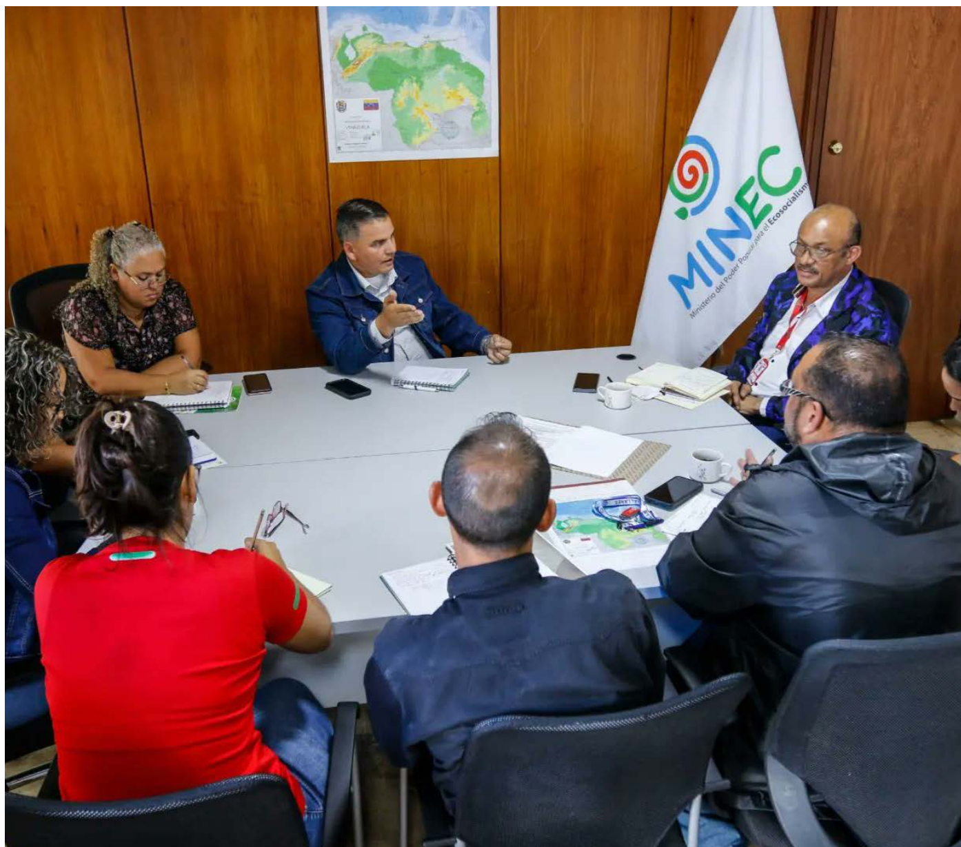
Work tables take as a main element the preservation of the environment