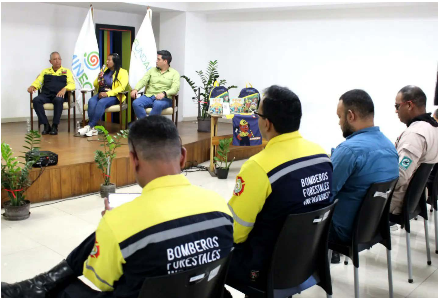
Human activities are the main causes of fire propagation

There is also a notorious impact on aquatic ecosystems, which lose the protection provided by vegetation, a change that is aggravated by the manifestations of climate change. Likewise, the National Electric System (SEN) networks are affected.