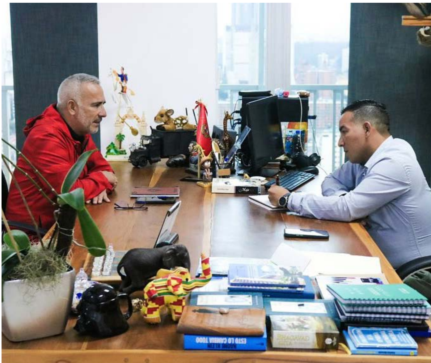
Minec carries out works in parks and transboundary watersheds of the entity

He reiterated that the installation of the ecological parks will be carried out progressively and explained that they are gymnasiums and courts made of pressed ground rubber.