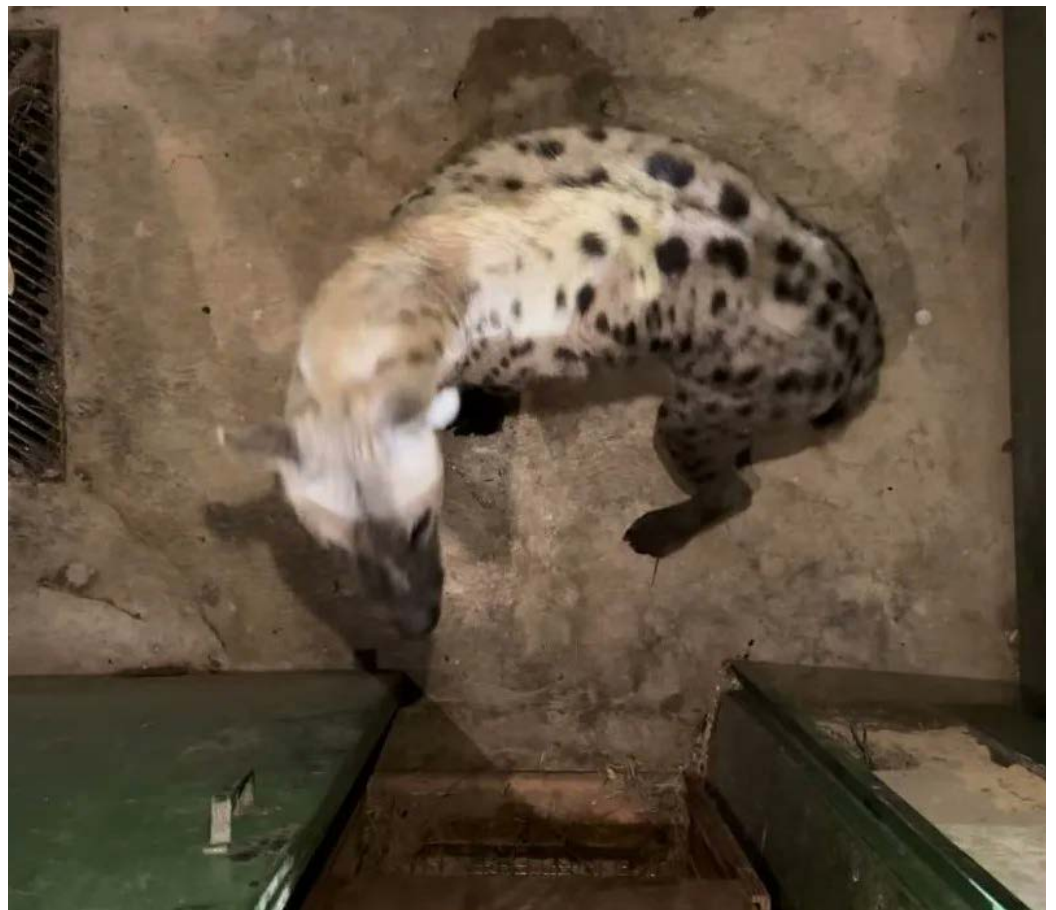
Animals will be kept in a space adapted for them to get to know each other