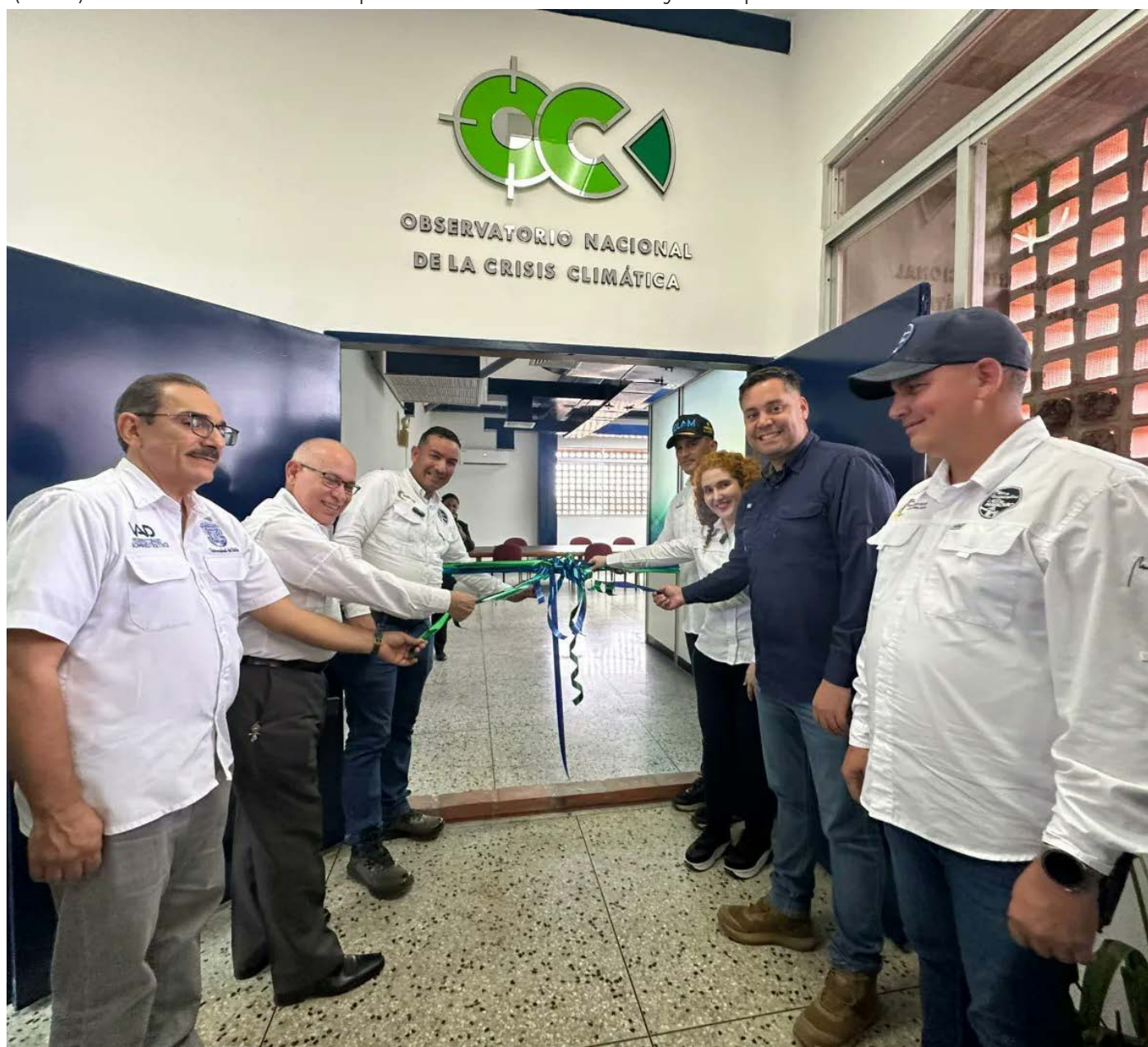
The technical-scientific parameters of the lake's water quality will be analyzed on site

He advanced that the technical-scientific parameters of the Lake's water quality will be analyzed on site, and the actions to be taken will be determined. "Last week we were in Catatumbo taking some samples", he concluded.