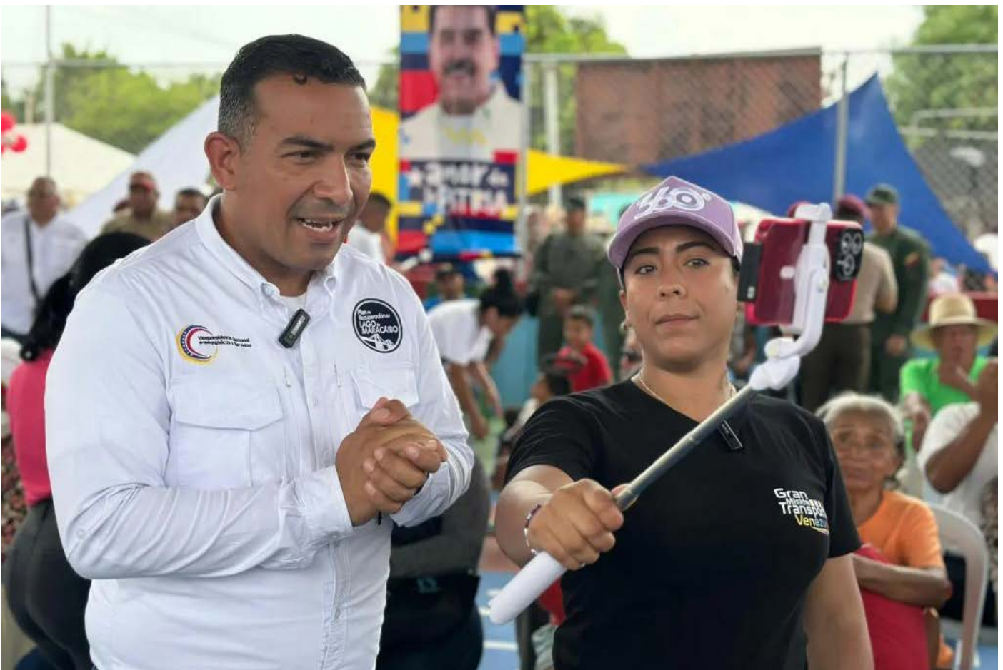
During the activity, more than 3,800 families benefited and more than 380 social aids were delivered

As regards education, he indicated that 64 Integral Diagnostic Centers (CDI) and more than 200 schools are being attended with the participation of the Military Community Brigades for Education and Health (Bricomiles) throughout the entity.