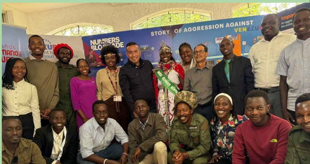
The 7Ts that Venezuela will apply by 2030 were announced

"Thank you for the energy and for your words. We Venezuelans will continue to tell the truth about Venezuela in every corner," he said.