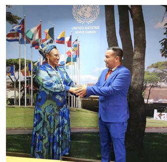
International relations are strengthened

strengthen cooperation in environmental matters between the two American nations and at the same time to outline a work plan for concrete actions and the exchange of experiences, among other aspects.