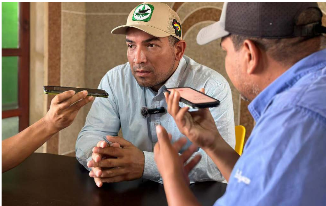
The company continues to combat illegal mining in the territory

He also added that ACTO has had a significant growth over the last 40 years and as of last November, a meeting was held "and the mandate of the indigenous peoples, of the original peoples, is being fulfilled