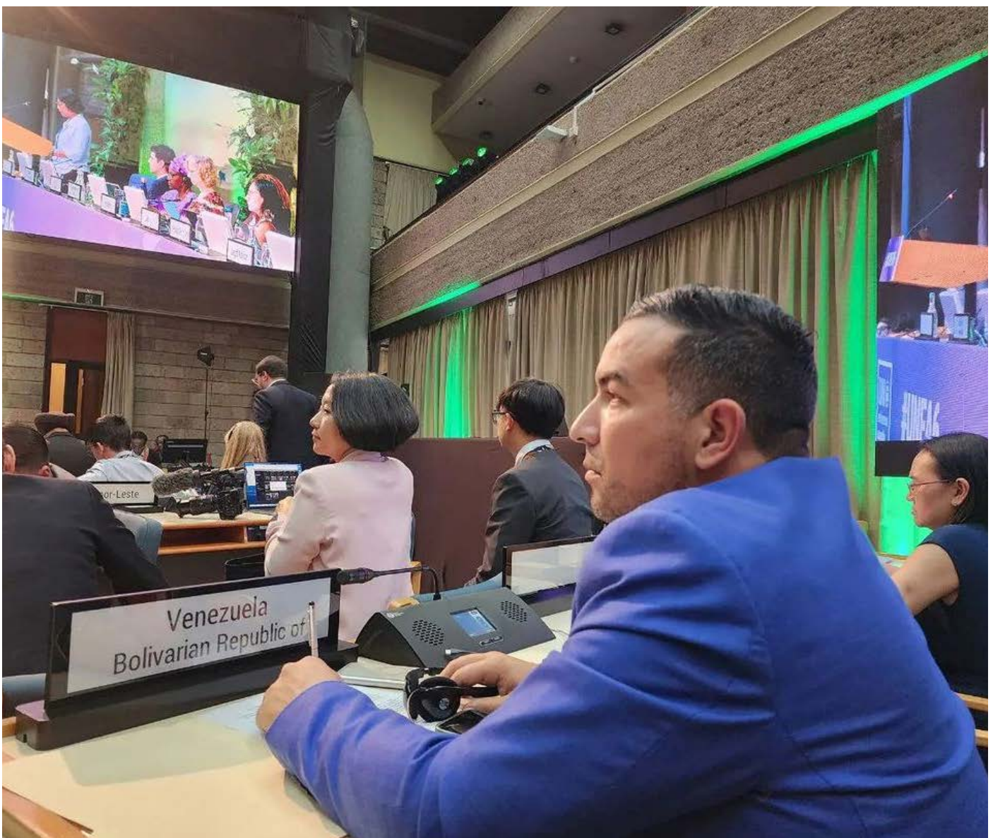
International cooperation on air pollution to be promoted

Concurrently, 16) Amendments to the Instrument for the Establishment of the Restructured Global Environment Facility. 17) Provisional agenda, dates and venue of the seventh session of the United Nations Environment Assembly. (18) Management of trust funds and earmarked contributions.