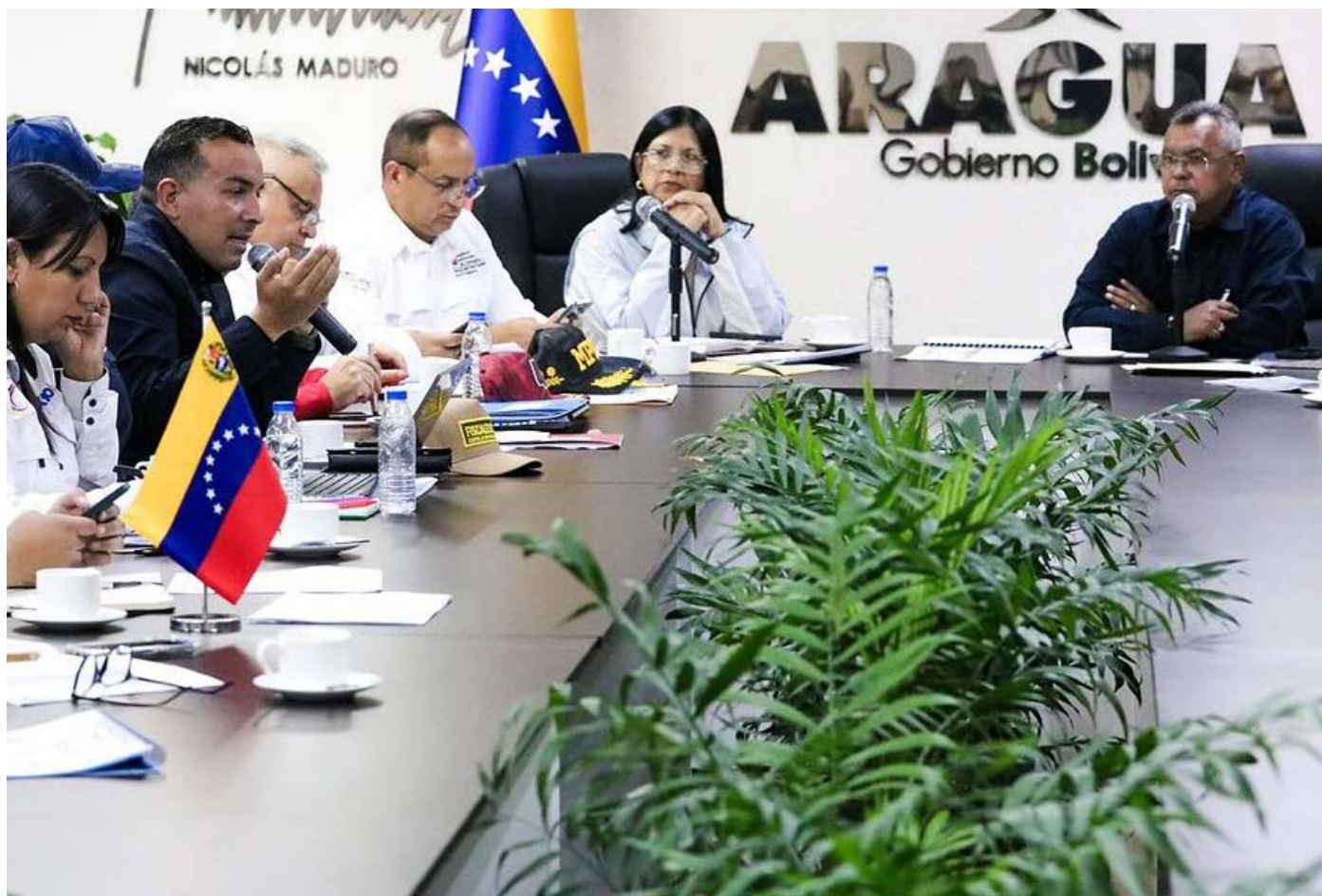
These actions correspond to Plan 7T 2030