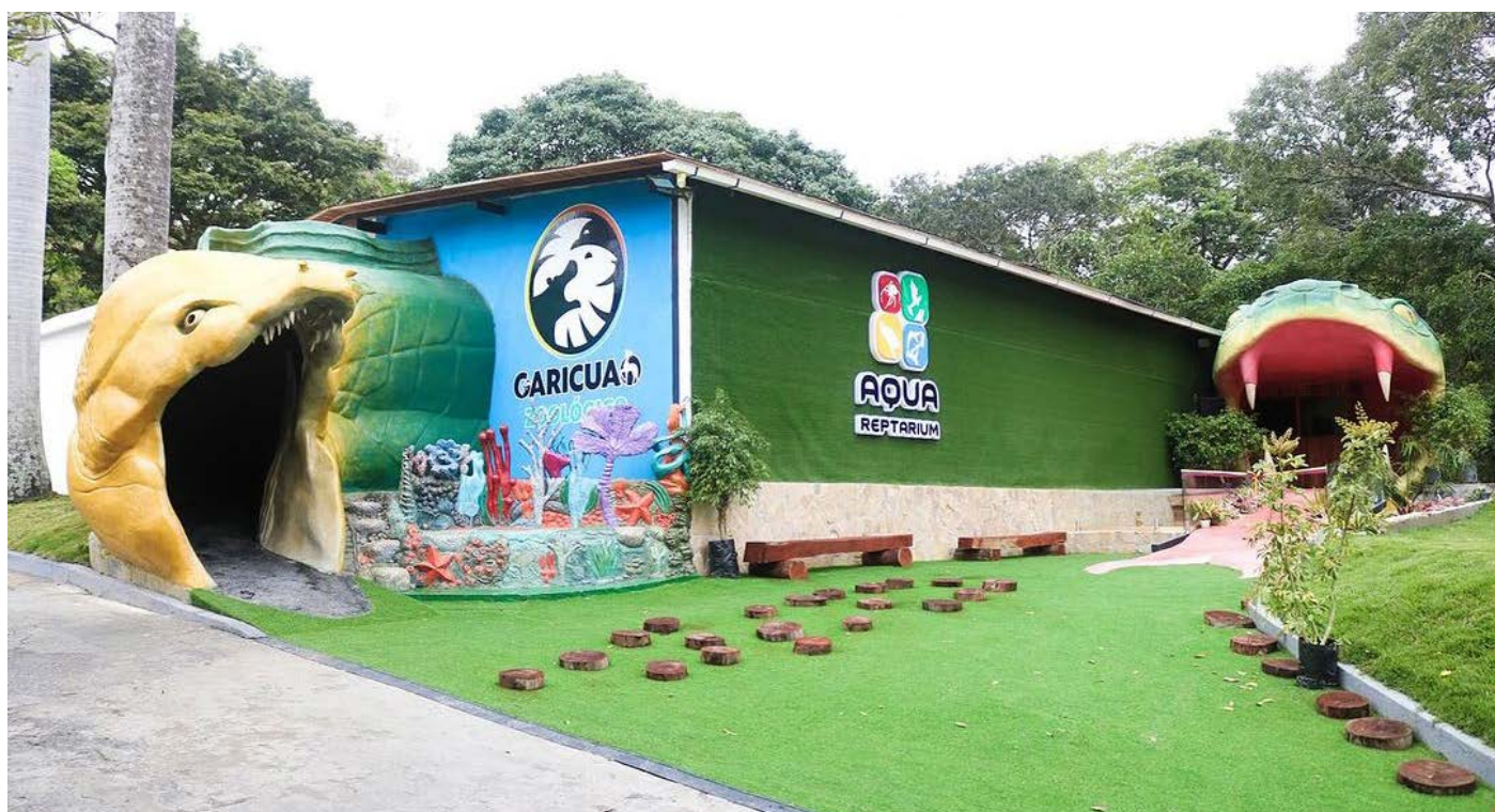
The site is specially designed for children