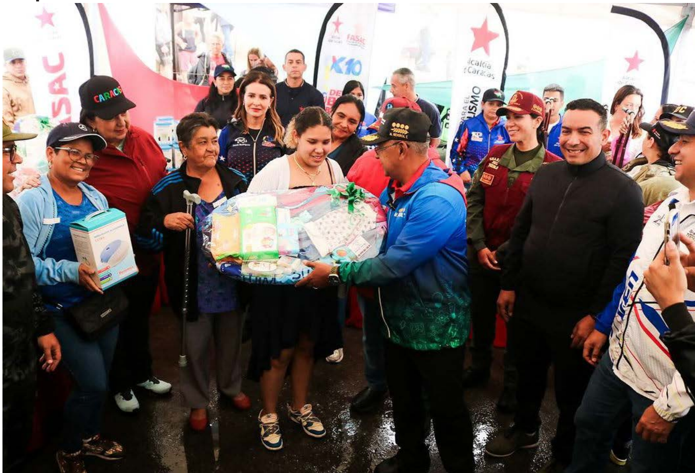
Authorities toured the area together with Poder Popular

In the territorial axes 4 and 5 of the Plan de Manzano and El Limón sectors, located in the Sucre parish, in Caracas, the second day of the 1x10 and Social Transformation was carried out.