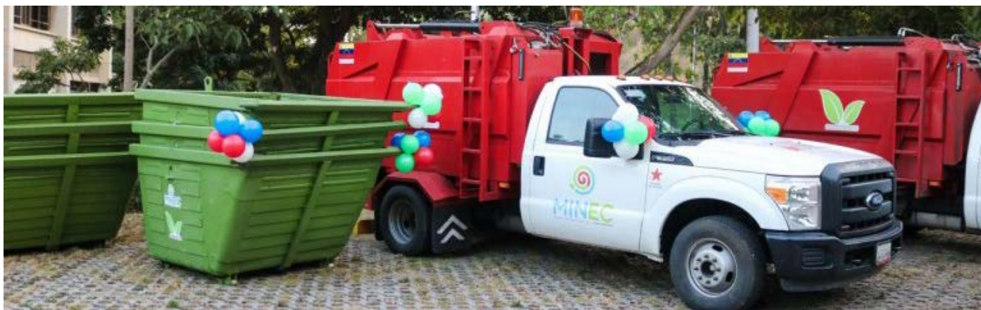
Equipment and supplies will increase solid waste collection to 32 tons per trip

Meléndez congratulated and highlighted the members of Supra Caracas, "men and women who continue to make a daily effort, especially during the Christmas holidays, when large amounts of garbage are usually generated".