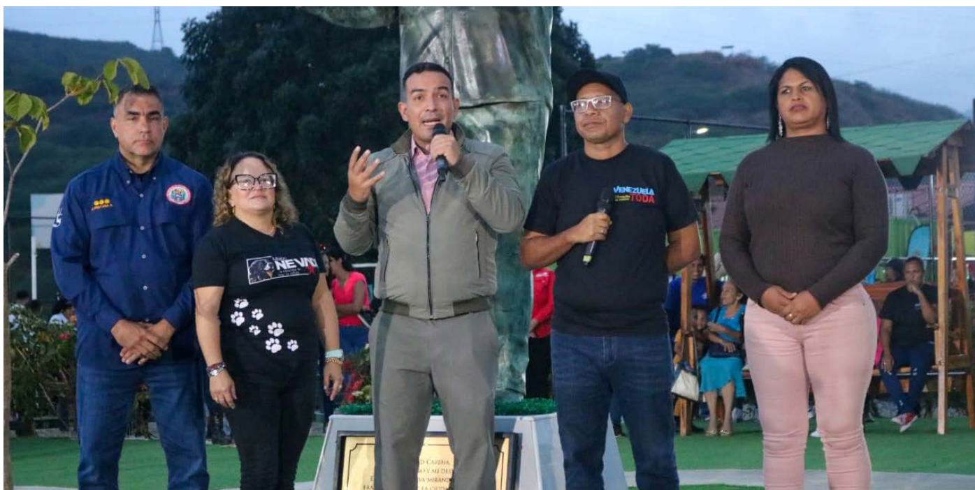
Space was made with used tires and plastic wood

“How nice it is to see here all these children sharing with their families, with their fathers, with their mothers, and all at once they can do sports, exercise and recreate,” he said.