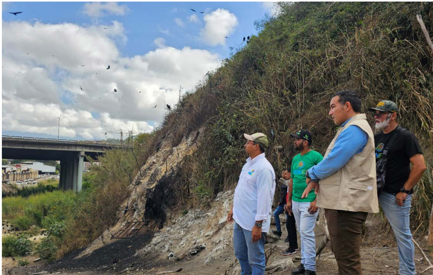
Animals will be initially relocated to the Caricuao Zoo, and then moved to other sites