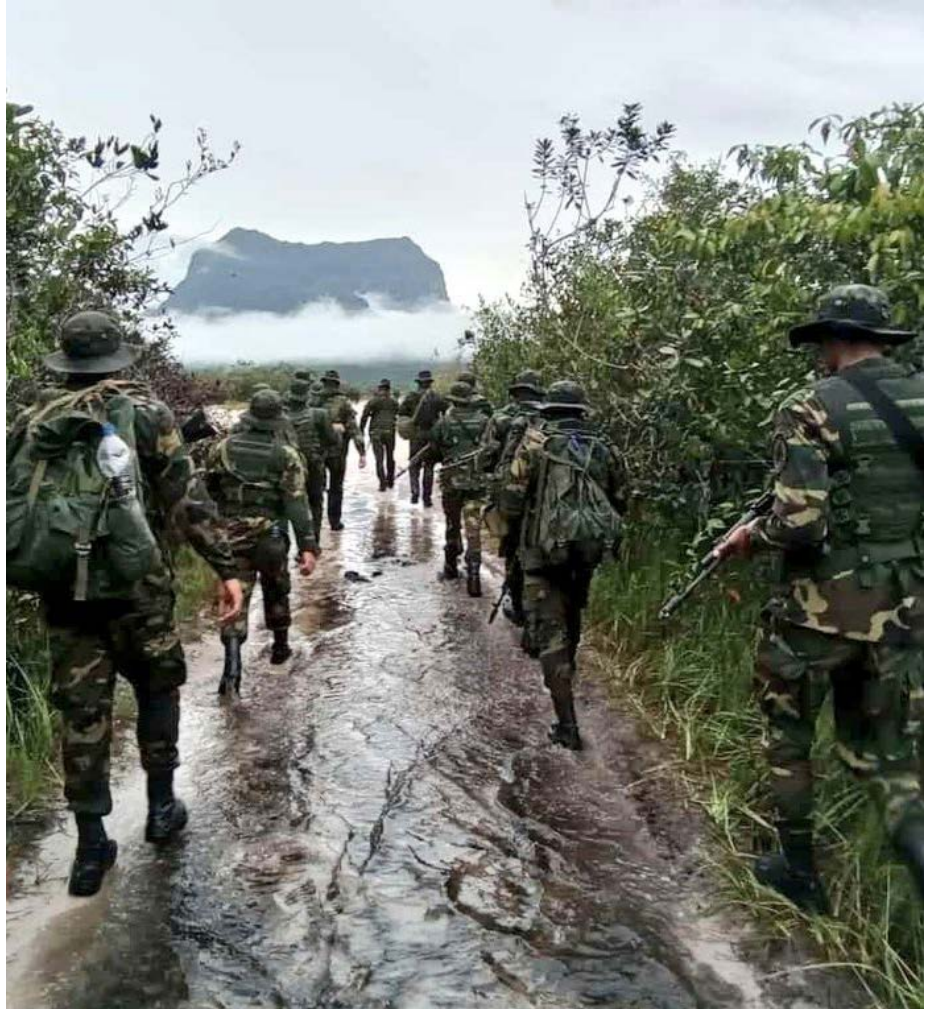
FANB frees national parks such as Yacapana

M ore than 10,200 illegal miners have been expelled by the Bolivarian National Armed Forces (FANB) from the Venezuelan Amazon, revealed the President of the Bolivarian Republic of Venezuela, Nicolás Maduro, during the segment "Media, Networks and Walls" of the 15th edition of the program "Con Maduro +", broadcast by Venezolana de Televisión (VTV).