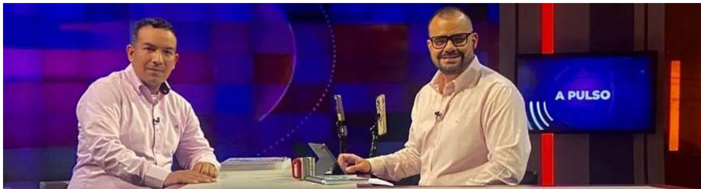
Minister Lorca detailed achievements at the Ministry of People's Power for Ecosocialism

T he Minister of People's Power for Ecosocialism, Josué Lorca, assured that the Presidential Commission for the Rescue, Conservation and Sustainable Development of Maracaibo Lake carries out, through Iclam, a daily follow-up at the national and regional levels, as well as the articulation of several instances to review, establish and execute bioremediation protocols in this important body of fresh water, unique in the world, which has a direct and natural connection with the sea.