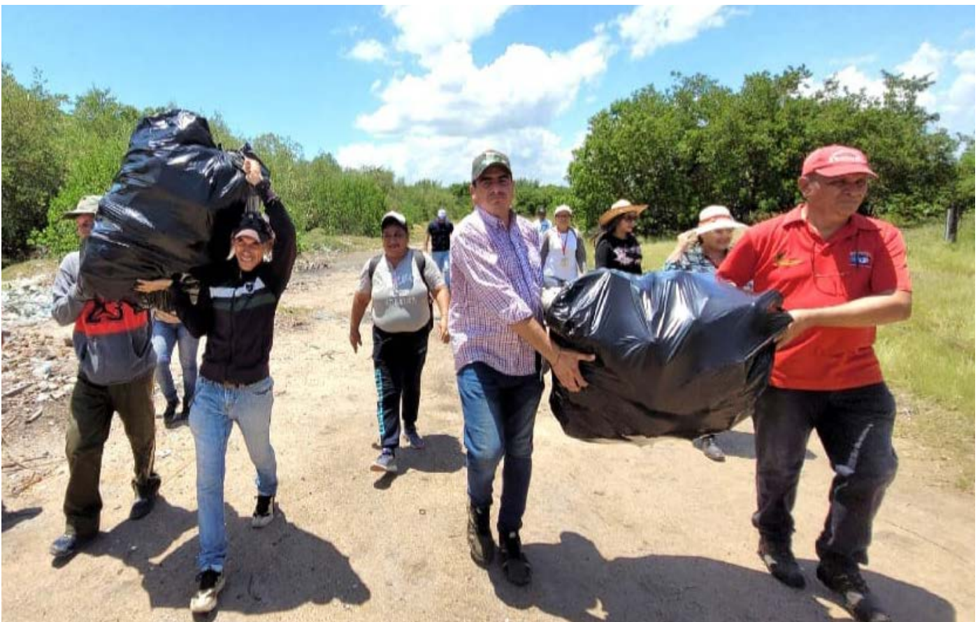
1,017 volunteers participated in this action

The environmental authority in the state of Zulia assured that the deployment will be extended in the coming days in different municipalities of the state.