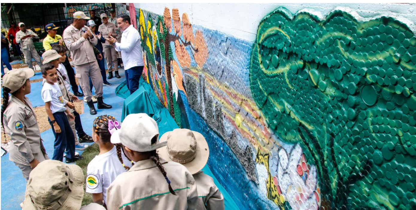
Park rangers decided to adopt St. Francis of Assisi as their patron saint