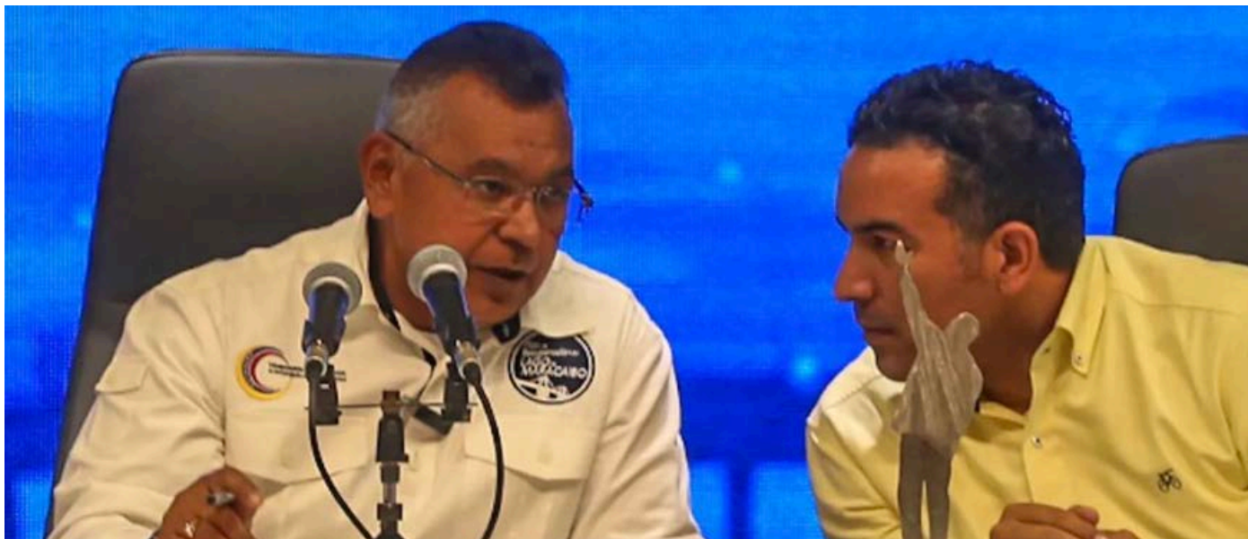
Iclam to become the Presidential Commission's operations center

T he 1st Technical-Scientific-Popular Meeting for the Rescue, Conservation and Sustainable Development of the Lake was held in Maracaibo on August 2 and 3. The activity was presided over by the Vice-President of the Public Works and Services Sector, G/J Néstor Reverol, accompanied by the Presidential Commission in charge of the recovery and sanitation of the lake.