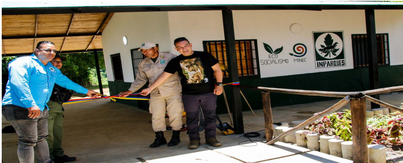
An Ecosocialist Training Camp was also set up

A s part of the activities for World Park Ranger Day, the Catuche and Papelón Park Ranger Posts, located in Waraira Repano National Park in the capital, were reopened.