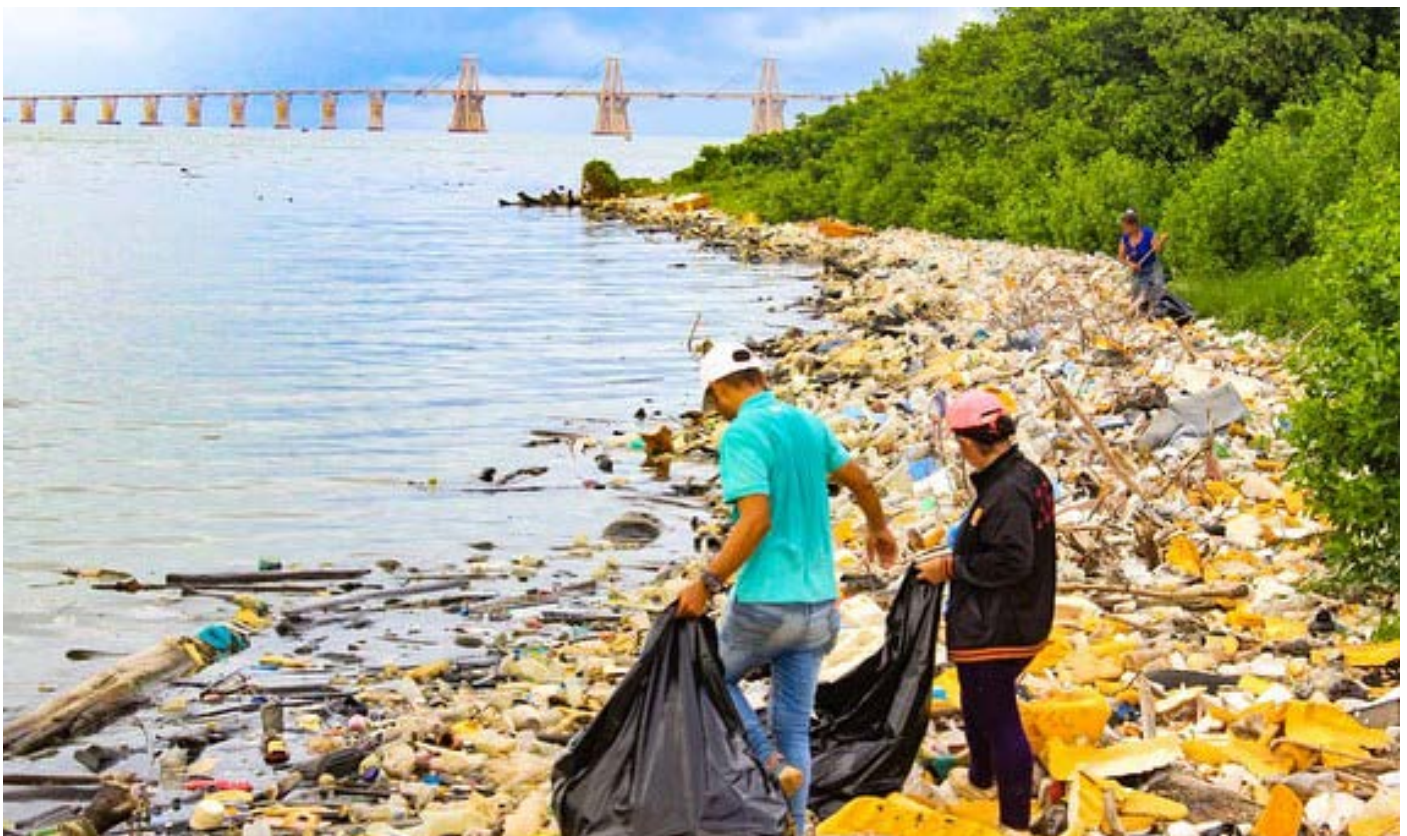
People's Power has collected about 6 thousand kilos of plastic from the shores of Lake Maracaibo

President Maduro pointed out: "we are going to enter the Lake, we are going to enter with depth and seriousness, in spite of the sanctions and the blockade. We will provide the resources, we will provide the answers, but Lake Maracaibo, a beautiful lake, has to be recovered, we have to recover it, that is how I put it to myself".