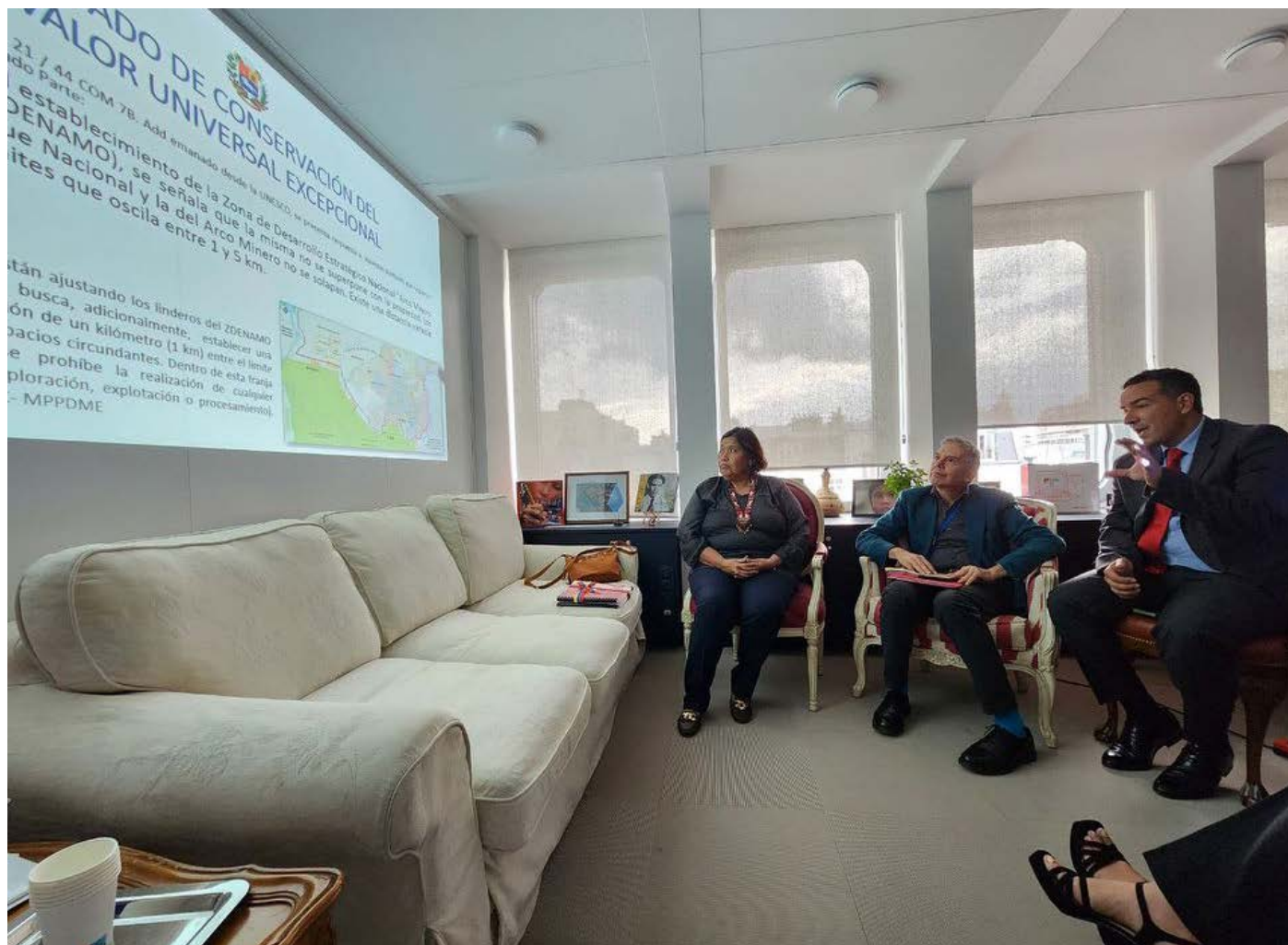
Minister Lorca met with delegations from Saudi Arabia, Russia and Mexico

T he Minister of People's Power for Ecosocialism, Josué Lorca, on behalf of the Bolivarian Republic of Venezuela, presented to the headquarters of the United Nations Educational, Scientific and Cultural Organization (UNESCO) in Paris, France, the progress made by the Bolivarian Government in the conservation of the country's declared World Heritage Sites.