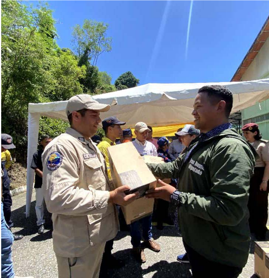
Stations will allow the monitoring of climatic variables

The Ecosocialist Management team delivered community weather stations in Trujillo State, in a ceremony attended by representatives of Civil Protection (PC), local firefighters and authorities in the area of security and prevention.