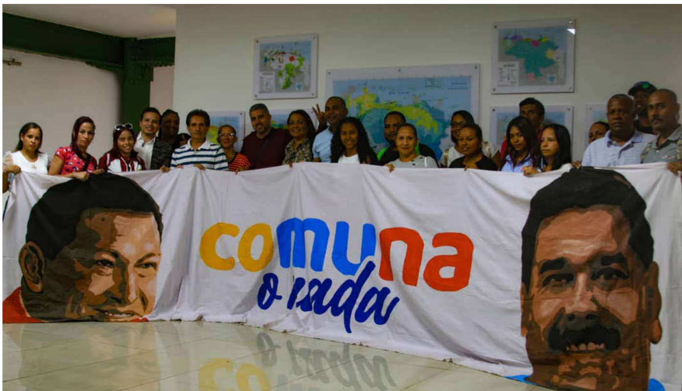
Articulation with the People's Power is essential to consolidate this plan

"I leave this meeting very satisfied, knowing that there is an articulation, that we are working along the same lines. It is to make these proposals of actions and systematize them, to give them institutional weight", concluded Carrillo.