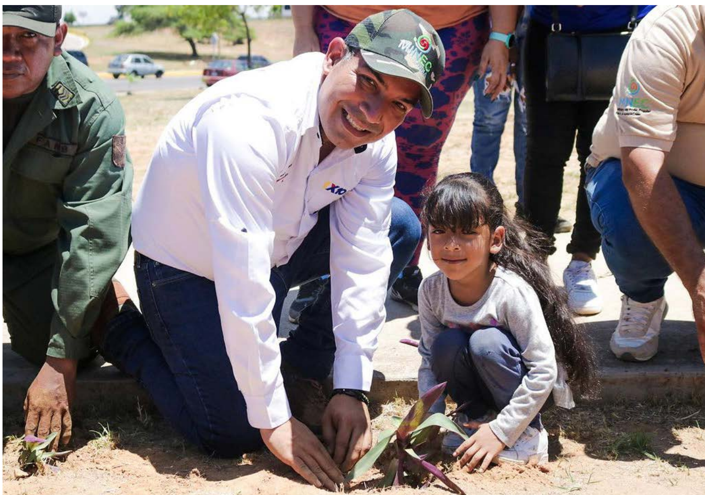
Recycling and Sanitation Technical Committees carry out important cleaning and maintenance work

He emphasized that "with the sanitation of Lake Maracaibo, an extraordinary work has been carried out with all the institutions of Zulia, the scientific institutions and the Universidad del Sur", he concluded.