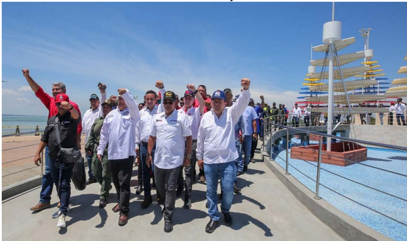
Epic monument on the Vereda del Lago was made by five zulian artists

T he Sectoral Vice-Presidency of Public Works and Services (Vpsops) was deployed in the state of Zulia with the purpose of complying with the instructions of the President of the Bolivarian Republic of Venezuela, Nicolás Maduro Moros, to achieve maximum efficiency in the area of public services in the state.