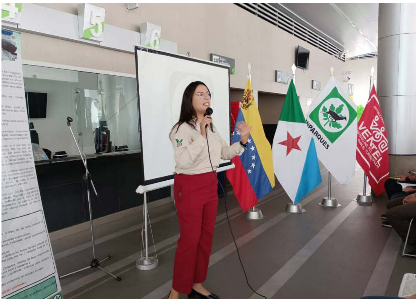
Awareness-raising seeks to consolidate good environmental practices to preserve national parks and natural monuments

These workshops, guided by the Minister of People's Power for Ecosocialism and president of Inparques, Josué Lorca, and the head of Tourism, Alí Padrón, will continue in Waraira Repano National Park, with the purpose of consolidating good environmental practices to preserve the national parks and natural monuments.