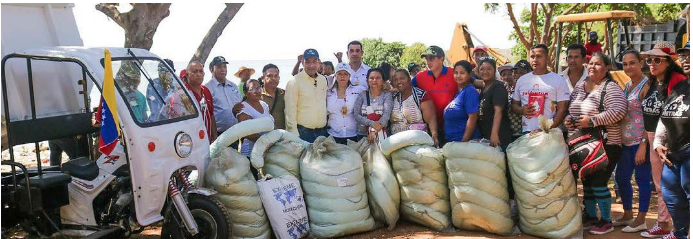
People's Power receives supplies for the collection and classification of waste on the shores of Lake Maracaibo

He also expressed that weekly scientific debates will be held, to which all environmental sectors are invited, so that they can know in depth the behavior of Lake Maracaibo, which "during the last forty years has registered the periodic presence of this cyanobacteria algae, recurrent on the coasts due to diverse factors.