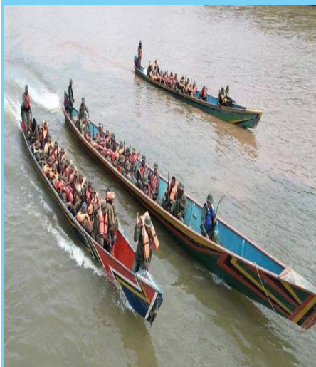
Mining in areas under Special Management Regime is illegal

T he Bolivarian National Armed Forces (FANB) evacuated more than four thousand miners in the state of Amazonas by means of water, land and air transportation.