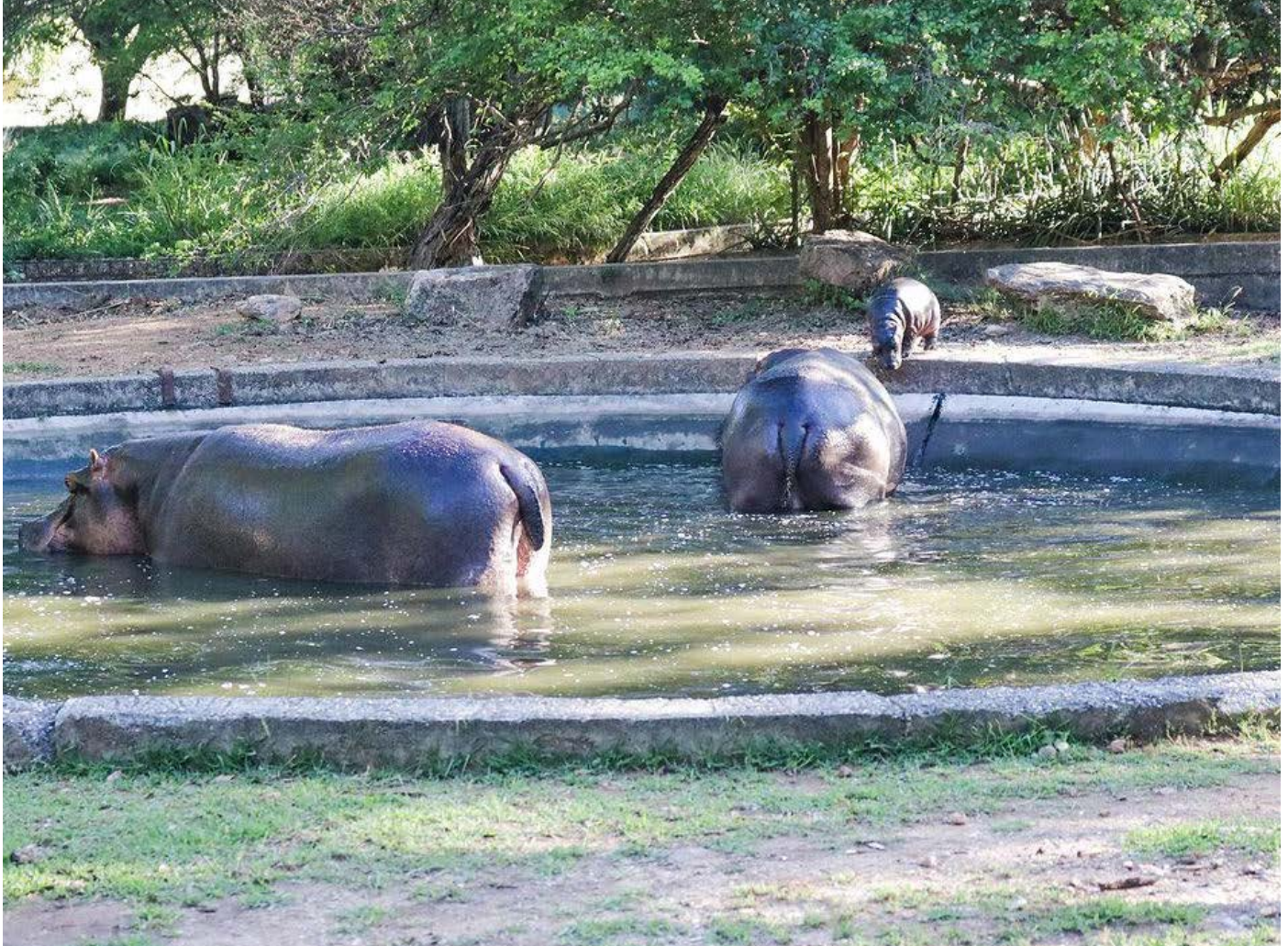
Captive breeding demonstrates excellent condition of the species

T he Bararida Zoo and Botanical Park in the city of Barquisimeto in the state of Lara, has a new guest, after the hippopotamus Liseth gave birth to a baby that is in good condition.