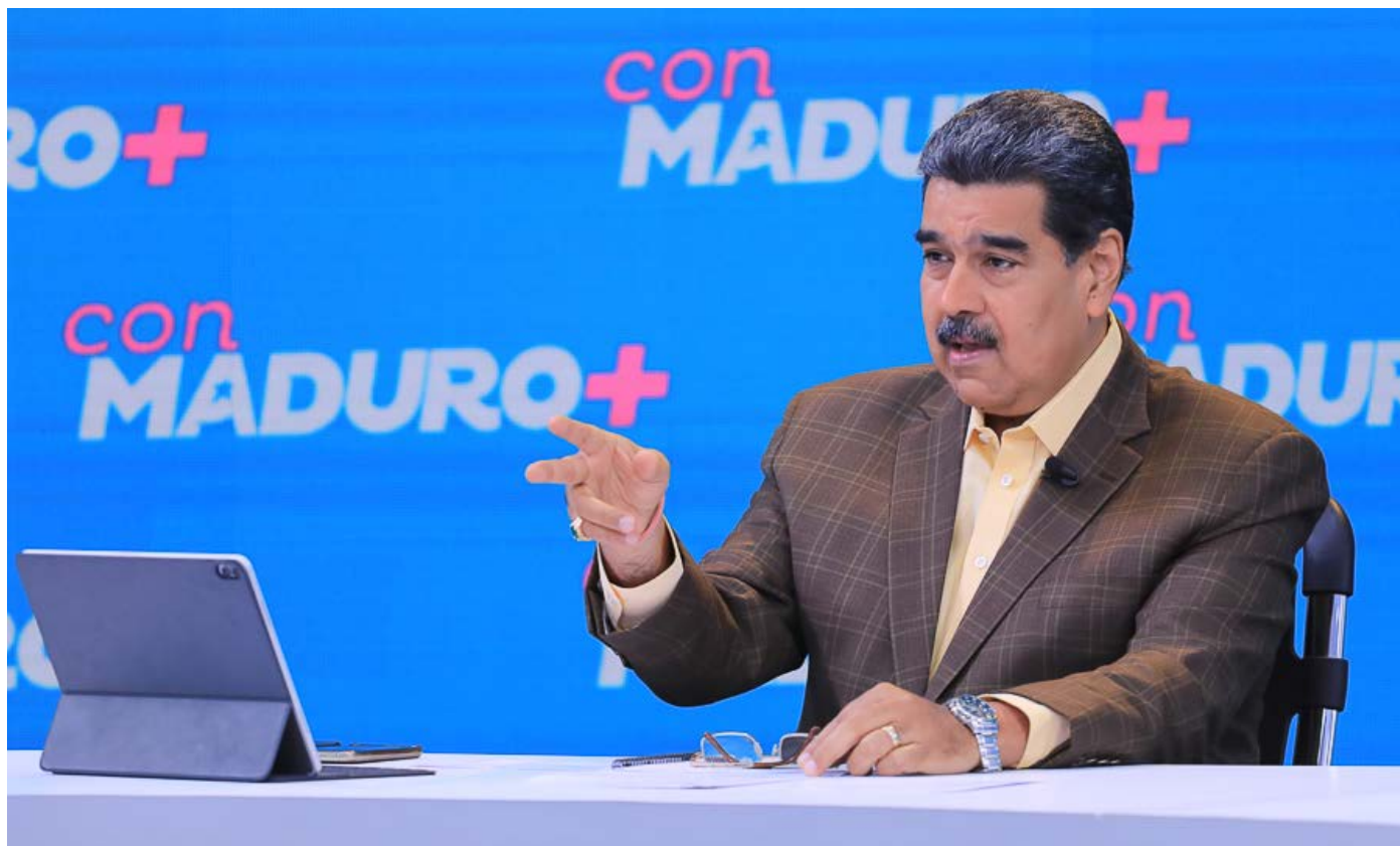
Bolivarian Government faces uphill battle against illegal mining

T he President of the Bolivarian Republic of Venezuela, Nicolás Maduro, expressed his support for the revitalization of an agenda to preserve the Amazon, while highlighting the role of the Amazon Summit in Belém, Brazil, which will take place next August 8 and 9.