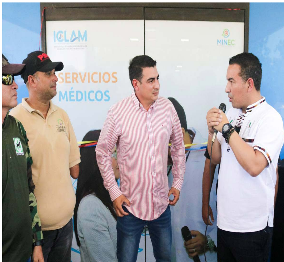
Health care will be provided in two shifts

T he Minister of People's Power for Ecosocialism, Josué Lorca, reopened the medical service of the institution he heads, at the headquarters of the Institute for the Control and Conservation of the Maracaibo Lake Basin (Iclam), located in the city of Maracaibo in the state of Zulia.