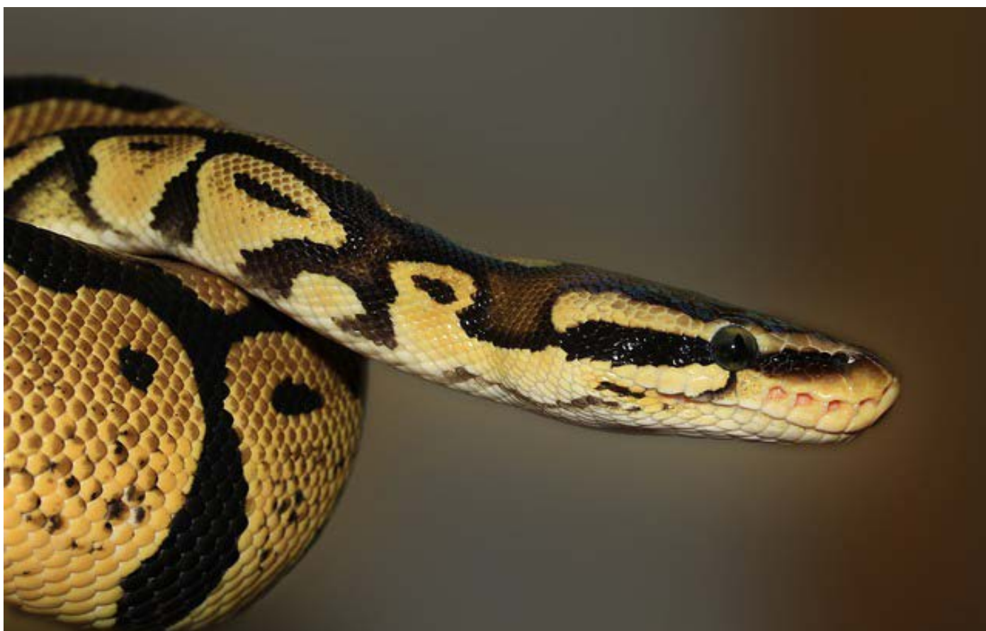
Snakes are feared for their venoms

The Ministry of People's Power for Ecosocialism (Minec), on this date recalls the importance of snakes and seeks to raise awareness among the population about their protection and respect for their habitat, in order to dispel the effects of ignorance about their behavior and avoid hunting them.