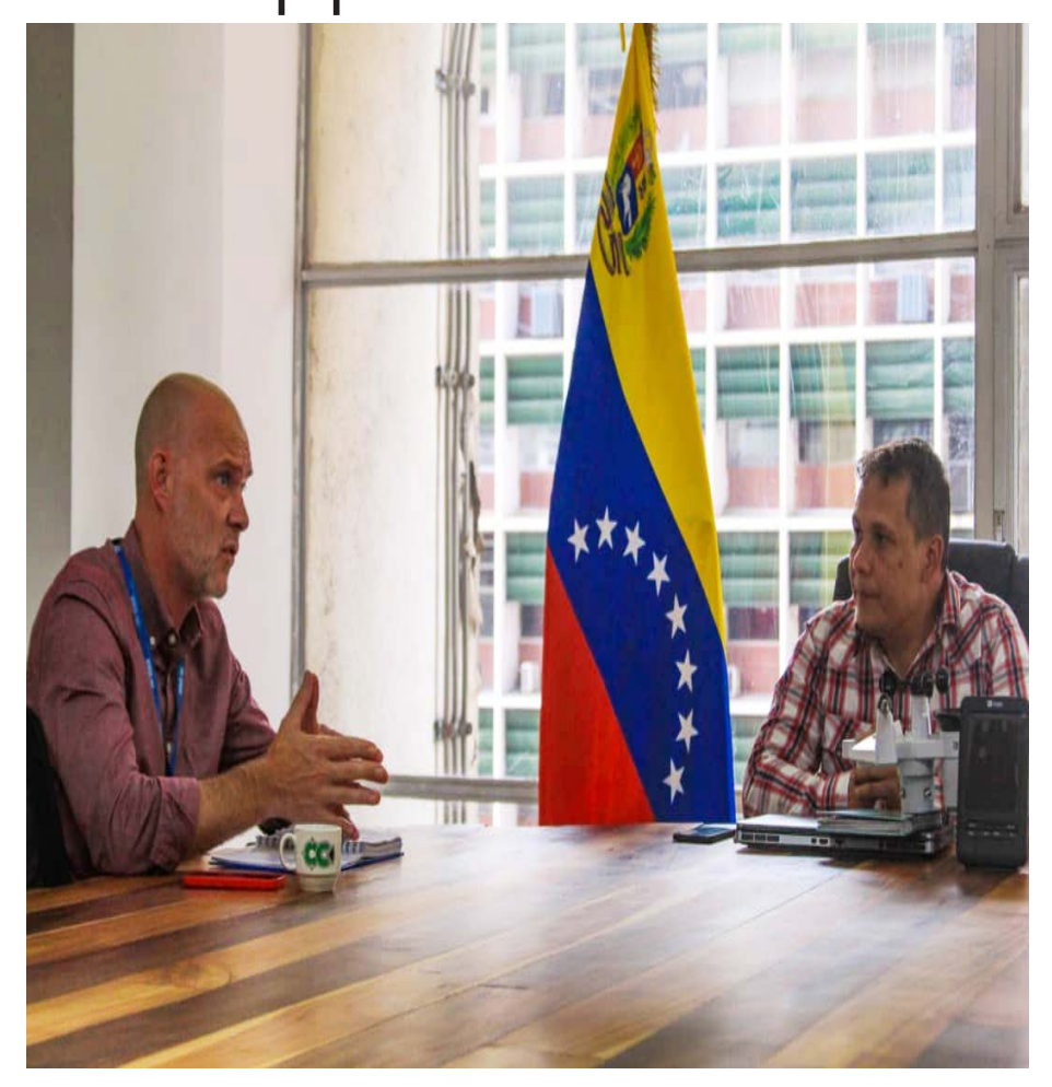
Adaptation and mitigation processes will be addressed in the face of climate crisis

he Ministry of People's Power for Ecosocialism (Minec) and representatives of the United Nations Agency for Refugees (UNHCR) discussed the vulnerable populations in the face of the climate crisis.