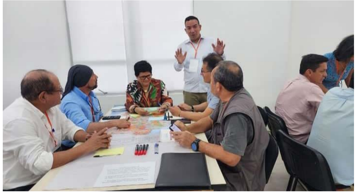
They addressed issues such as deforestation, transnational environmental crimes, conservation strategies, among others

"Here we were able to observe the exchange of ideas from all sectors, to address the problems of the Amazon Basin, with concrete proposals to address the climate crisis we are facing," he explained.