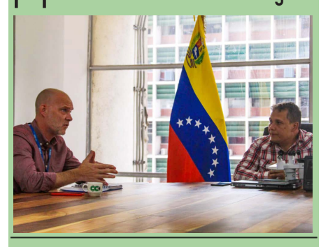
Promotion and mapping of possible linkages

Minec promotes transformation of the productive model in "the economy behind solid waste" (Pág. 6)