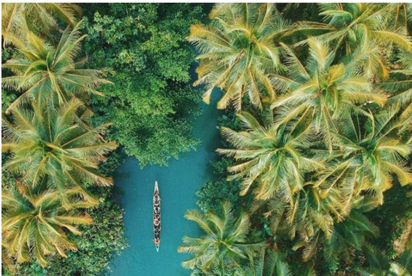
Deforestation and logging are prevalent in tropical areas

The aim is to raise awareness of the specific challenges facing the tropics, the far-reaching consequences of the problems affecting the world's tropics and the need, at all levels, to raise awareness and highlight the important role that countries in the tropics will play in achieving the Sustainable Development Goals (SDGs).