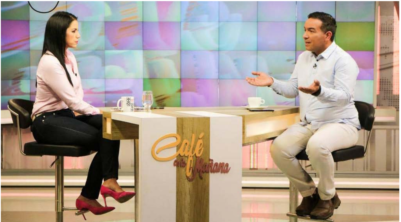
Vice-presidency of Public Works and Services generated manual for solid waste collection

T he Minister of People's Power for Ecosocialism, Josué Lorca, explained the policies for addressing solid waste, as well as the conversation of natural spaces in the country, which include national deployments.