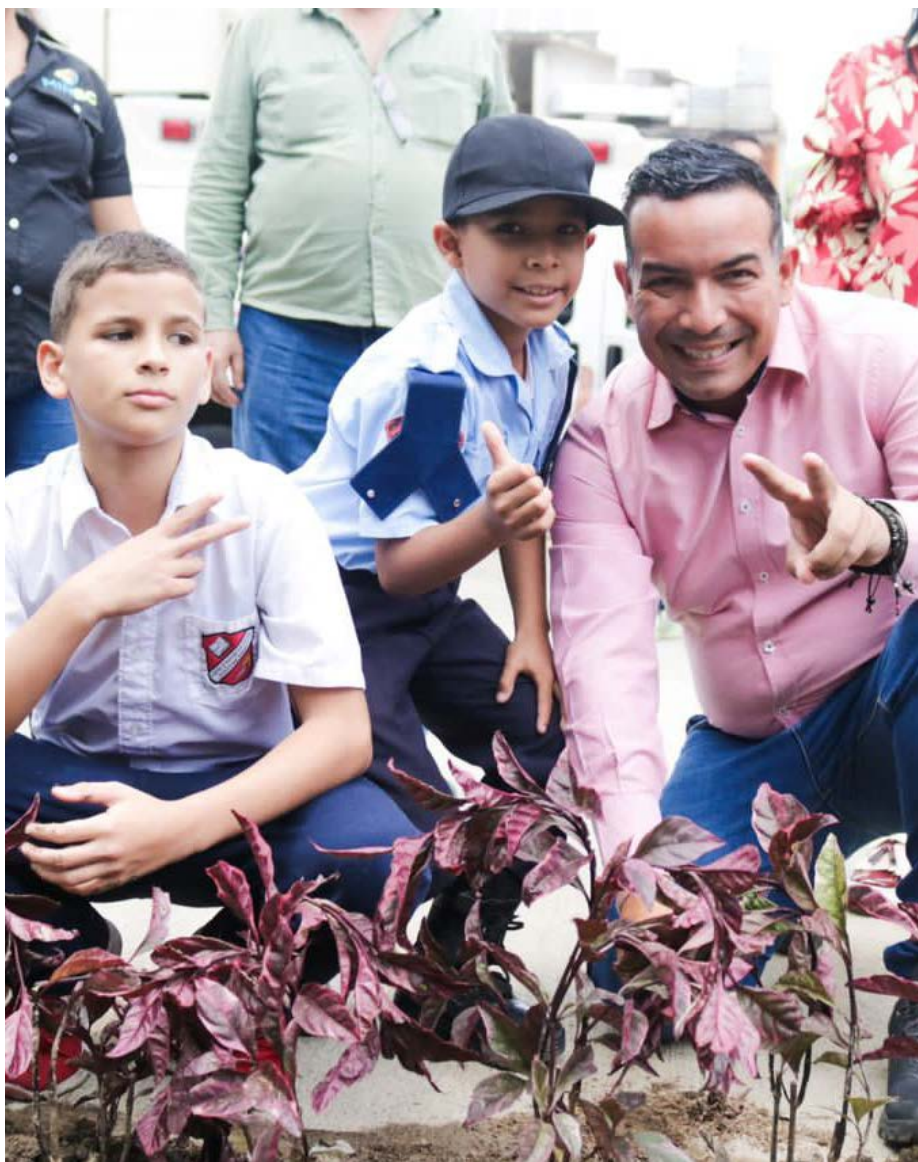
Minec provided technical assistance for the restoration of the space

He emphasized that "here, people from those housing developments on Bolívar Avenue, those from San