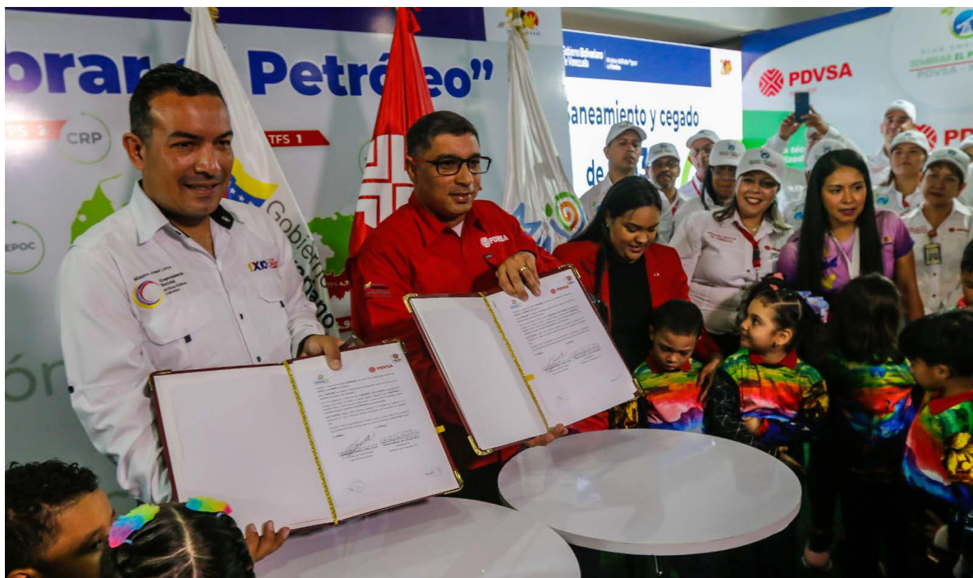
PDVSA workers to form environmental brigades

"This is a great victory, let's start then, green oil, green gas, let's start our green petrochemicals and let's start to clean up", he concluded.