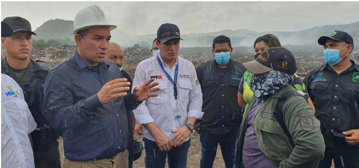
The works will cover an area of 14 hectares