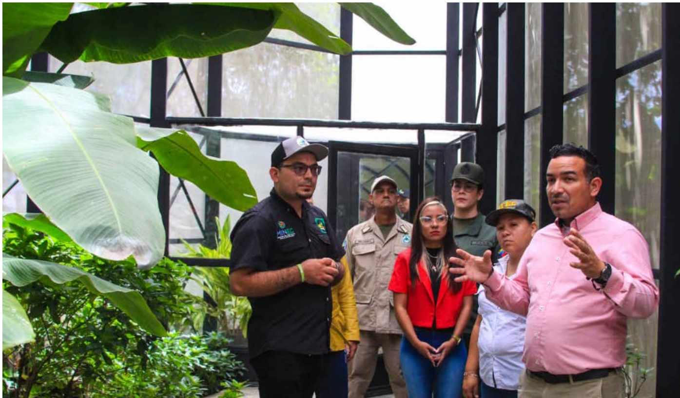
The Insectarium of Venezuela is unique in its kind and species

T he Minister of People's Power for Ecosocialism, Josué Lorca, headed the reopening of the insectarium of El Pinar Zoo Recreational Park, located in the parish of El Paraíso, in the capital city.