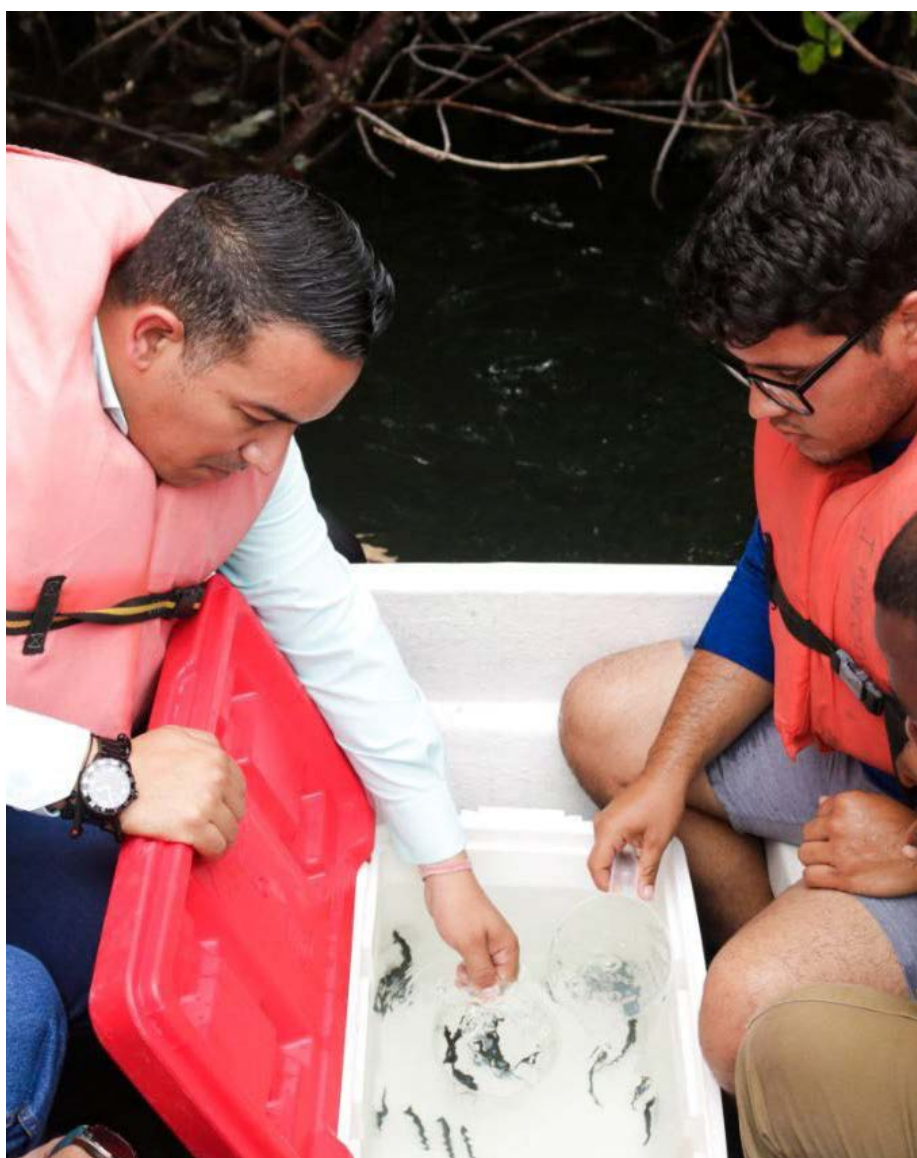
There is a laboratory near the lagoon with about 15,000 animals.

He added that the inclusion in Appendix 2 of Cites "requires its protection and also allows its exploitation in a percentage".