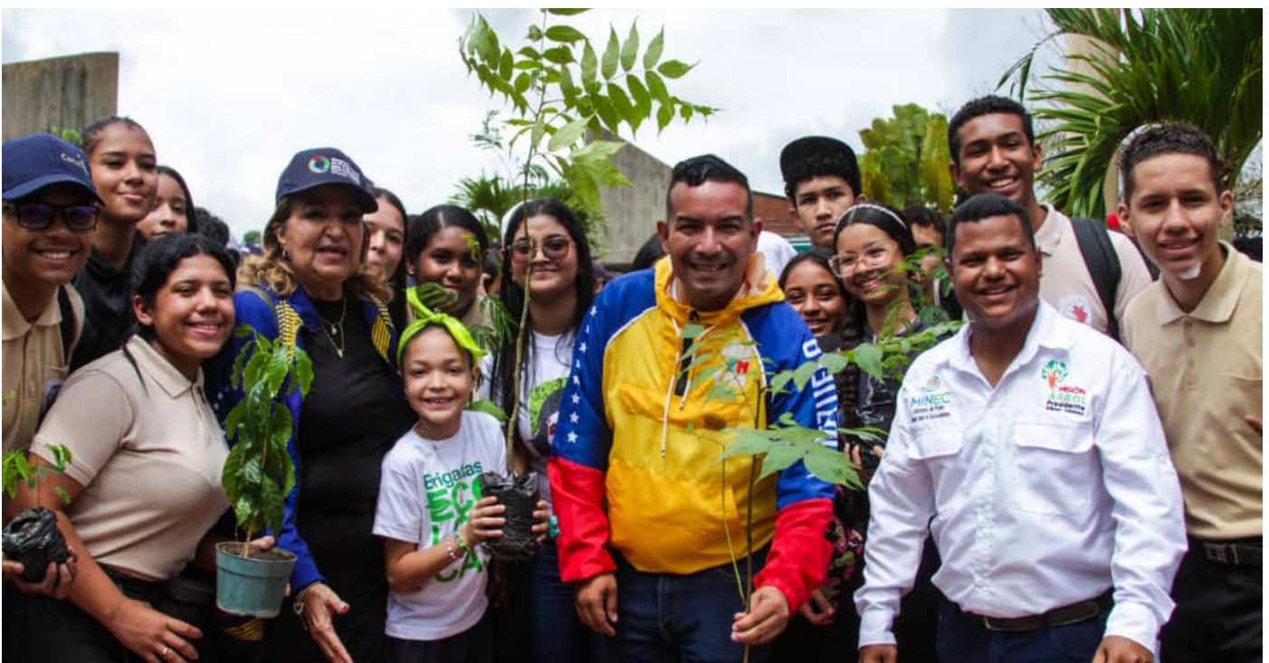
Mission Tree has been planting for 17 years