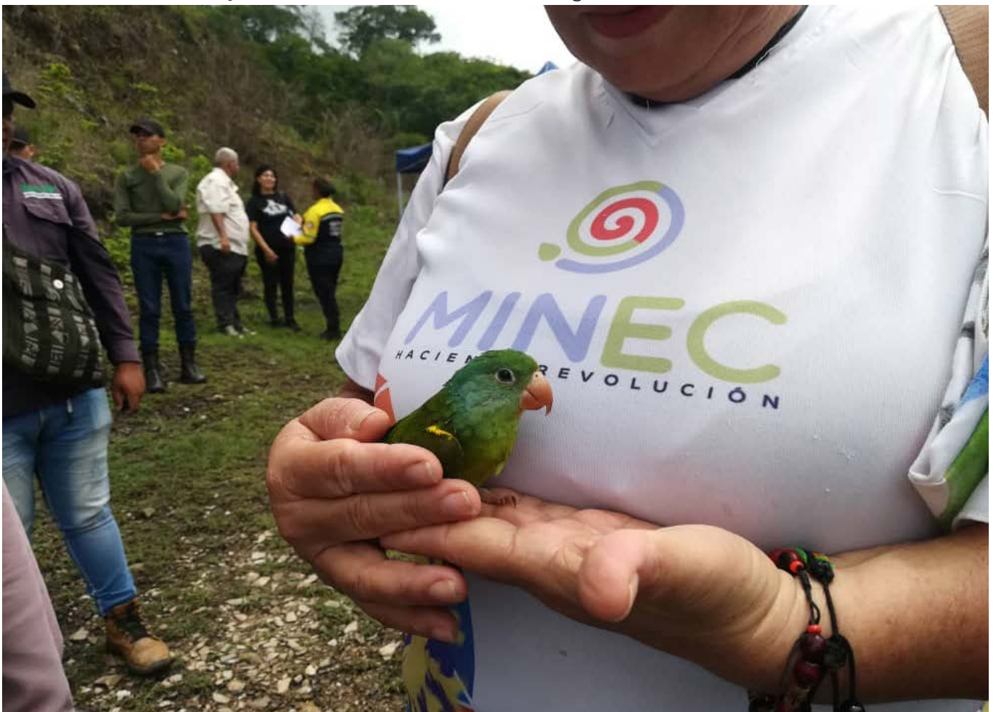
Species release is part of Conservation Program

Currently, the species is very compromised and its main predator is the human being, since it is trafficked for the consumption of its meat, the use of its bones and the trade of its shell for the realization of various handicrafts.