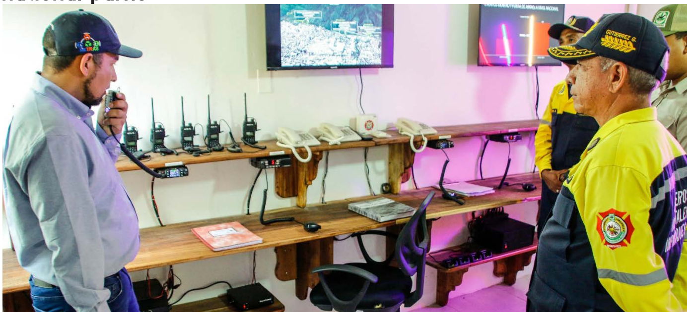
Men and women in blue received awards for their praiseworthy work to protect, care for and preserve the Pachamama

T he Minister of People's Power for Ecosocialism, Josué Lorca, activated the Control and Communications Room of the Forest Fire Department of the National Parks Institute (Inparques), in the central headquarters of the aforementioned fire department, thus strengthening the response capacity and immediate attention to emergencies within the national parks.