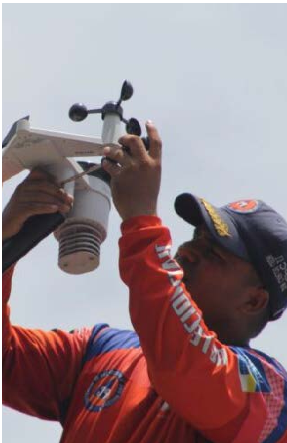
Monitoring will be carried out by the National Risk System through Civil Protection

La Mar; Los Cascabeles and Guaracarumbo creek in Urimare; San Julián, La Chara, Quebrada Seca creeks, in Caraballeda; El Brillante dam and Piedra Azul river, in Maiquetía.