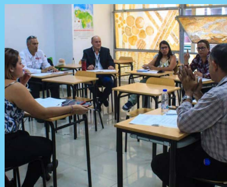
Venezuela seeks to position itself in environmental management on an international scale

He emphasized that the approval of this text will be given in a period of 2 to 3 years, so that once the proposals of all the countries have been presented, the document will be officially presented.