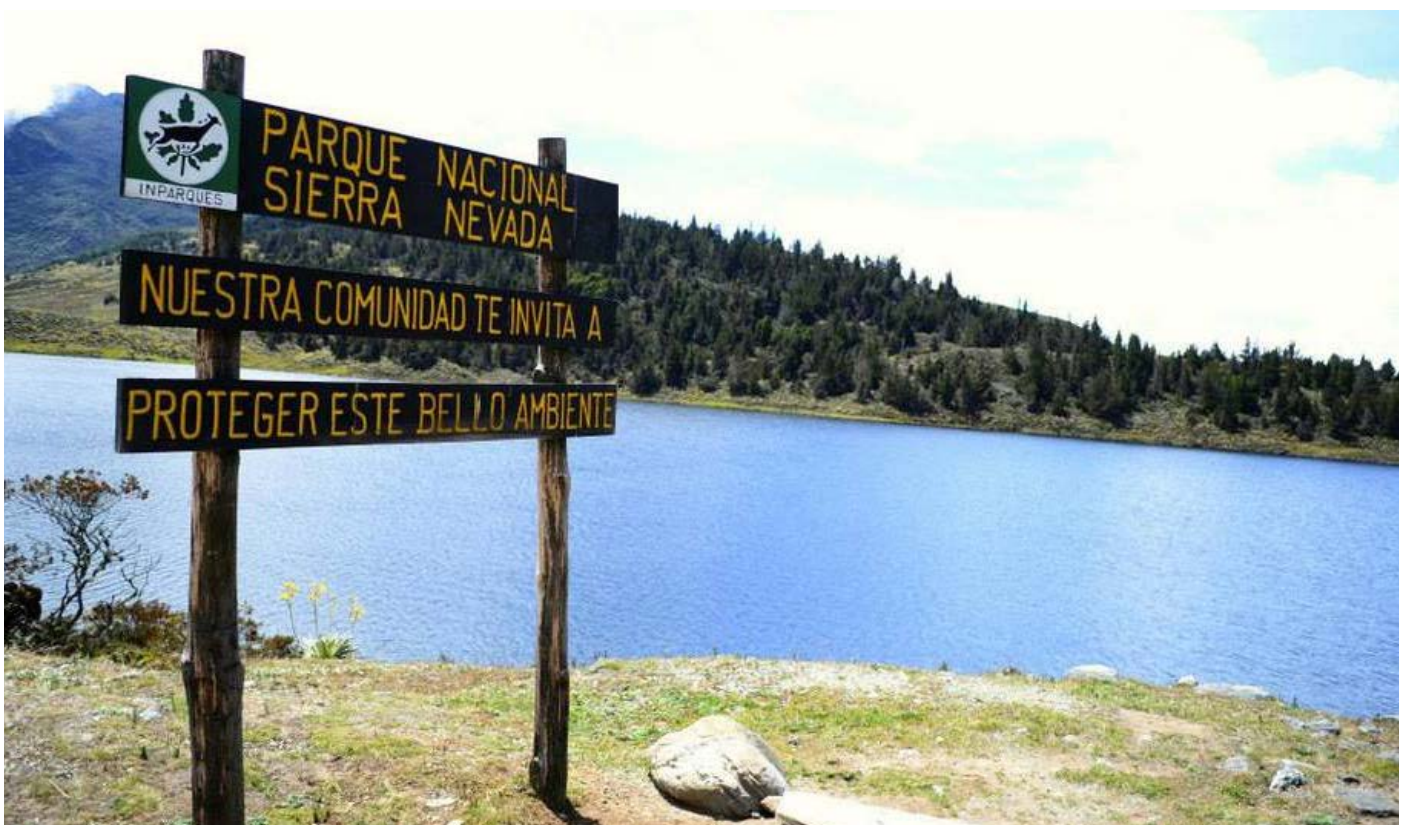
It is considered one of the parks with the most scenic natural beauty

The most popular access to the park is via the Mérida Cable Car. Another important entrance is by land through the town of Tabay, in the area of La Mucuy, through the Sierra Nevada Park, in a journey through the Coromoto, La Verde and El Suero lagoons, bordering the Humboldt and La Concha peaks, the base zone to climb Pick Bolívar on the south side, and reaching Pick of Mirror on the southeastern backside.