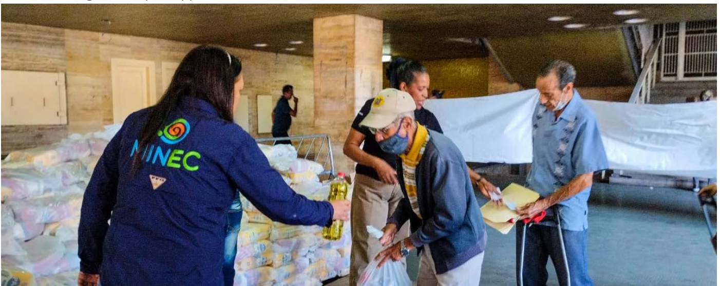
Integral Care Plan for male and female workers successfully developed

Also during this short period of the month of May, collective birthdays were celebrated, as is done month after month.