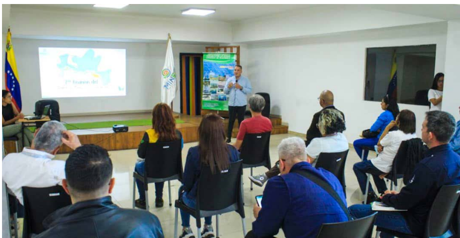
Regular and special meetings will be held