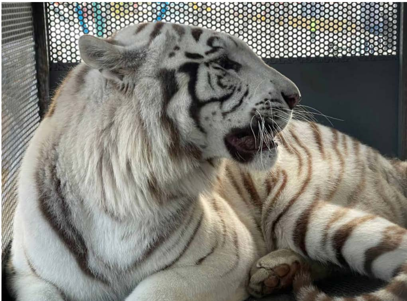
They already live in the El Pinar Zoological Park and in the Caricuao Zoological Park

The acquisition of these four Bengal tigers comes almost a year after the Venezuelan government bought three white lions from the Czech Republic in June 2022.