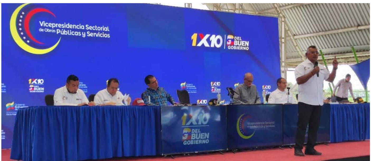
Minec assumed the commitment to reforest the main basins of Barinas

Additionally, a Transport Route Plan was prepared for the benefit of 32,245 inhabitants of the Barinas municipality and the adequacy of the Barinense Socialist Enterprise for solid waste (Esobandes) and the sanitary landfill of the Barinas Northwestern Commonwealth.