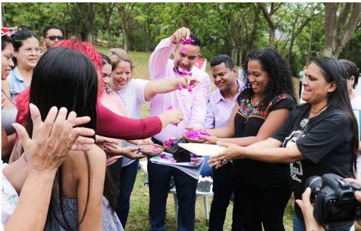
More than 2 thousand women participate in this activity throughout the country