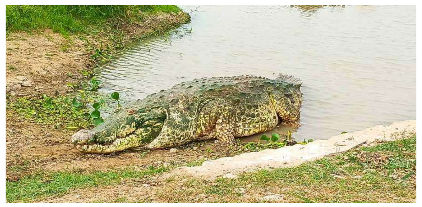
The Orinoco Caiman became an endangered species

very April 20, the National Day of the Orinoco caiman (Crocodylus intermedius) is celebrated in Venezuela, one of the largest reptile species that is in danger of extinction.