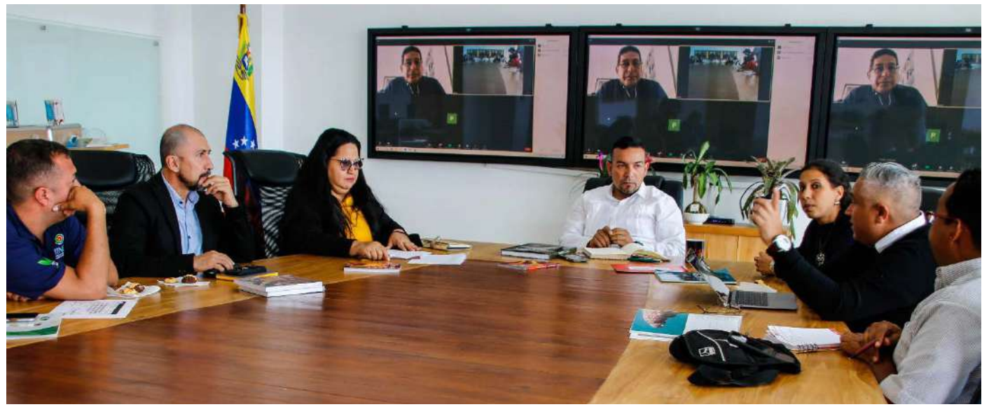
They will include Venezuela in the National Whaling Commission