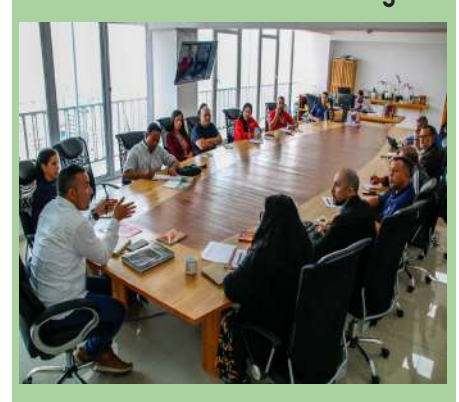
Youth training in Barquisimeto

Colombia and Venezuela will carry out a scientific expedition to study the bottlenose dolphin of the Orinoco (Page 5)