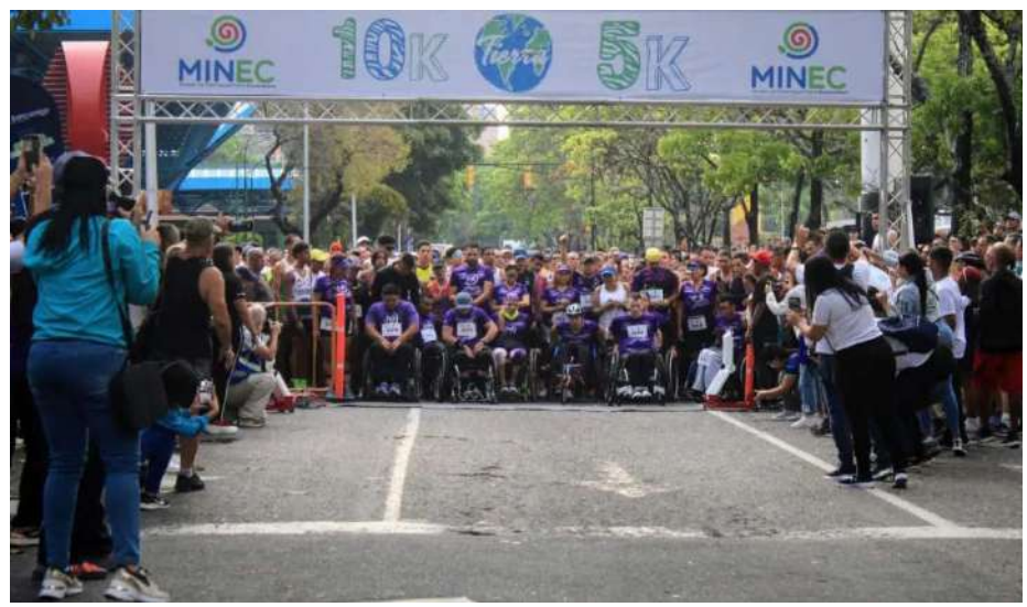
The People's Power Minister for Ecosocialism (Minec), Josué Lorca, participated in the 5-kilometer walk of the "Race for the Earth", and delivered the prizes to the different category winners. (More information page 2).

Comprehensive care for the effects of Climate Change