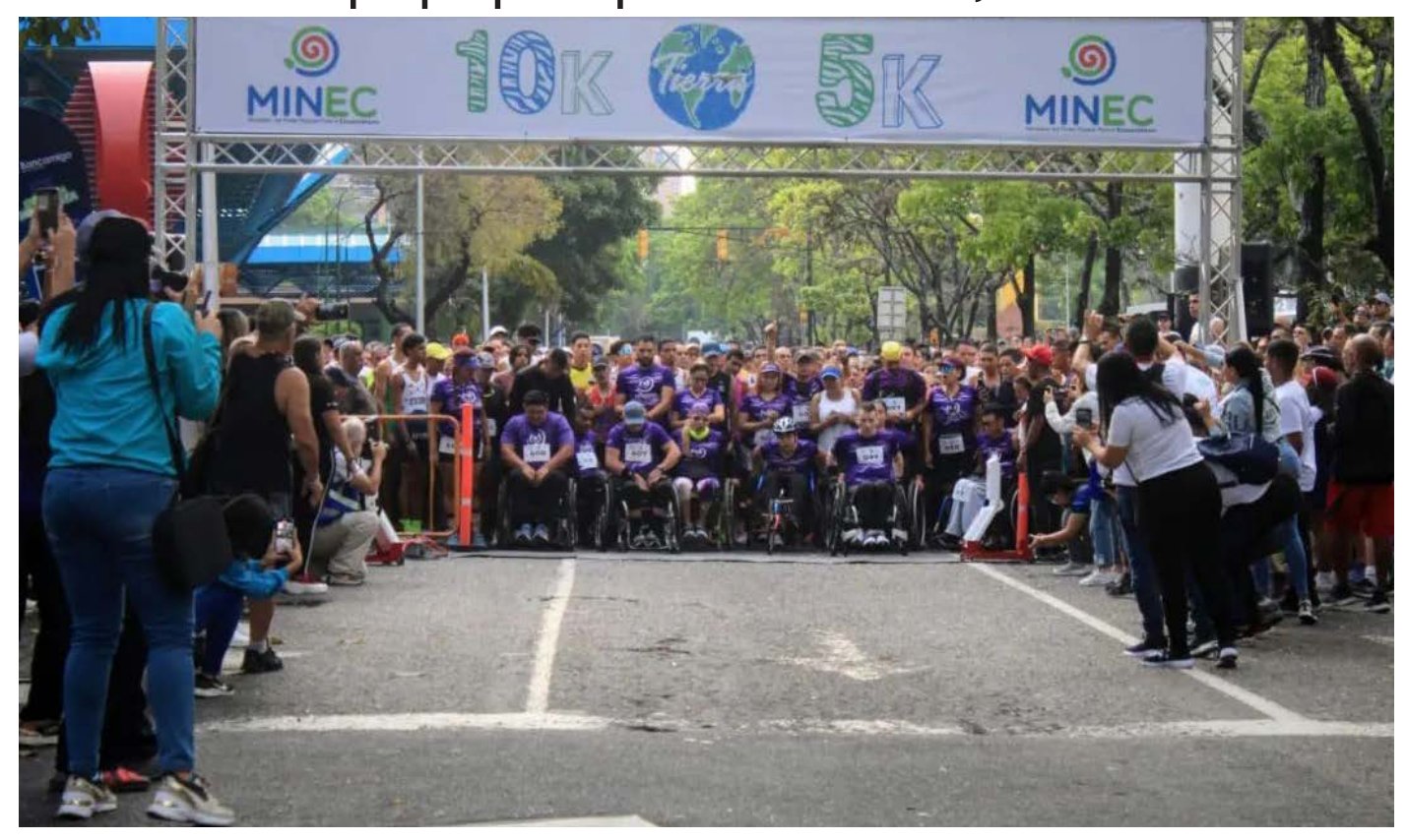
Participants applauded the initiative in favor of the planet and sport

he People's Power Minister for Ecosocialism (Minec), Josué Lorca, participated in the 5 kilometer (k) walk of the "Race for the Earth", and delivered the prizes to the different category winners.