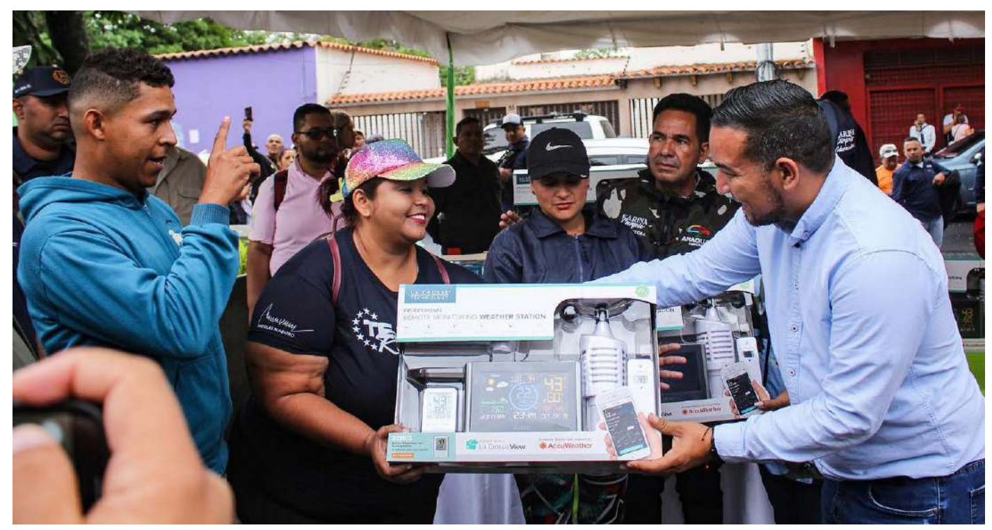
Venezuela develops environmental policies that empower Popular Power

Said initiative is part of the strategies of the Bolivarian Government to strengthen environmental policies and empower People's Power, as well as promoting collective awareness, self-management capacity and the generation of data that serve as the basis for early warnings.