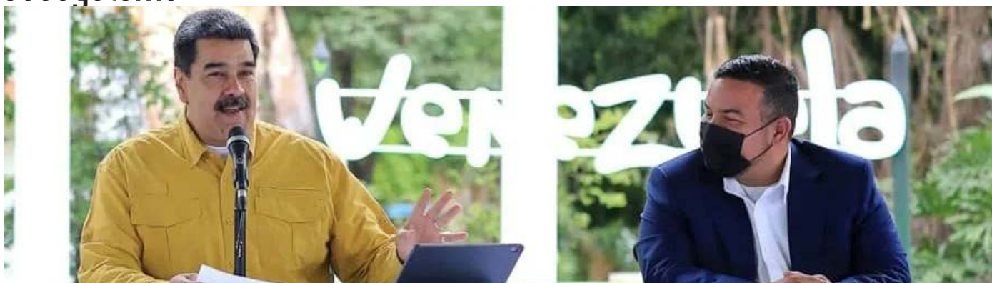
President Maduro has stood out for his leadership and political-social activism

O n March 14, 10 years ago, the Venezuelan people elected Nicolás Maduro Moros as president of the Bolivarian Republic of Venezuela.