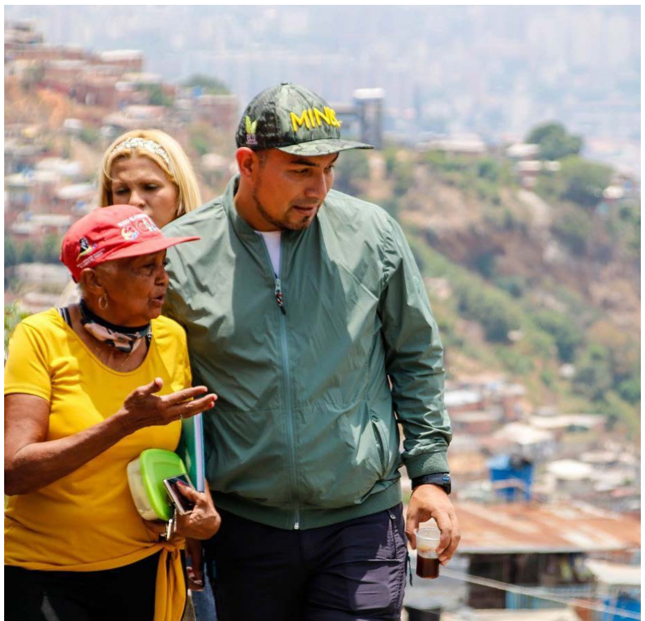
Minec promotes the implementation of good environmental and ecological practices

The Minec, through the Ecosocialist Management team, disseminates in the communities the recognition of the existence of spaces that present multiple risks, in addition to stressing that managing accurate and timely information contributes to the mitigation of the climate crisis.