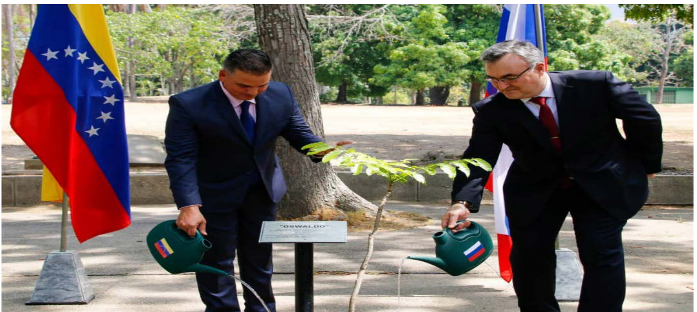
The Russian ambassador Sergey Mélik-Bagdasarov reminded the minister Oswaldo Barbera

The event closed with the irrigation of a plant, established two years ago with the then Minister for Ecosocialism Oswaldo Barbera, in commemoration of the 60th anniversary of the first space flight with a human crew. The plantation was a representation of the beauty, continuity and eternity of life, and in whose roots lies a time capsule with a message for future generations of wishes for peace and prosperity.