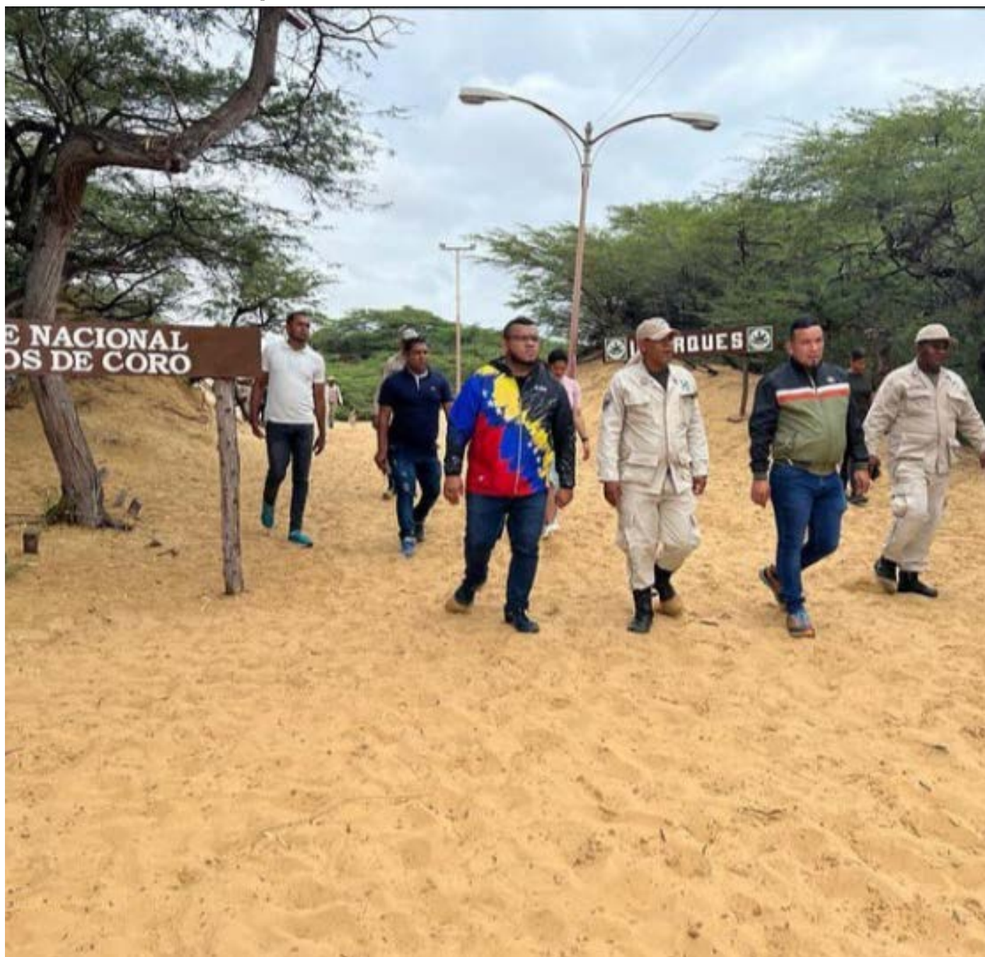
They confirm the operation of the "Give the Tail to your Garbage" program

A s part of the development of the Safe and Happy Easter Week 2023, the People's Power Minister for Ecosocialism, Josué Lorca, verified the mobilization of vacationers in the Médanos de Coro Recreational Park in Falcón state, one of the tourist destinations with the most visits.