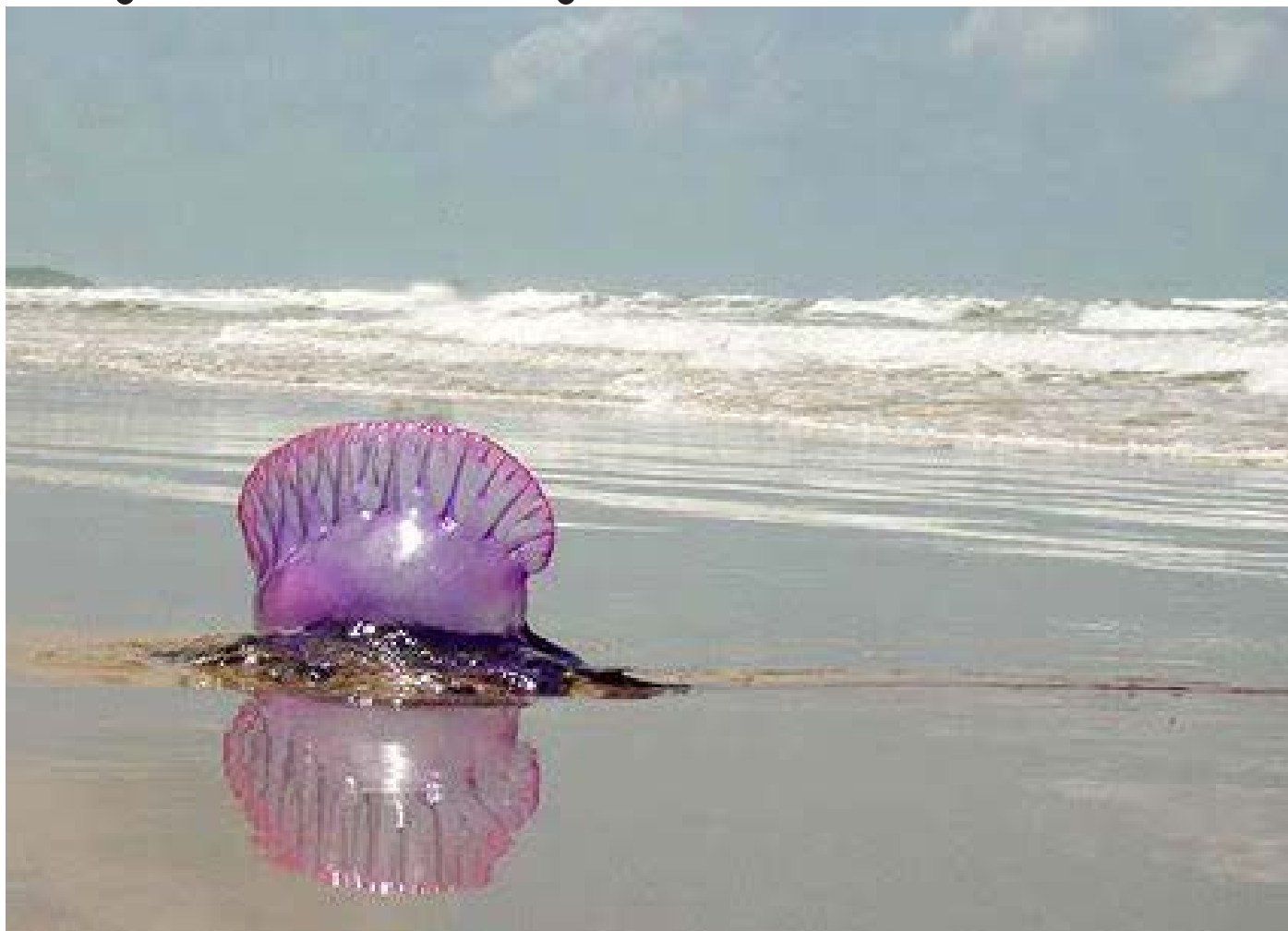
The so-called Portuguese man-of-war (Physalia physalis) is a monotypic species of hydrozoan

T he Ministry of People's Power for Ecosocialism (Minec), alerted locals and visitors to the coasts of the states of Aragua, Falcón and Yaracuy, about the presence of specimens of the so-called "Portuguese Frigate, Bad Water or Portuguese Galera (Physalia physalis)".