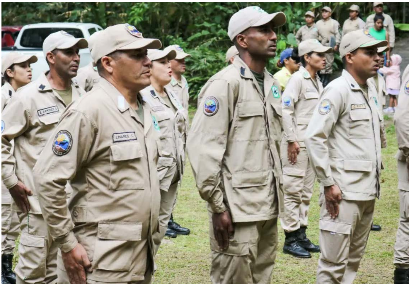
Actualmente el Cuerpo Civil de Guardaparques cuenta con 5.522 efectivos