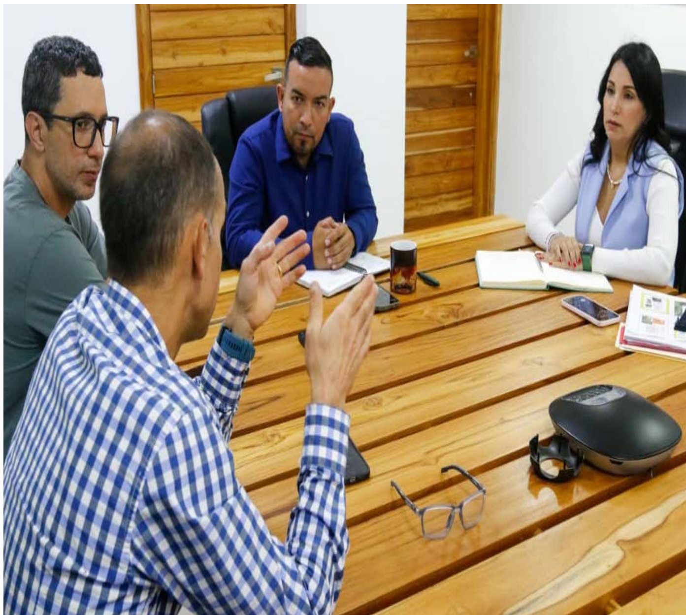
Bancamiga has a social and human commitment to the environment