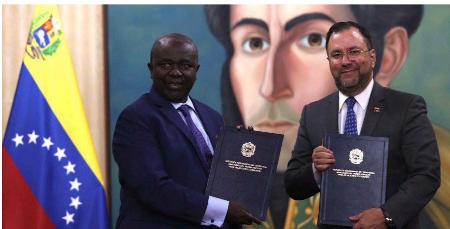
Venezuela and Guinea-Bissau signed 15 bilateral agreements