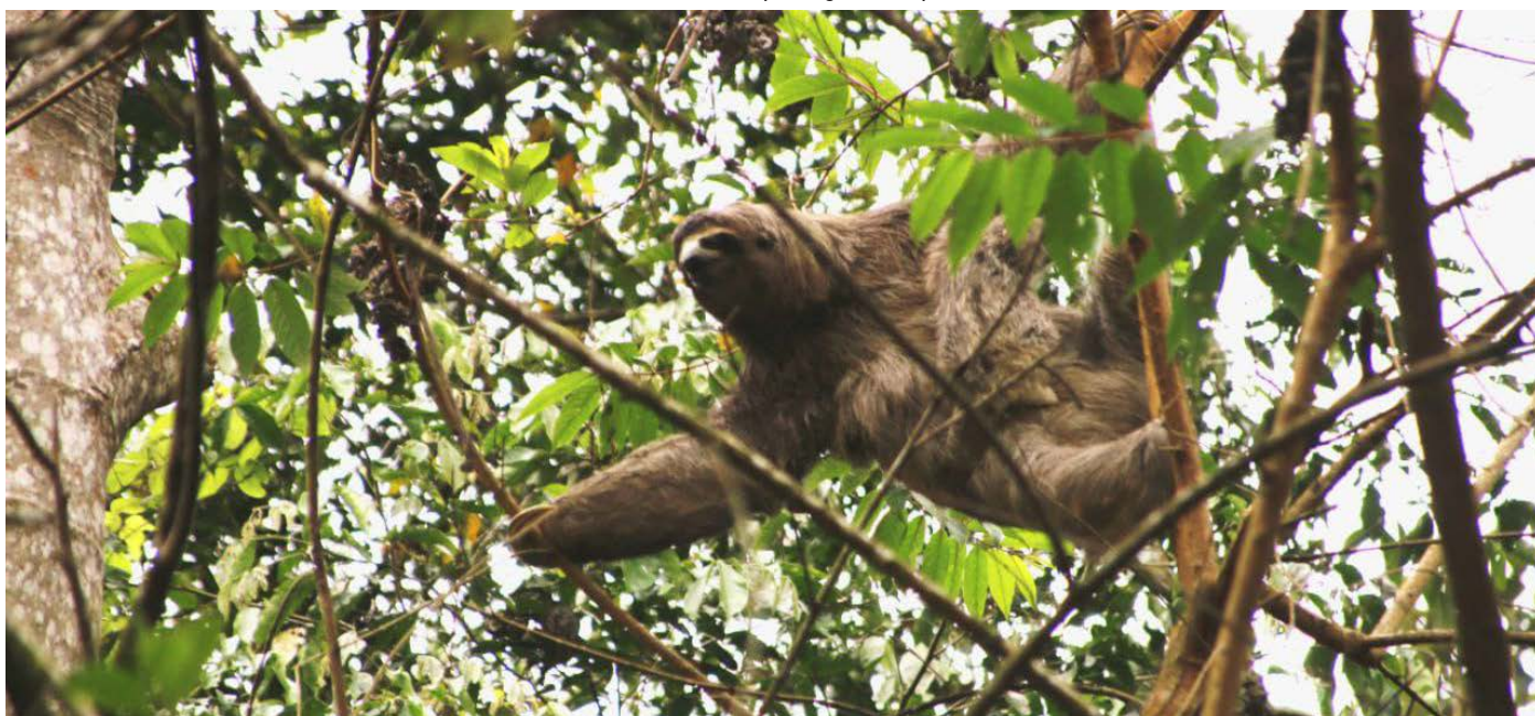
Rescue and release delegation was made up of 12 people

The animals were under the protection of the members of the Chuwie Foundation, an organization that maintains a rescue and rehabilitation center for sloths in Los Altos Mirandinos, until last Friday when they proceeded with the release in areas considered suitable for their development.