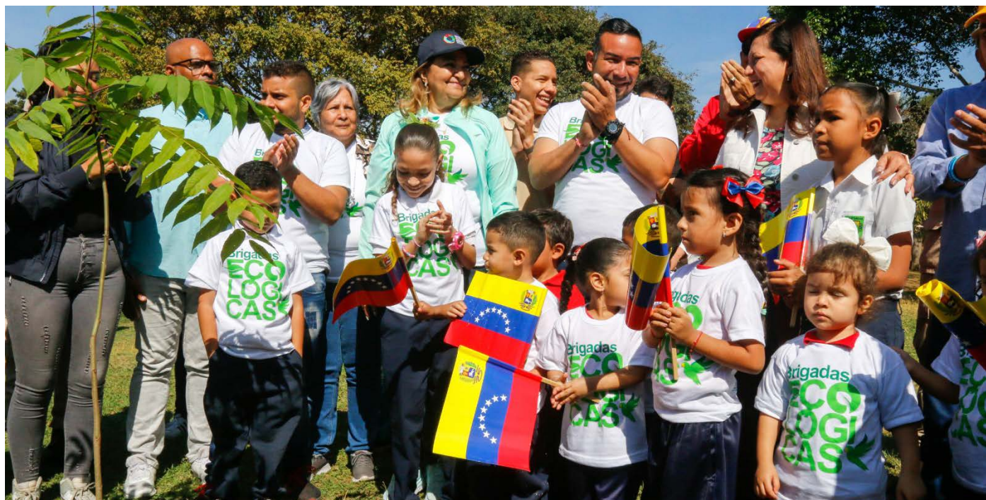
The Caracas walnut is a tree that is in critical danger of extinction

T he People's Power Minister for Ecosocialism, Josué Lorca, and his counterpart for Education, Yelitze Santaella, swore in 1,342 Student Ecological Brigades, in an act that took place in the Ali Primera Recreational Park, west of Caracas.