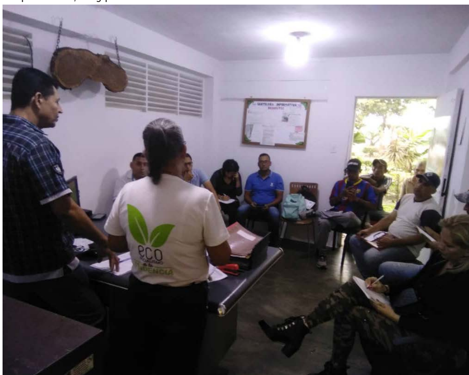
Training for the Registration of Activities Capable of Degrading the Environment

This induction complies with the guidelines indicated by President Nicolás Maduro Moros, executed by the Minec in the Andean region.