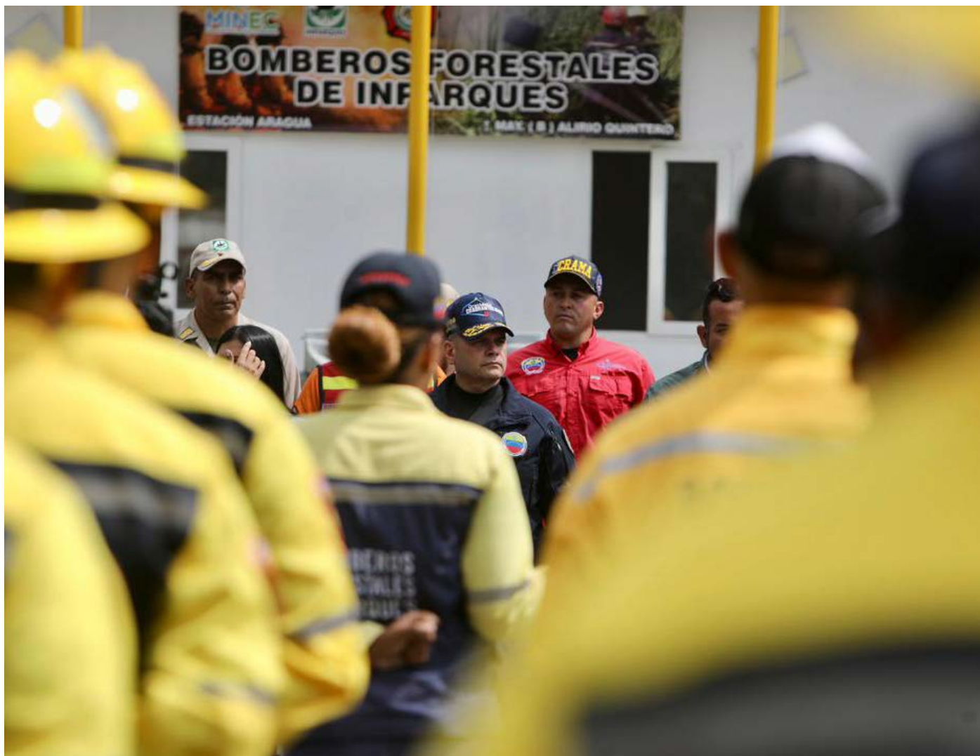
Bolivarian Government decorated 53 firefighters and forest firefighters