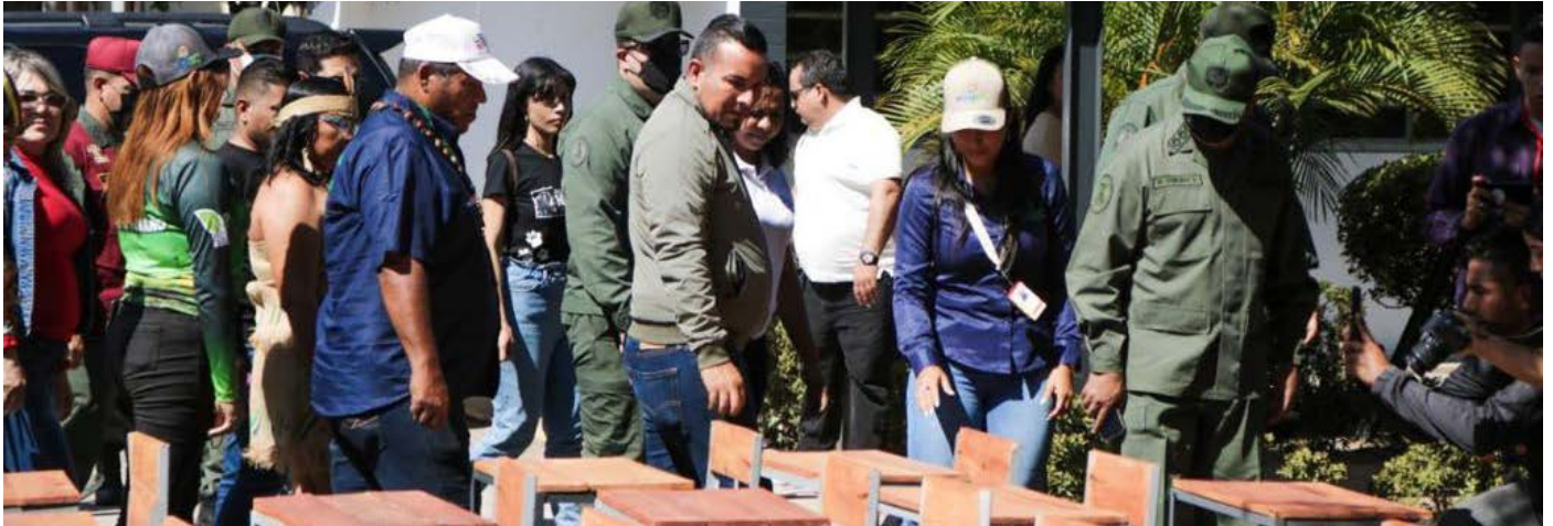
Dignified and quality tables-chairs for learning

T he Ministry of People's Power for Ecosocialism promoted the construction and delivery of 300 decent and quality tables-chairs, in which wood and other materials were used, to achieve a modern, resistant and environmentally friendly product, in search of effective learning and comfortable conditions for children and adolescents.