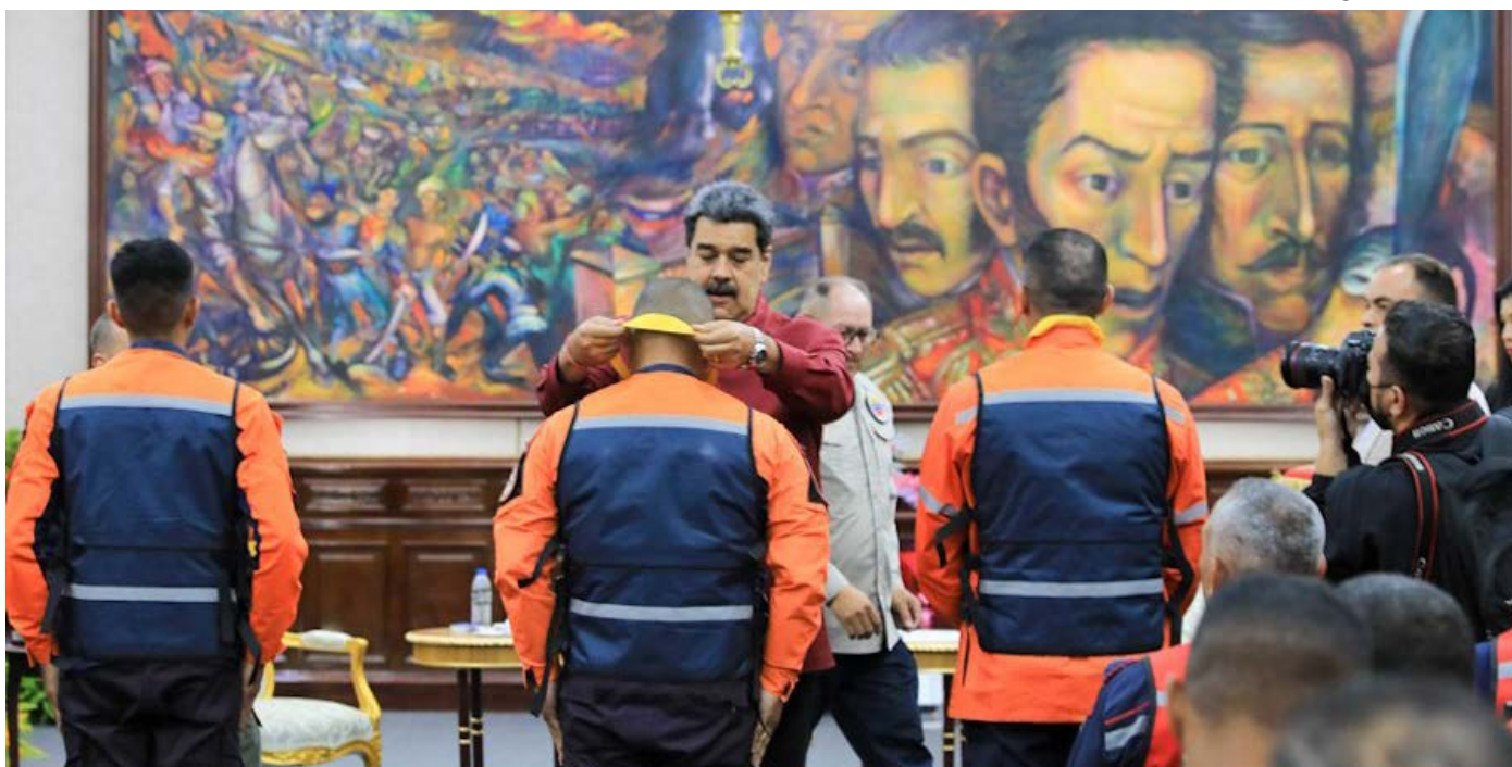
President Nicolás Maduro decorated the officials with the Francisco de Miranda Order in its Second Class

T he President of the Bolivarian Republic of Venezuela, Nicolás Maduro, awarded the Francisco de Miranda Order in its Second Class to the members of the Simón Bolívar Humanitarian Task Force who participated in the rescue work, after the earthquakes that occurred in the republics of Türkiye and Syria on February 6.