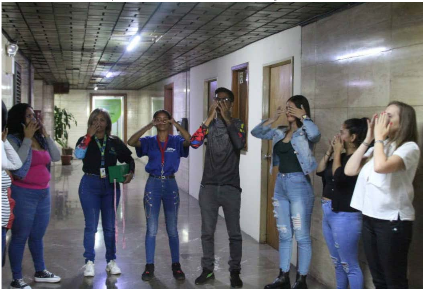
Activity seeks to develop cognitive, motor and physical abilities of the staff

"We have served many people, with an activity of approximately 15 minutes," said Utria.