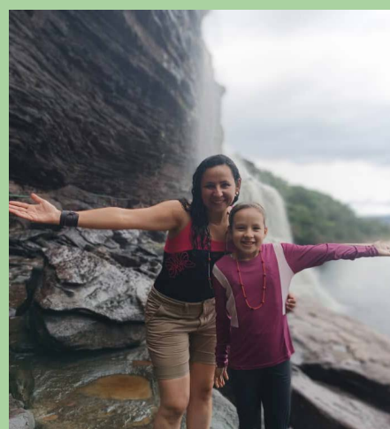
Winners of the First Poetry, Life and Planet Contest