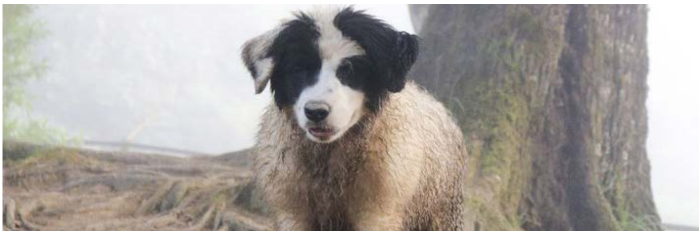
Mucuchíes has been recognized as a national dog since 1964

The story refers that the Liberator Simón Bolívar during a visit to San Rafael de Mucuchíes, received a dog of the aforementioned breed, given by a peasant as a courtesy gesture. The animal was named by Bolívar as Nevado.