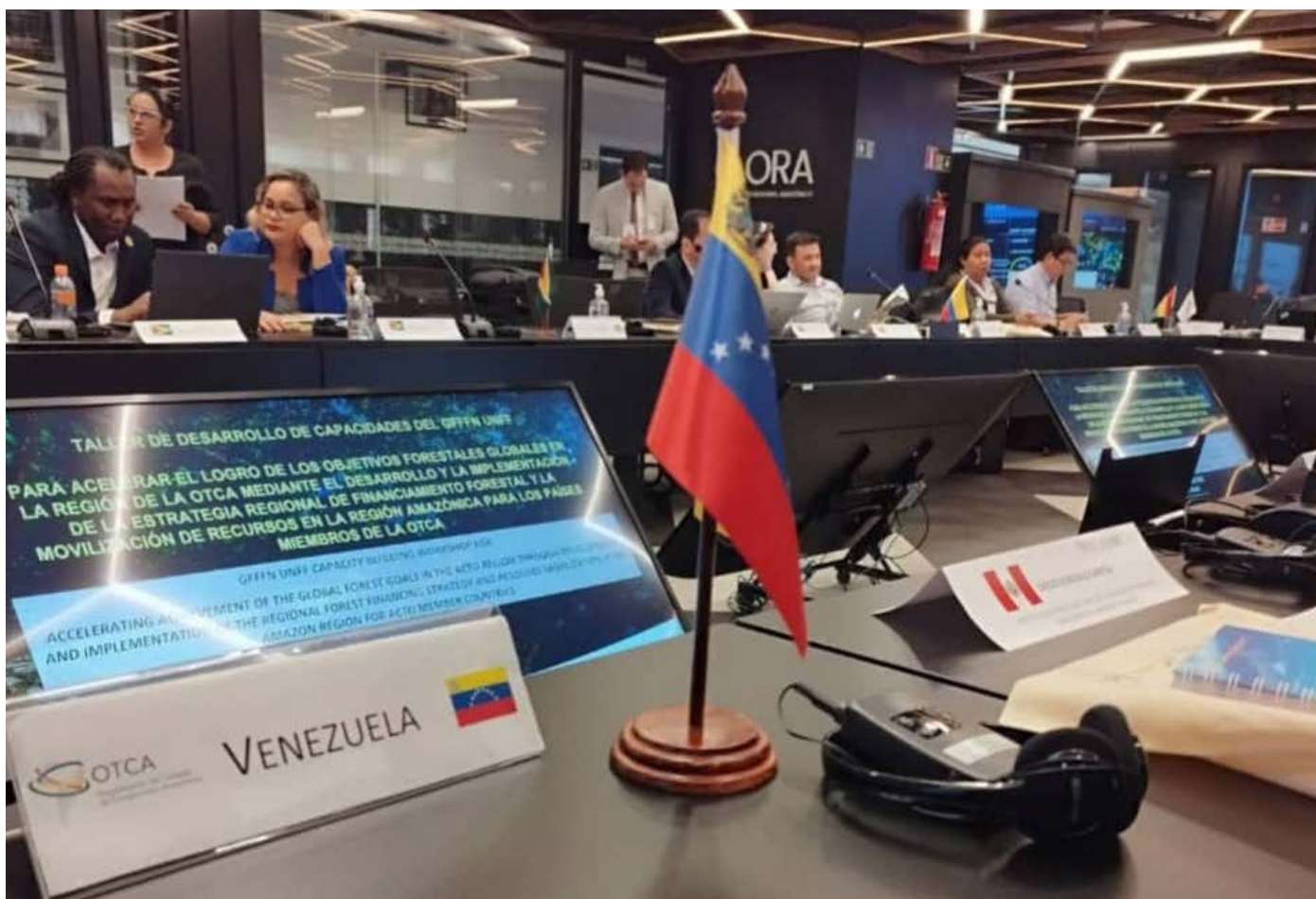
The conference was held between February 6 and 10, at the headquarters of the Amazon Regional Observatory