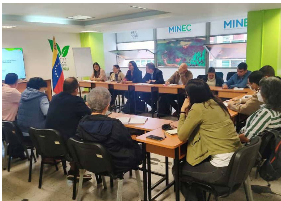
Venezuela advances in compliance with the Montreal Protocol

He added that the day "will allow us to take leaps and bounds not only in the control and gradual elimination of these