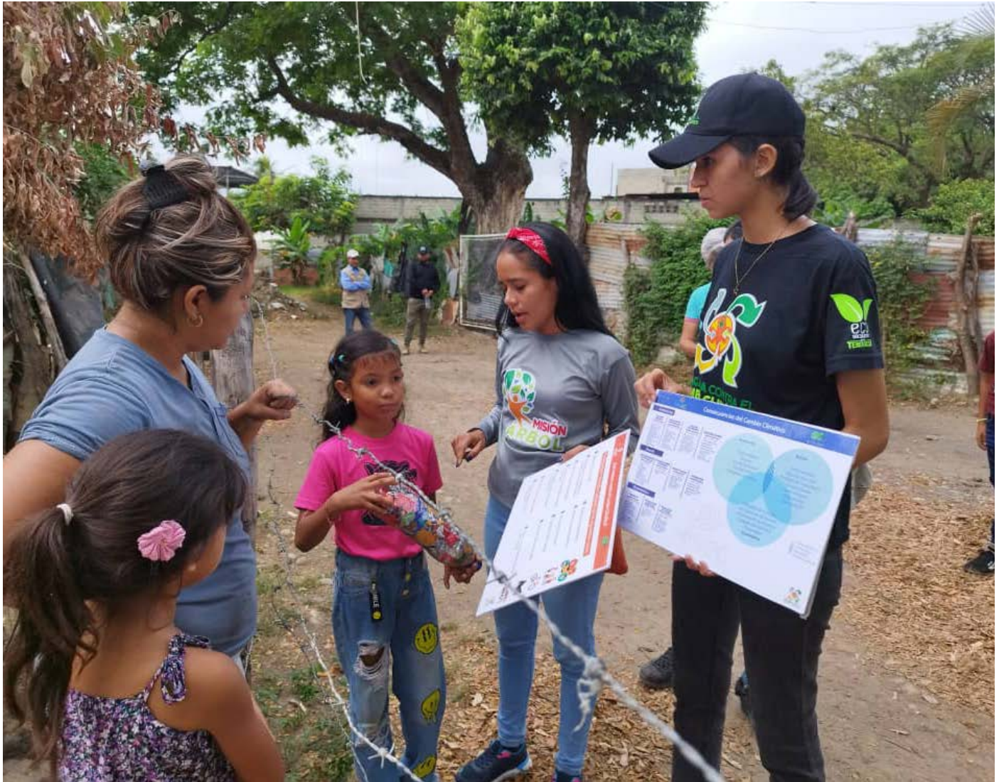
Awareness approach reached 28 communities

D uring the two days of the second National House-to-House Awareness Day "The climate crisis affects us all", 6,183 families living in 3,766 homes were addressed.