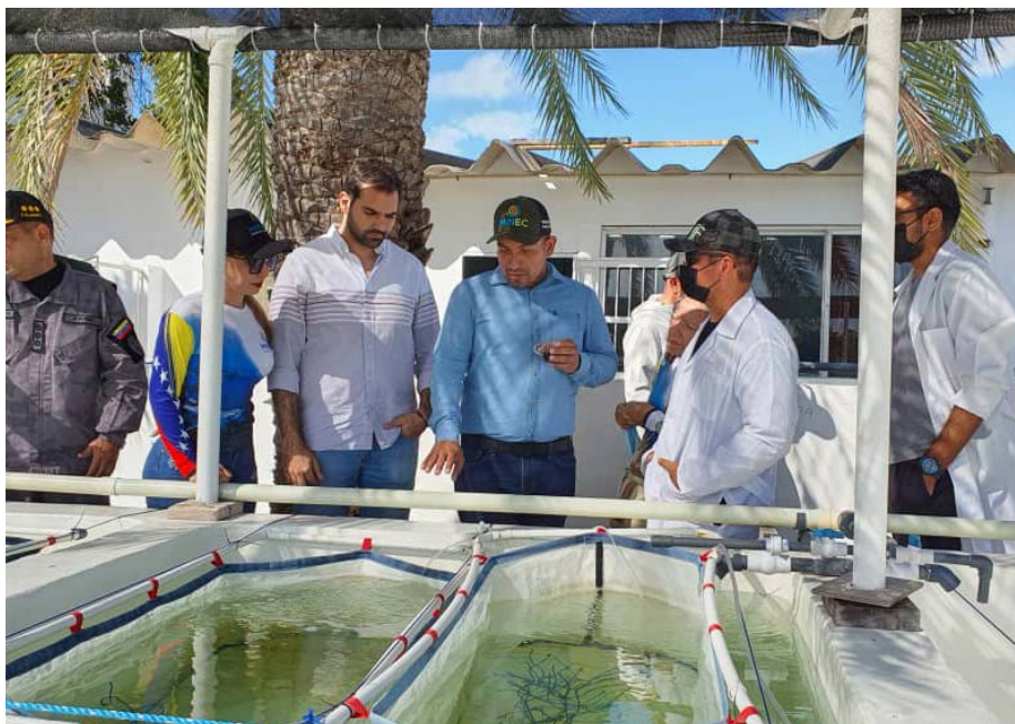
Seahorses will be reinserted into their natural environment

"The difference between males and females is that the male has an incubator bag, where he is able to store his young for a period of 21 days, and then release them with an average size of approximately 1 centimeter (cm)," he said. Benítez.