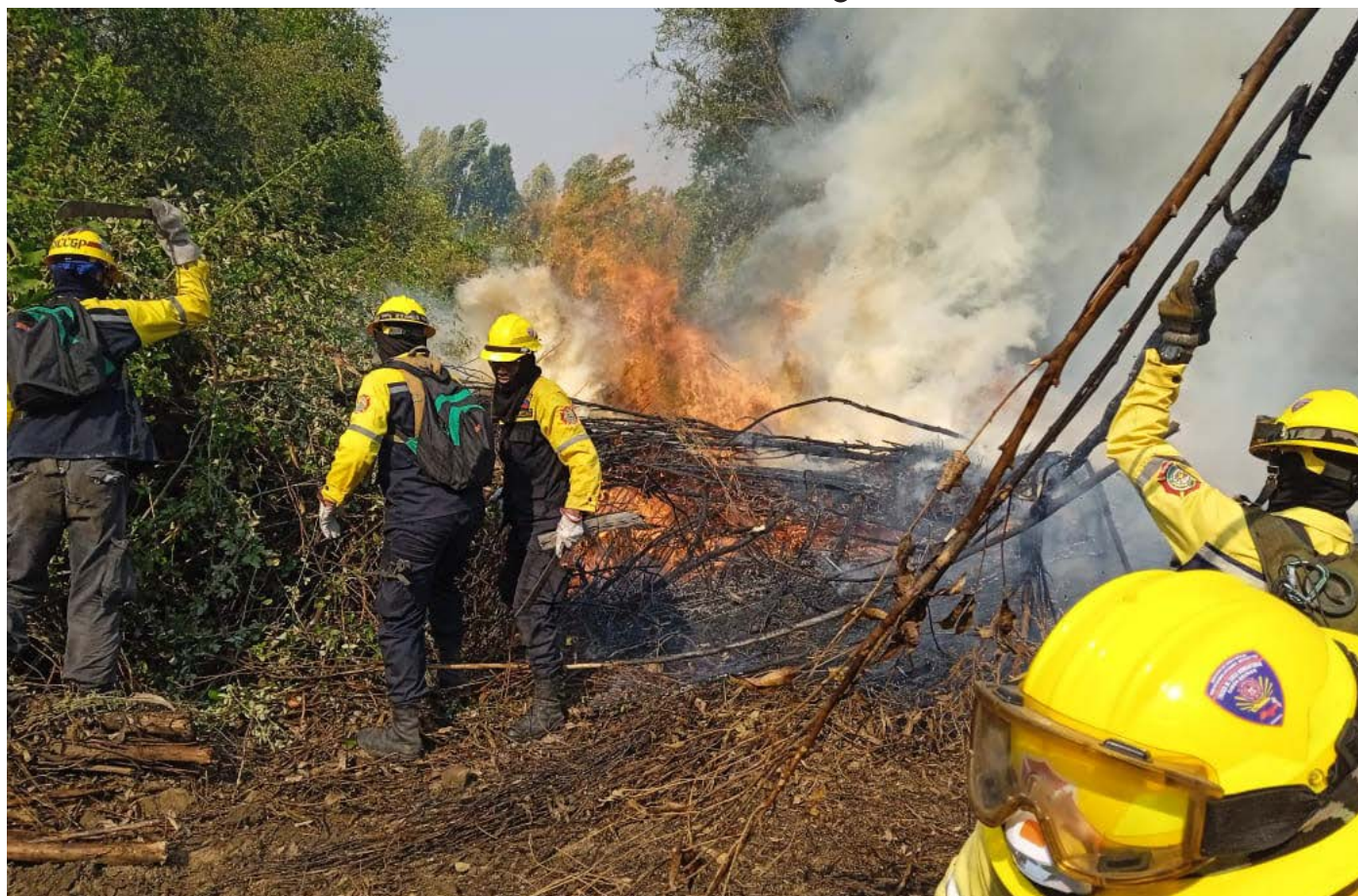
Forest fires in Chile are one week old and have claimed the lives of 24 people

A fter coordination with the National Forestry Corporation (Conaf) of the Chilean nation, the contingent of the Simón Bolívar Humanitarian Task Force, joined the extinction work in the town of Huacalemu, where there were several sources of fires.