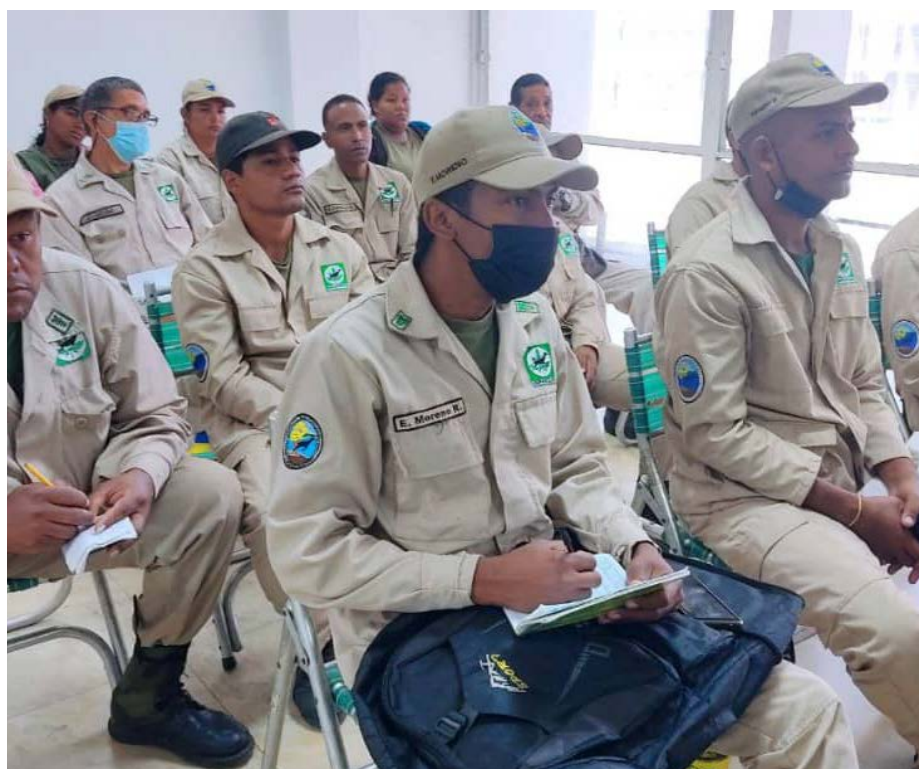
Constant training for the protection of green areas

The group of guardians of nature, received notions about the conformation of the police reports of environmental crimes, which contemplate the laws on the subject, the infractions, the articles of the