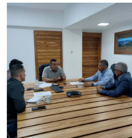
They are looking for a signal to be used by visitors, park rangers and forest firefighters

Telmaca is an organization based in the Maracaibo municipality of Zulia state, which provides residential and business high-speed internet service in the Zulian state and in Falcón state.