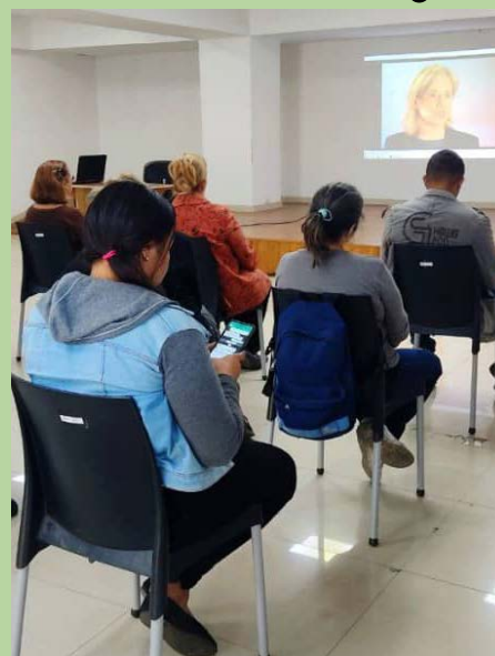
Venezuela promotes information regarding the climate crisis