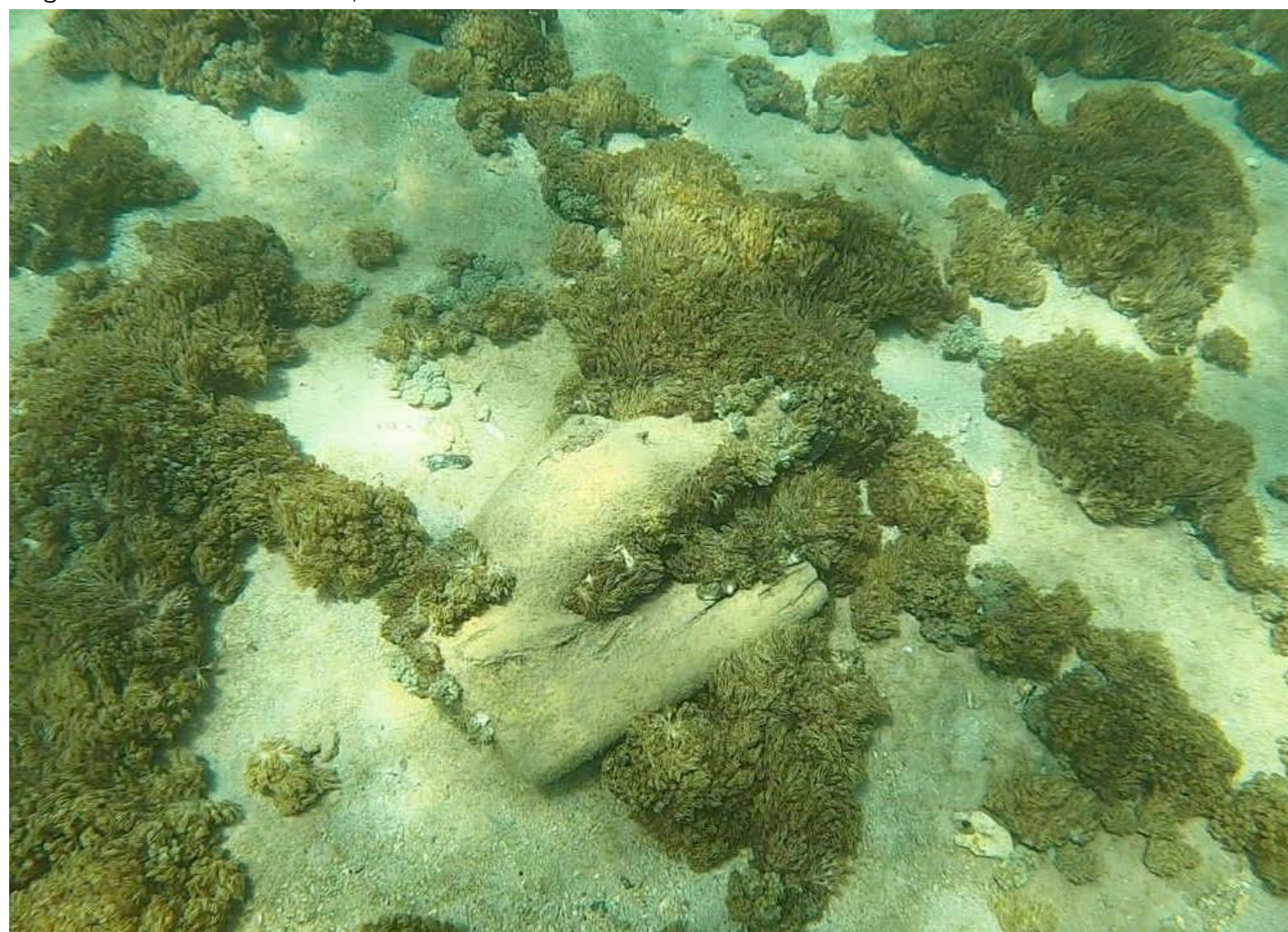
Concluded monitoring and inspection on the perimeter of 15 selected islands

The death and weakness suffered by corals in the last decade, as a result of climate change, puts the high coverage percentages of Unomia Stolonifera at an advantage over native corals of scleractinian origin, which form reefs in the region.