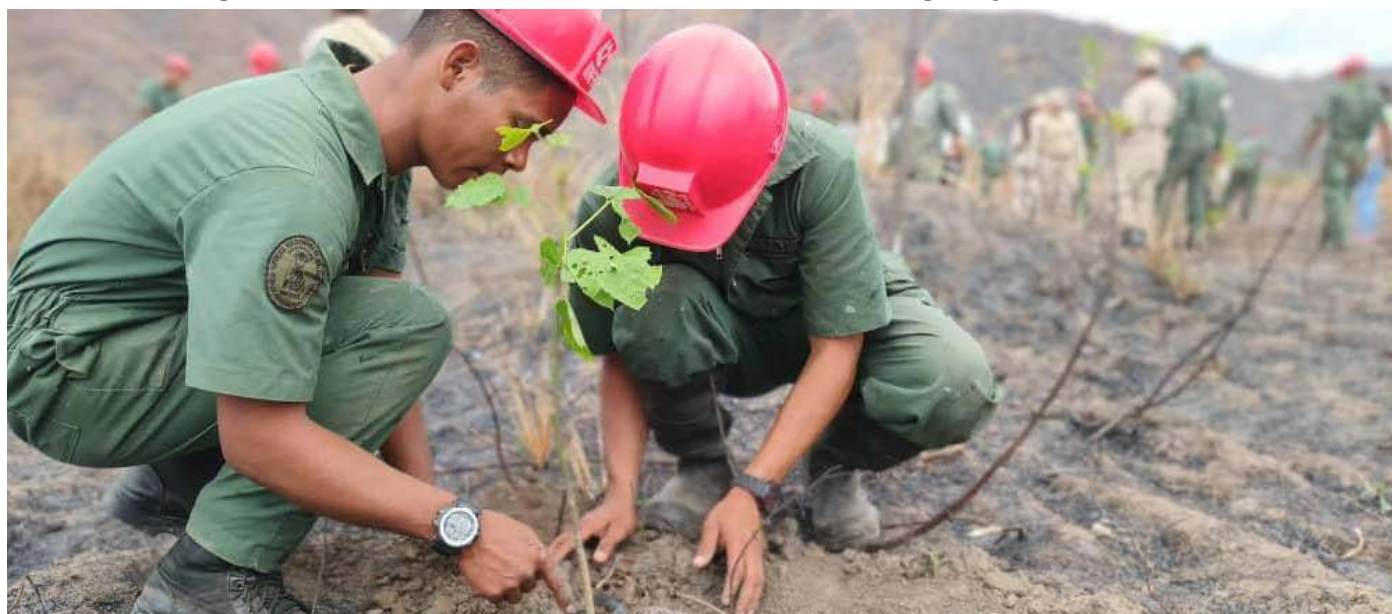
Rubber and cashew plants were planted, as well as ceje and manaca supplies were launched

T he Bolivarian National Armed Forces (FANB) has joined, since February, the reforestation campaign of the Canaima, Yapacana and Caura national parks, located in the Bolívar and Amazonas states, which have been affected by illegal mining, according to It was reported by the head of the FANB Strategic Operational Command (Ceofanb), Domingo Hernández Lárez, through his account on the social network Twitter.