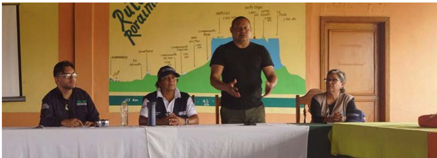
Work groups were formed by community

The Ministry of Popular Power for Ecosocialism (Minec) and representatives of the Food and Agriculture Organization of the United Nations (FAO) in Venezuela, made a series of visits to the communities of the Caroní river basin in the Bolívar state, in order to develop knowledge exchange workshops.