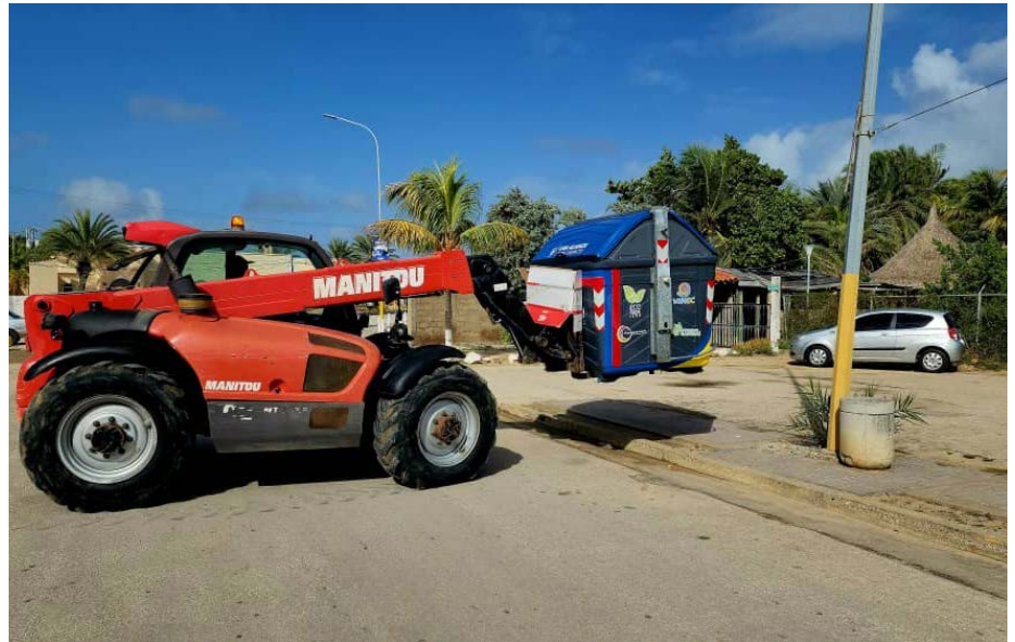
Solid Waste and Integral Management System

He commented that at the end of December the company began with the "containerization" of tourist and commercial areas, consisting of placing containers for waste collection.