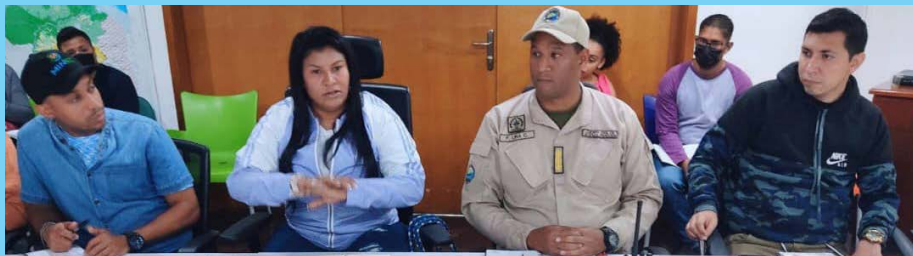
They will strengthen forest control

Likewise, the directive of 0800-AMBIENT (0800-2624368), Monitoring Room of the National Reforestation and