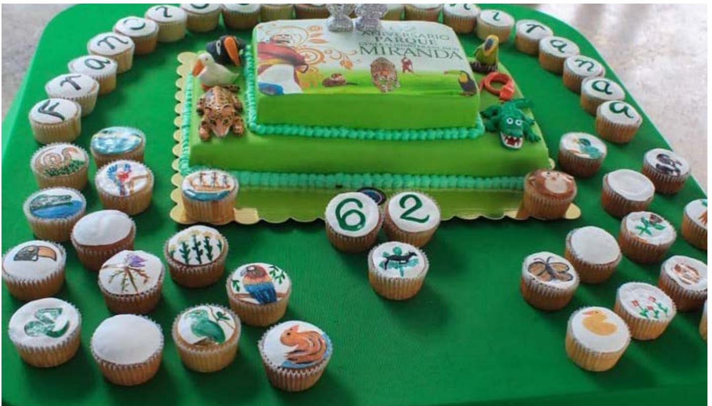
The Generalísimo Francisco de Miranda Park receives more than 150,000 people every weekend