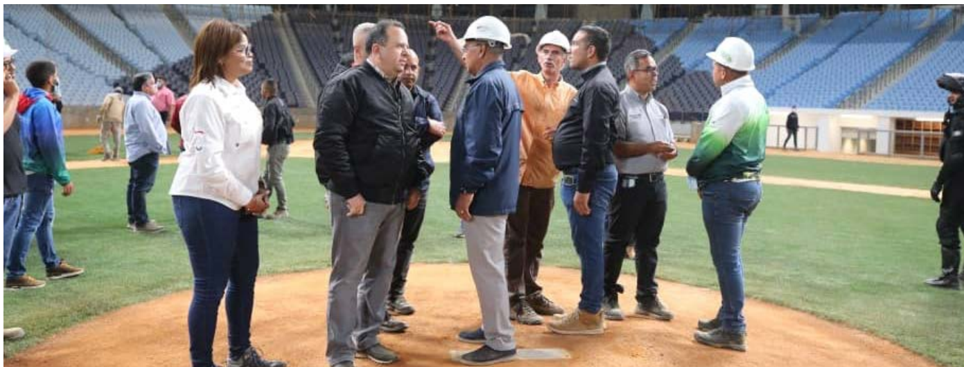
For a high-altitude Caribbean Series with a commitment to the environment

Likewise, the ecosocialist entity will be in charge of the landscaping and decoration of the exterior and interior areas of the modern baseball field, with the purpose that visiting athletes and the Venezuelan population enjoy a space of healthy recreation and pleasant stay.