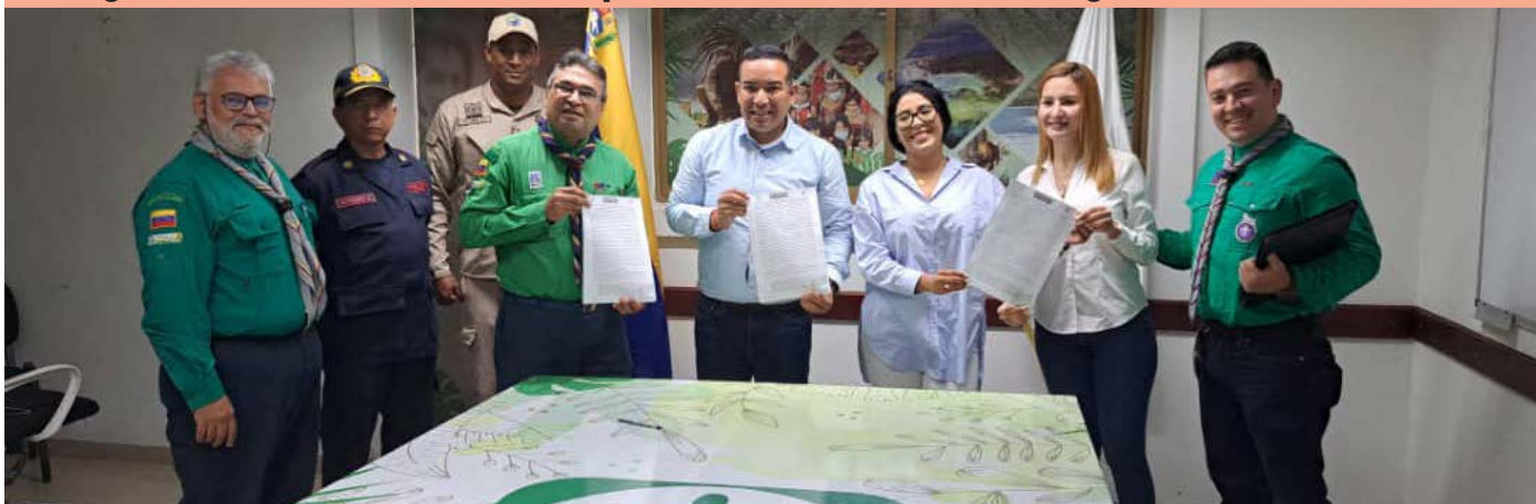
Agreement was signed at the Inparques headquarters

The Ministry of Popular Power for Ecosocialism (Minec), the Miranda State Tourism Corporation and the Association of Scouts of Venezuela, signed an agreement with the purpose of starting the recovery and improvements of Campo Escuela Paramacay, located in the Municipality Reedbed of the Mirandina entity.