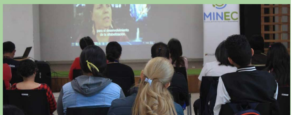
Training is a fundamental element for the life of the planet

He pointed out that Freire's proposal is "an education that sees the needs and adapts to the realities of the students and makes them participate in their training".