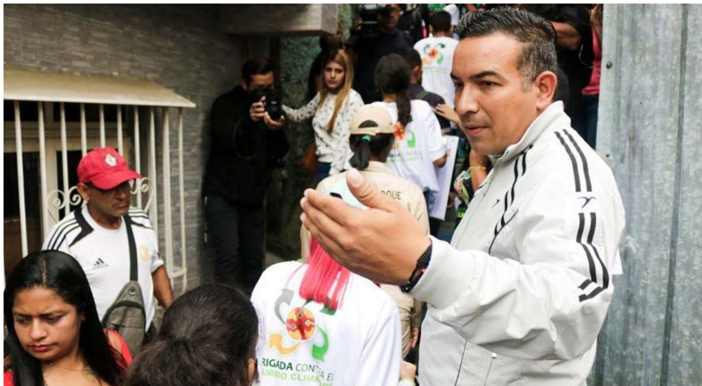
Deployment promotes environmental awareness

D uring this weekend, multidisciplinary teams were deployed in eight entities of the country, to carry a message of environmental awareness, in what constituted the campaign for each house called "The Climate Crisis affects us all."