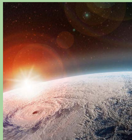
It will recover the levels it had in 1980

In the Arctic, recovery will occur faster in 2045, while in the rest of the world it will be in 2040.