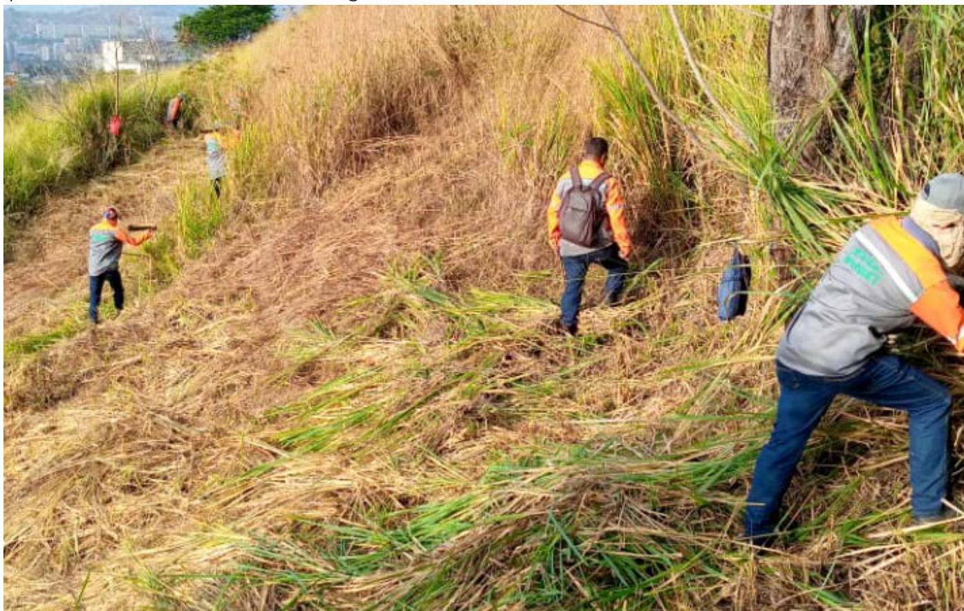
Waraira Repano National Park has a main firebreak with a length of 23 kilometers

Likewise, work is being done on the firewall of the San Esteban National Park in Carabobo and in the Henri Pittier National Park.