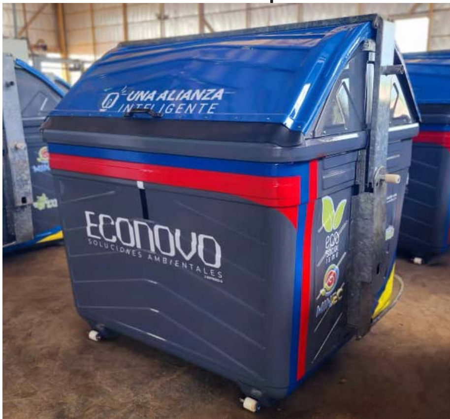
An adequate solid waste collection policy

Compacting vehicles with special mechanisms for lifting lateral loads will empty the containers, which were designed to resist exposure to sunlight, water, and leached liquids caused by the