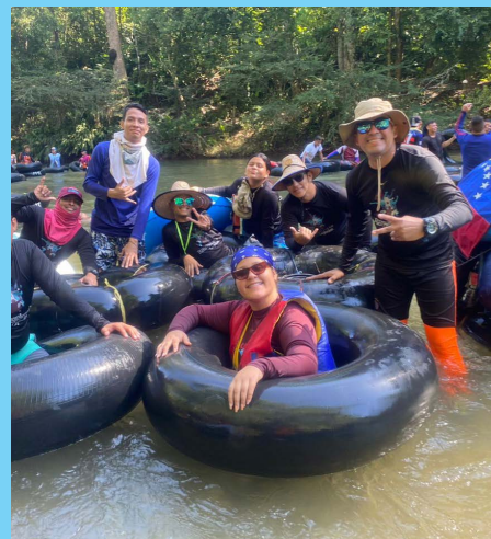
Learning and approach to nature

In the mobilization, which took place during three days of travel, 100 people were in compliance with an activity that has become a tradition in the area, with which you can enjoy the river and the natural beauties that can be appreciated during the journey.