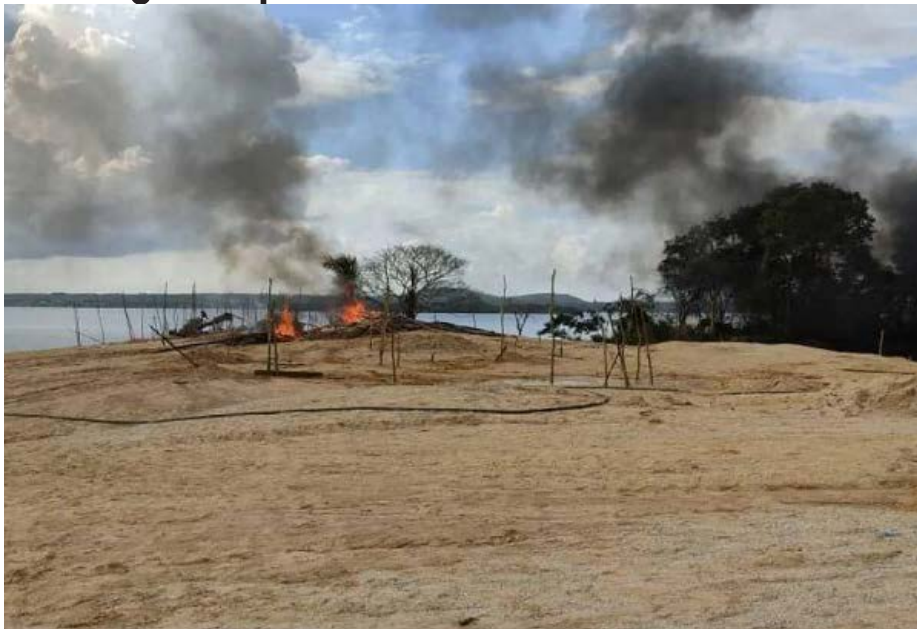
Venezuela maintains a fierce fight against illegal mining

In the procedure, the FANB arrested three citizens who