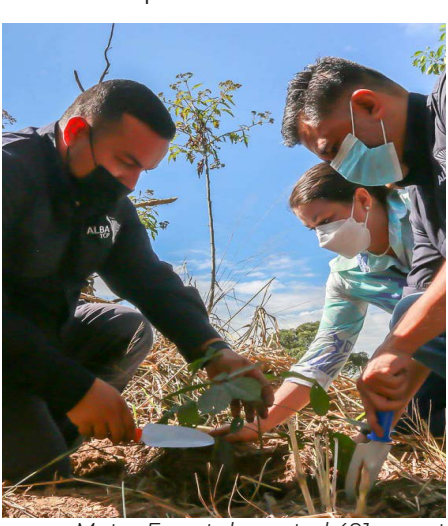
Motor Forestal granted 491 export permits for wood products

Among the agreements that were reached is the one agreed with the Venezuelan Corporation of Guayana (CVG), through the company Maderas del Orinoco for the production of various species of forest plants.