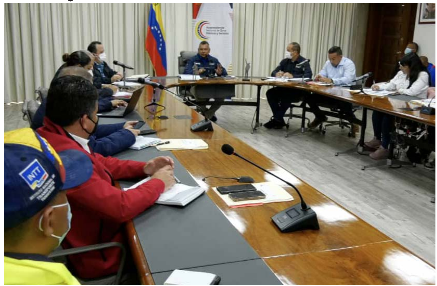
Consolidating public services is essential.

he authorities of entities that make up the Sectoral Vice Presidency of Public Works and Services (Vsops) held a meeting to evaluate the Strategic Plan of the body for 2023, from the main headquarters of the Ministry of Popular Power for Electric Energy in Caracas.