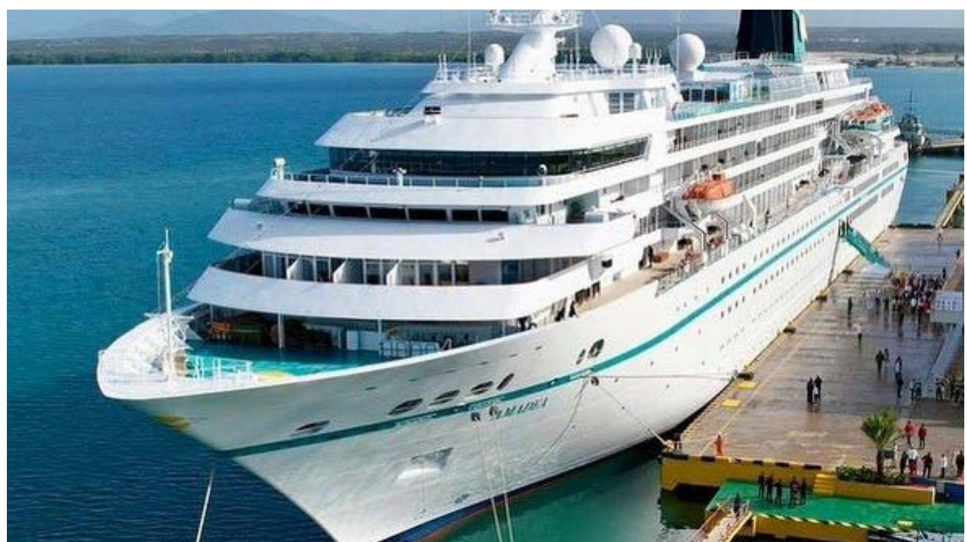
Minister Lorca highlights the importance of preserving natural spaces.

The cruise ship is owned by the Amadea Shipping Company, operated in the Phoenix Reisen fleet, and has eight passenger decks, seven bars, two restaurants, a library, cinema, hospital, stage, beauty salon, gym, and mini golf, among other services.