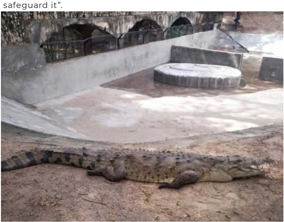
Specimen was transferred to Las Delicias Zoo

According to specialists, this species is in danger of extinction, so it is expected that, soon, it will be assigned a pair for its reproduction and its reintroduction to nature as a conservation strategy.