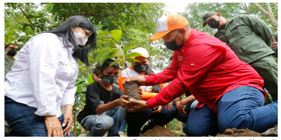
Forest Motor advances by leaps and bounds

out actions that lead to the preservation of forested areas and endangered species.