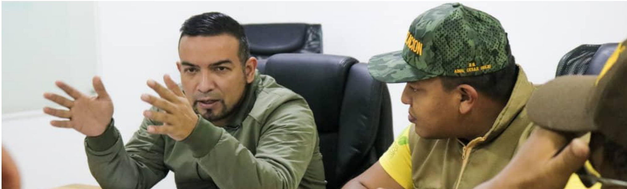
Prepare for dry season