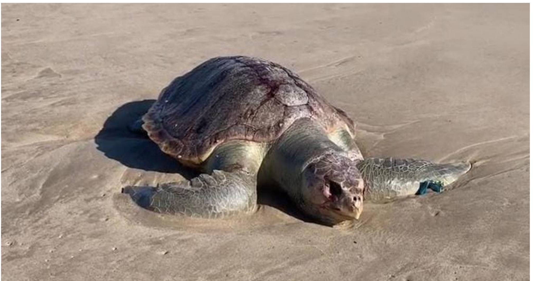
The turtle died decompensated due to an injury to the left flipper

Sea turtles are of great importance for marine-coastal ecosystems, since they are at the top of food webs (they control the growth of sponges and algae in coral reefs, as well as that of small crustaceans and even jellyfish). Likewise, they promote the flow of energy between the sea and the land because they make long migrations and occupy a variety of habitats.