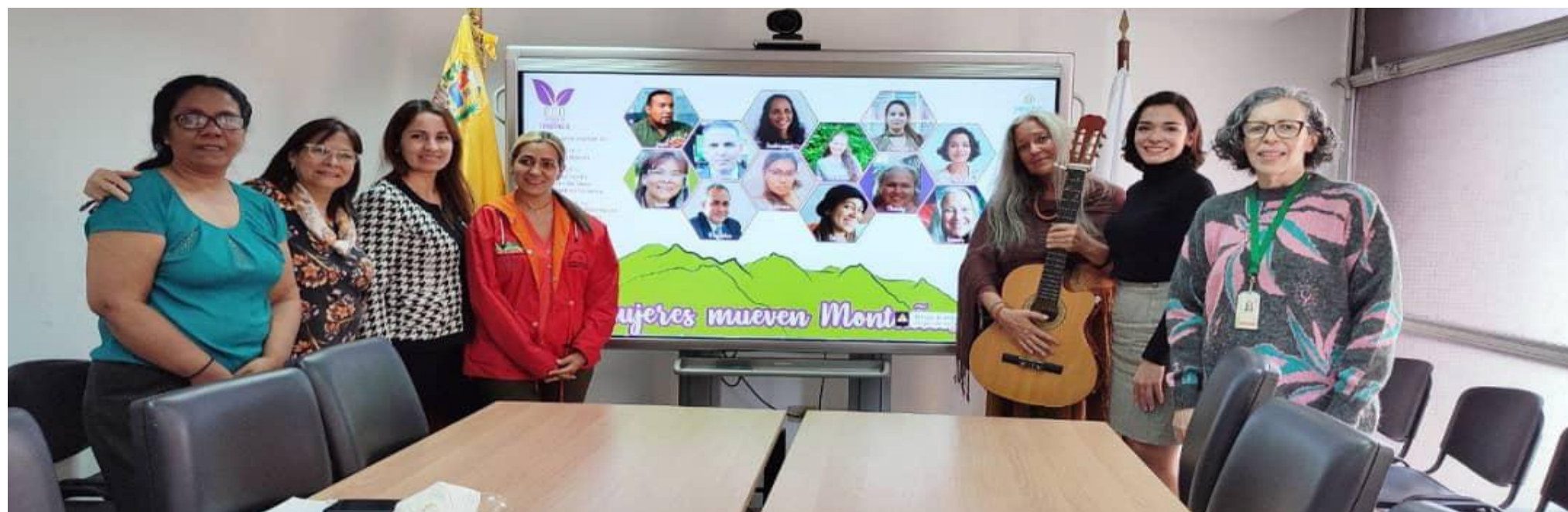
Women move mountains

To commemorate International Mountain Day, the Ministry of Popular Power for Ecosocialism (Minec) offered a series of videoconferences on the theme called "Mountains matter: for people and the planet."