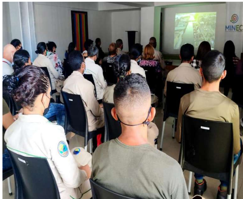
They invite every Tuesday at the Minec headquarters

place regularly on Tuesdays at 10 in the morning, on the sixth floor of the Minec headquarters, located in the South Tower of El Silencio in the center of the Venezuelan capital.