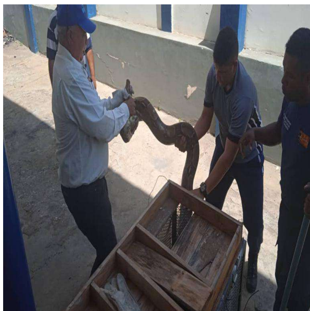
Reptiles are large

The boas are kept under permanent observation and evaluation by a veterinarian, pending authorization for their release or another destination determined by the General Directorate of Biodiversity.