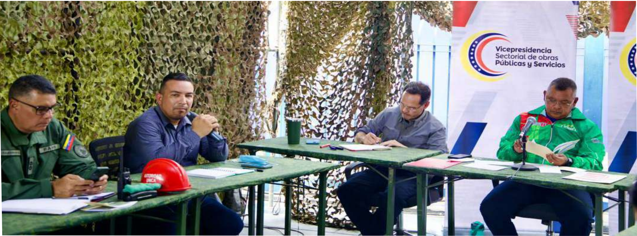
Electricity service was fully restored

In 18 days of intervention in the Las Tejerías sector, located in the Santos Michelena municipality, in the state of Aragua, the 11 work fronts of the Sectoral Vice Presidency of Public Works and Services, removed 255,514 cubic meters of debris and sediment, with 118 machinery and specialized equipment and 5,071 dump truck trips. This was announced by the sectoral vice president of the area and also Minister of People's Power