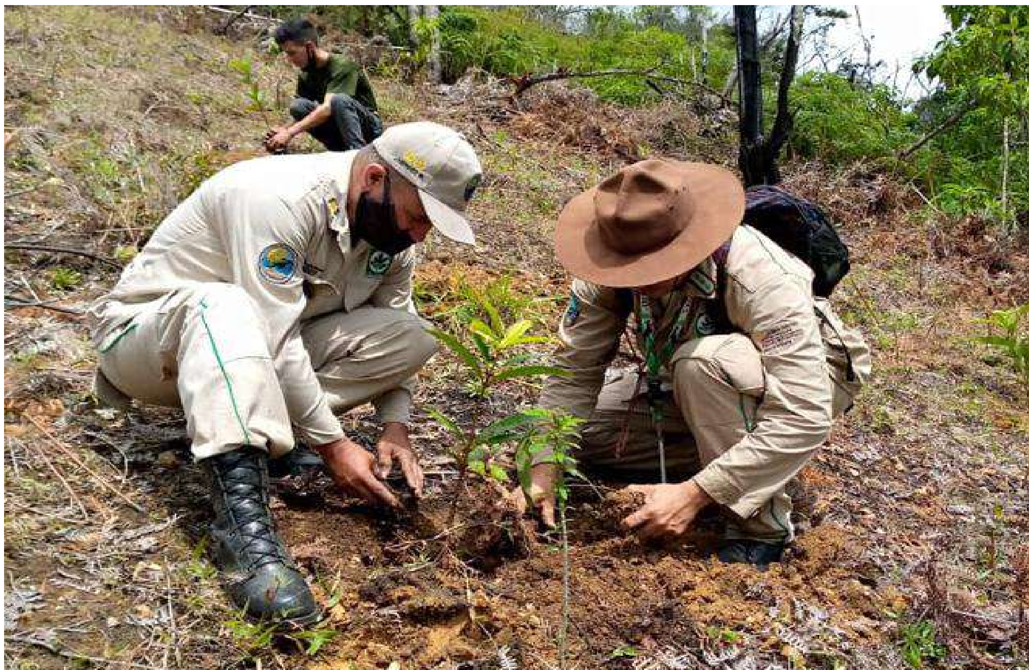
National Reforestation Plan 2022-2023 seeks to restore plant cover in hydrographic basins

W ith a plantation that was carried out on the right slope of the Agua Fría reservoir, in the Guaicaipuro municipality of Miranda state, the Ministry of People's Power for Ecosocialism (Minec), began the "Sembrando Vida" program.