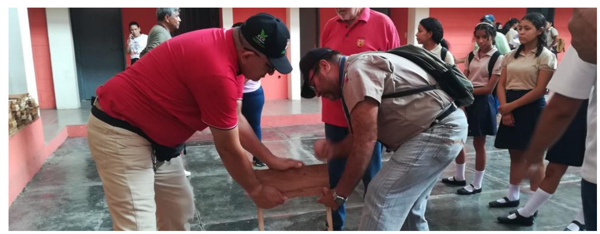
They plan to deliver 5 thousand kits

The Ecosocialist Territorial Unit (UTEC) Cojedes of the Ministry of People's Power for Ecosocialism (Minec), delivered 100 wooden kits to the Liceo Bolivariano San Carlos, as part of the Desk Recovery Plan, promoted by the Bolivarian Government led by President Nicolás Ripe.