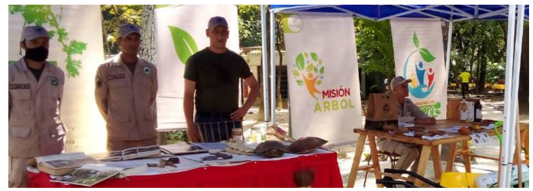
Minec featured two stand

ExpoAmazonas 2022 is an activity that takes place in the "Indigenous Resistance Month".