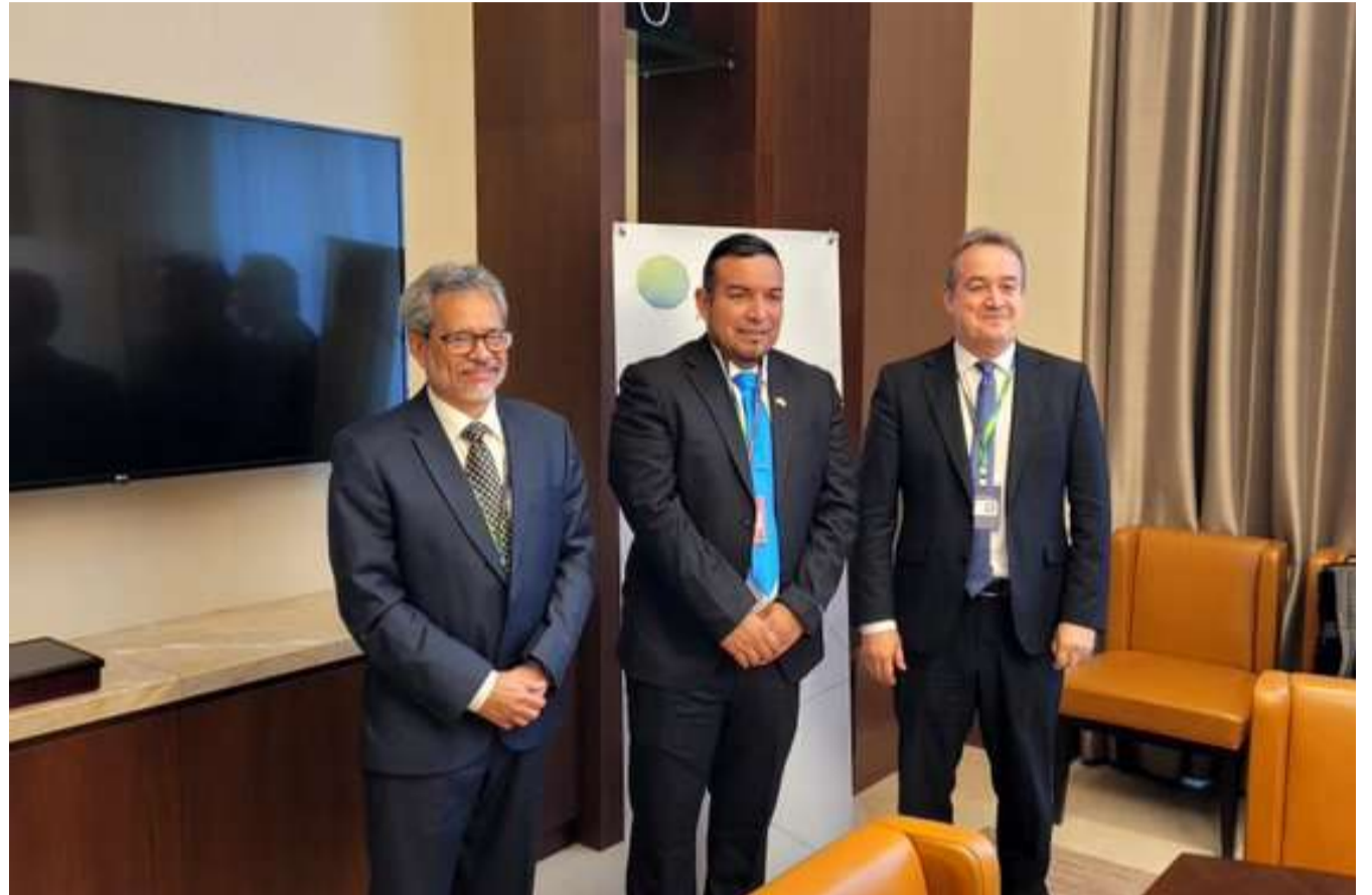
Venezuela is committed to the fight against the climate crisis

GCF was established by 194 governments to limit or reduce