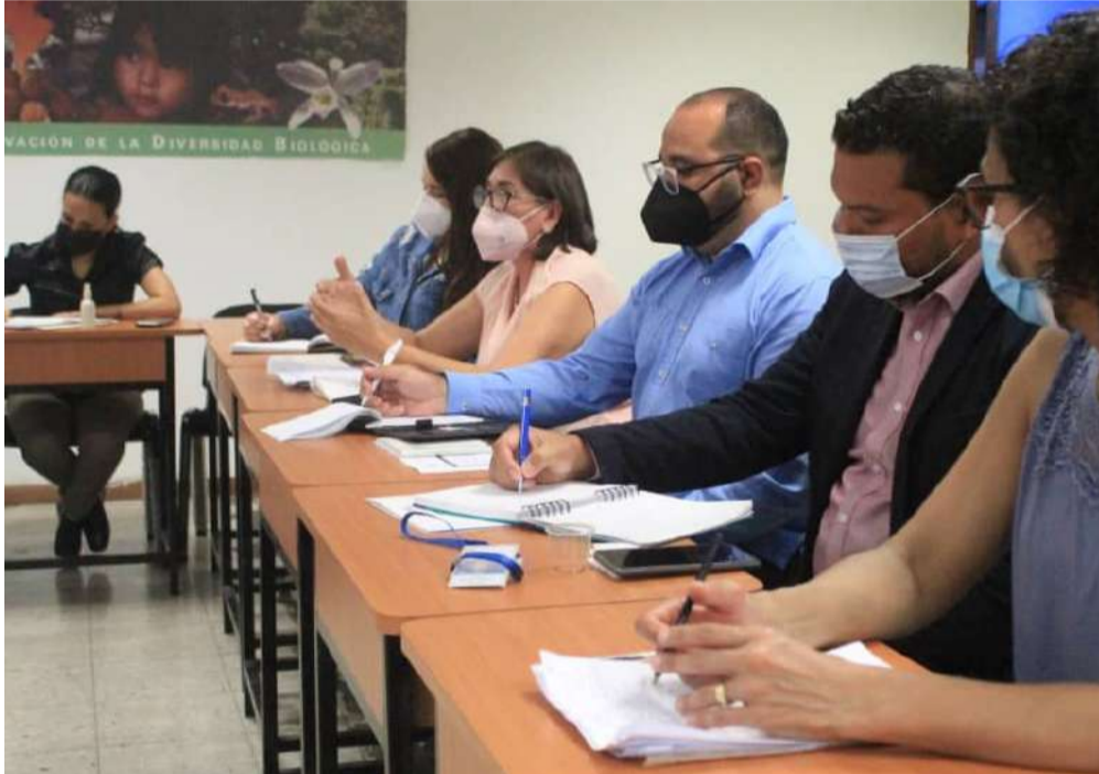
A route was established to increase the project

The Ministry of People's Power for Ecosocialism (Minec) and the Food and Agriculture Organization of the United Nations (FAO) in Venezuela participated in a meeting, with the purpose of defining the project entitled "Integrated Landscape Management in the Region Venezuelan Andean".