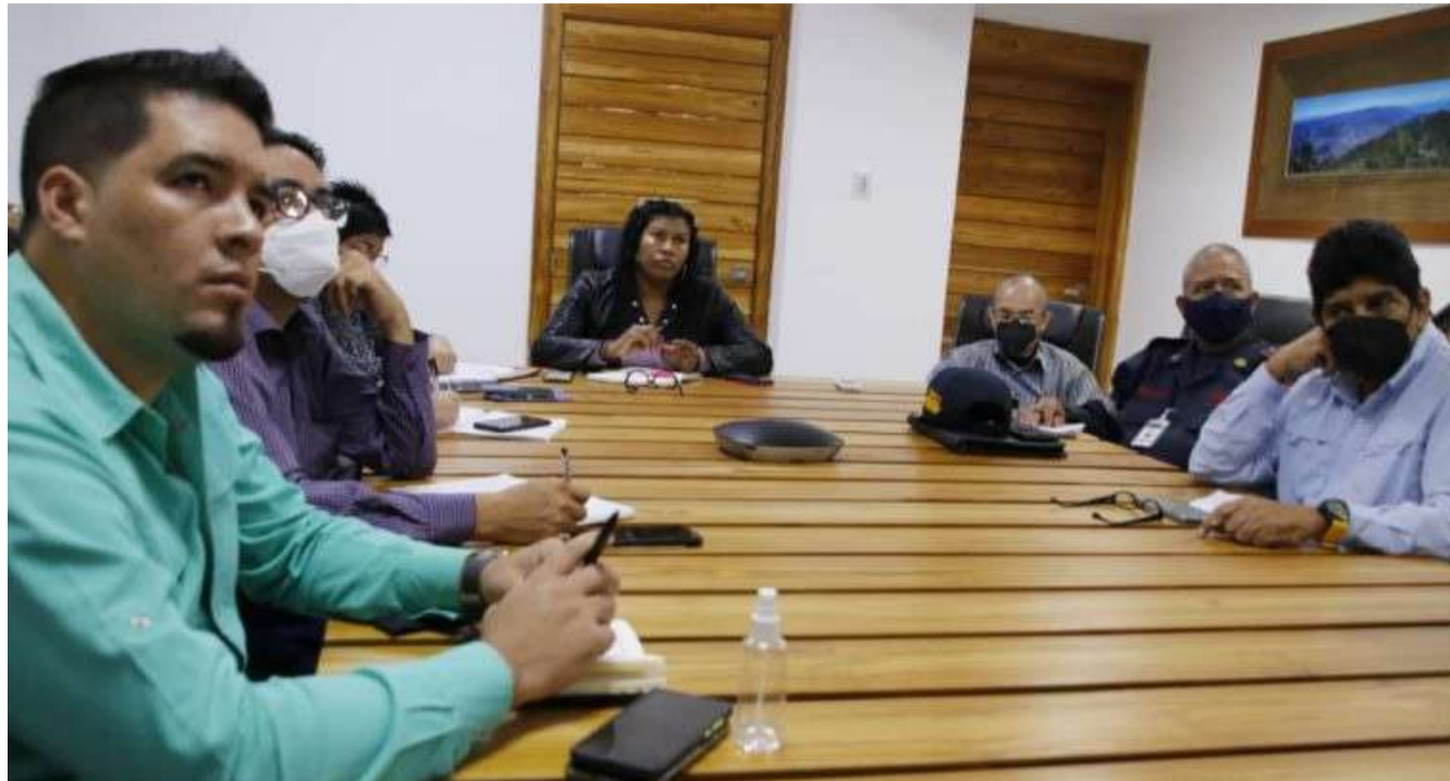
The objective is to consolidate the forestry economic zones

As part of the lines of work towards the consolidation of the Superior Body of the Forest Engine, the Ministry of People's Power for Ecosocialism (Minec), developed the II Forest Cabinet, from the office's videoconference room, in Plaza Caracas.