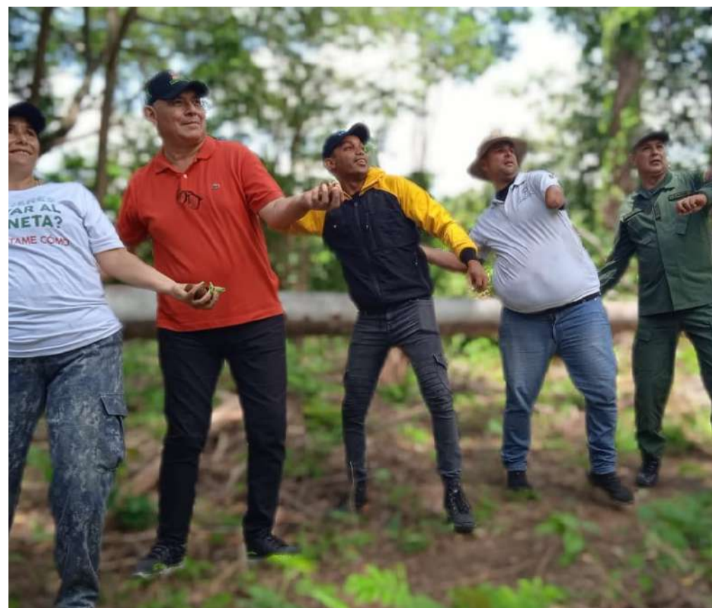
25 thousand aircraft were launched to regenerate degraded areas

With the action, Minec seeks to recover the degraded areas of the important tributary on the eastern coast of the lake, which supplies the Burro Negro reservoir, as part of the estimates of the National Reforestation Plan 2022-2023.