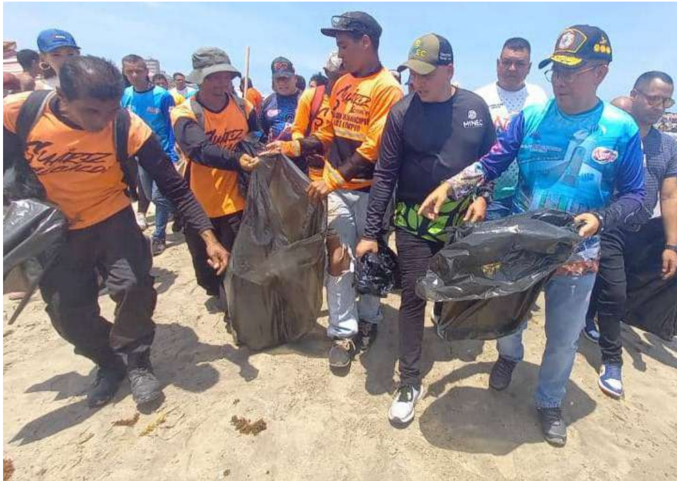
Different entities and institutions participated in the activity

On the occasion of World Beach Day, the Ministry of Popular Power for Ecosocialism (Minec) undertook a special sanitation day at Candilejas beach, located in the state of La Guaira, in which a total of 657.68 kilograms of solid waste.