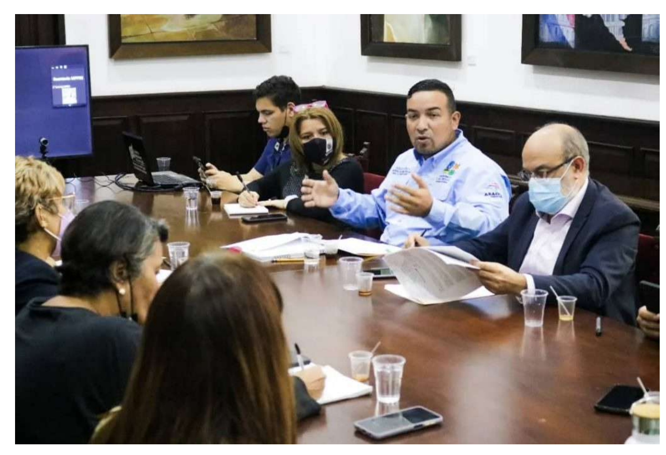
Different ministries participated in the activity

uthorities from the Ministry of People's Power for Ecosocialism (Minec), Culture (Mppc), Foreign Relations (Mppre) and the Institute of Cultural Heritage (IPC), analyzed the progress made in strengthening the Canaima National Park as a World Heritage Site.