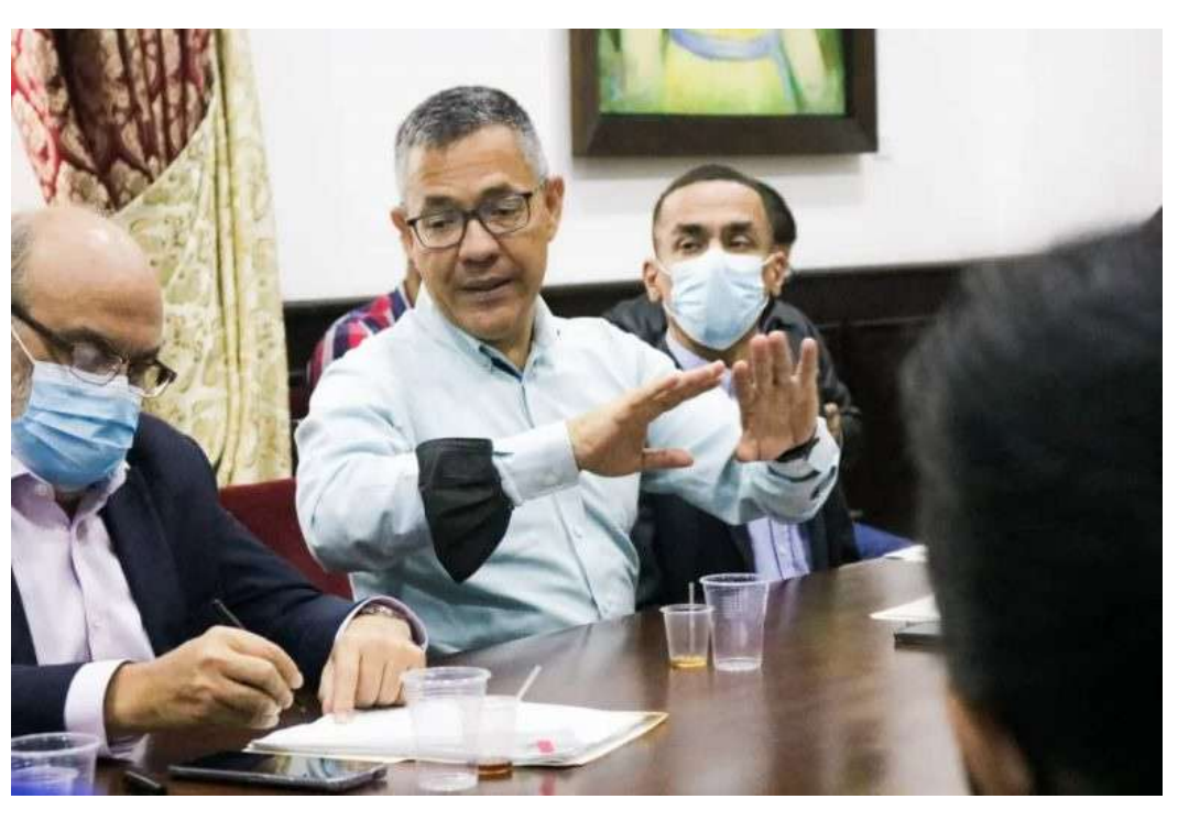
Minister Villegas was present

In addition, the responsible performance of the National Government recorded is preserve and protect the Canaima National Park as a World Heritage Site, and maintain the Outstanding Universal Value (VUE).