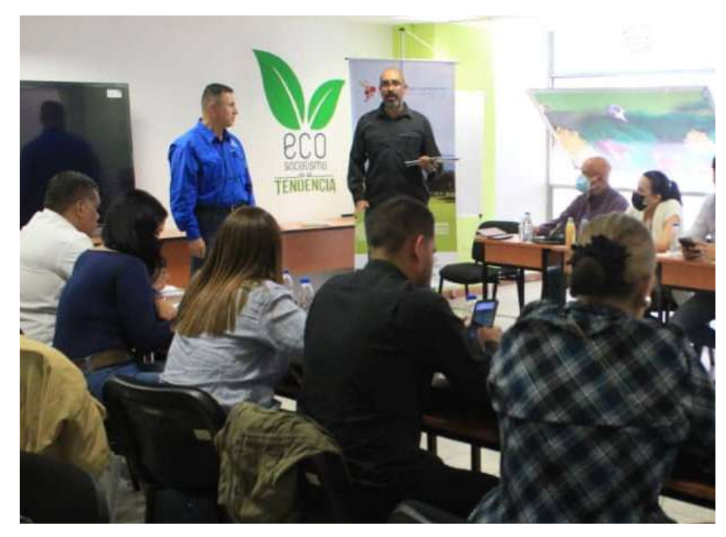
Manage e-waste efficiently

he headquarters of the Ministry of People's Power for Ecosocialism (Minec), served to hold the first meeting of the National Committee for Waste Electrical and Electronic Equipment (RAEE).