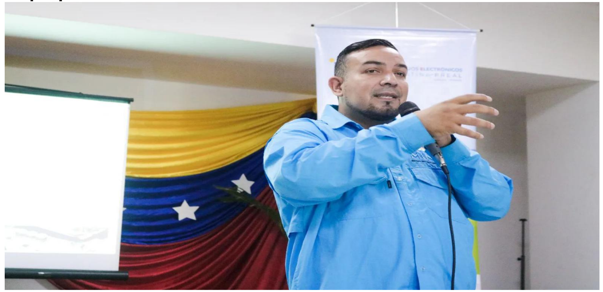
These actions will contribute to the economic development

he Ministry of People's Power for Ecosocialism (Minec), held a meeting with the actors involved in the management of Waste Electronic Electrical and Equipment (WEEE), with the aim of National establishing improve the Committee to management of said waste in Venezuela.