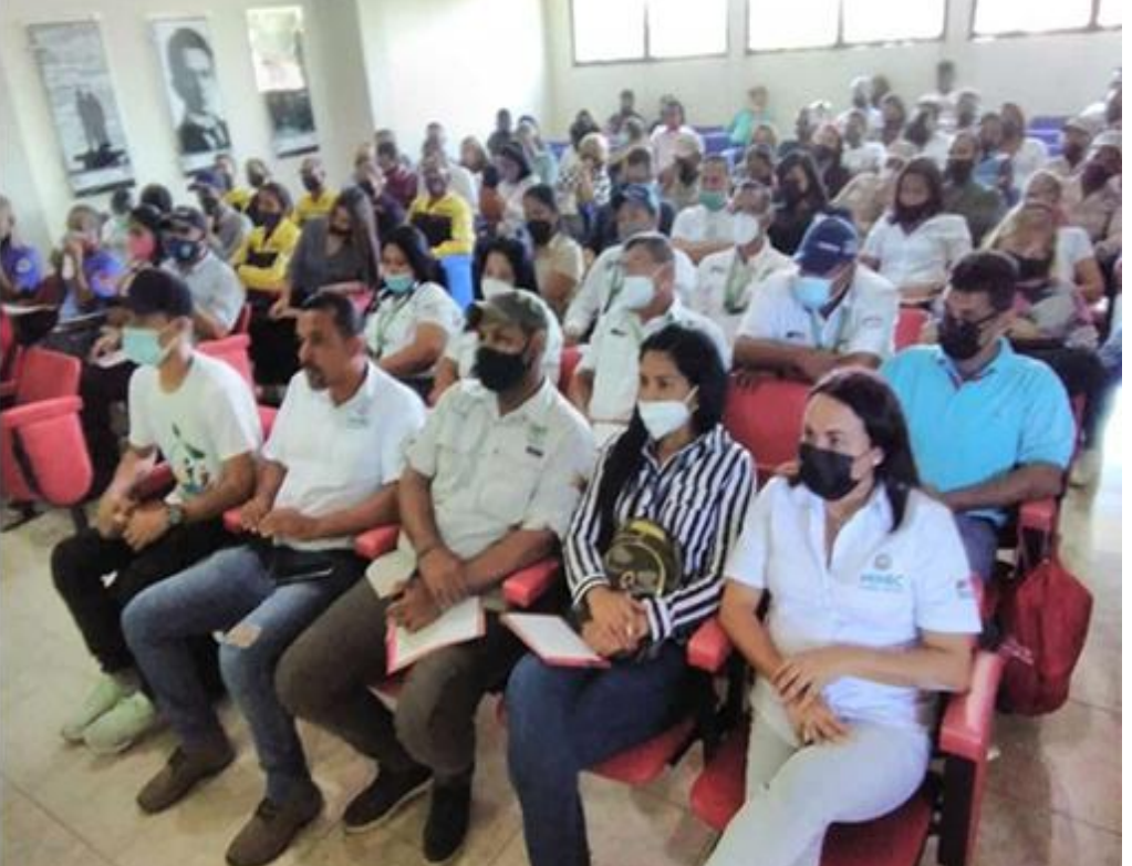
The Congress will tour the entire entity