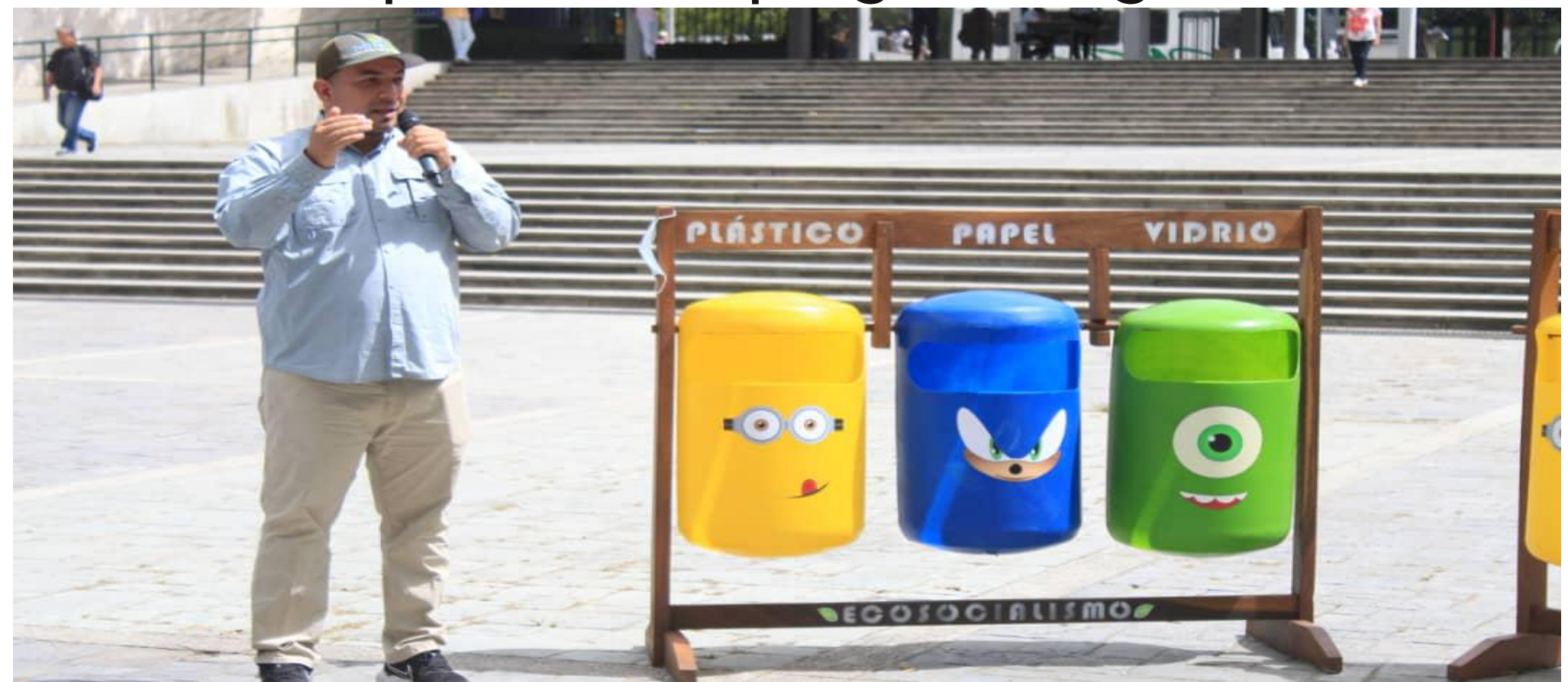
Each container represents a color for the waste

he Ministry for Ecosocialism (Minec) began the "My Park Recycles" program with the installation of 100 sorting containers for paper, glass, cardboard and plastic in the Generalissimo Francisco de Miranda Recreational Park, east of Greater Caracas.