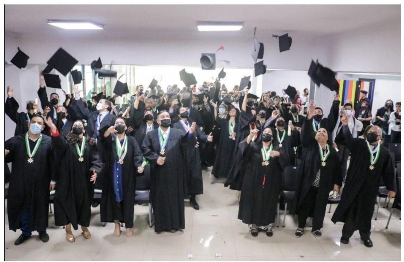
Exchange of environmental knowledge with more than 50 universities

he Popular University of the Fruto Vivas Environment (UPAFV), titles to 55 graduates, among Power for Ecosocialism stands out.