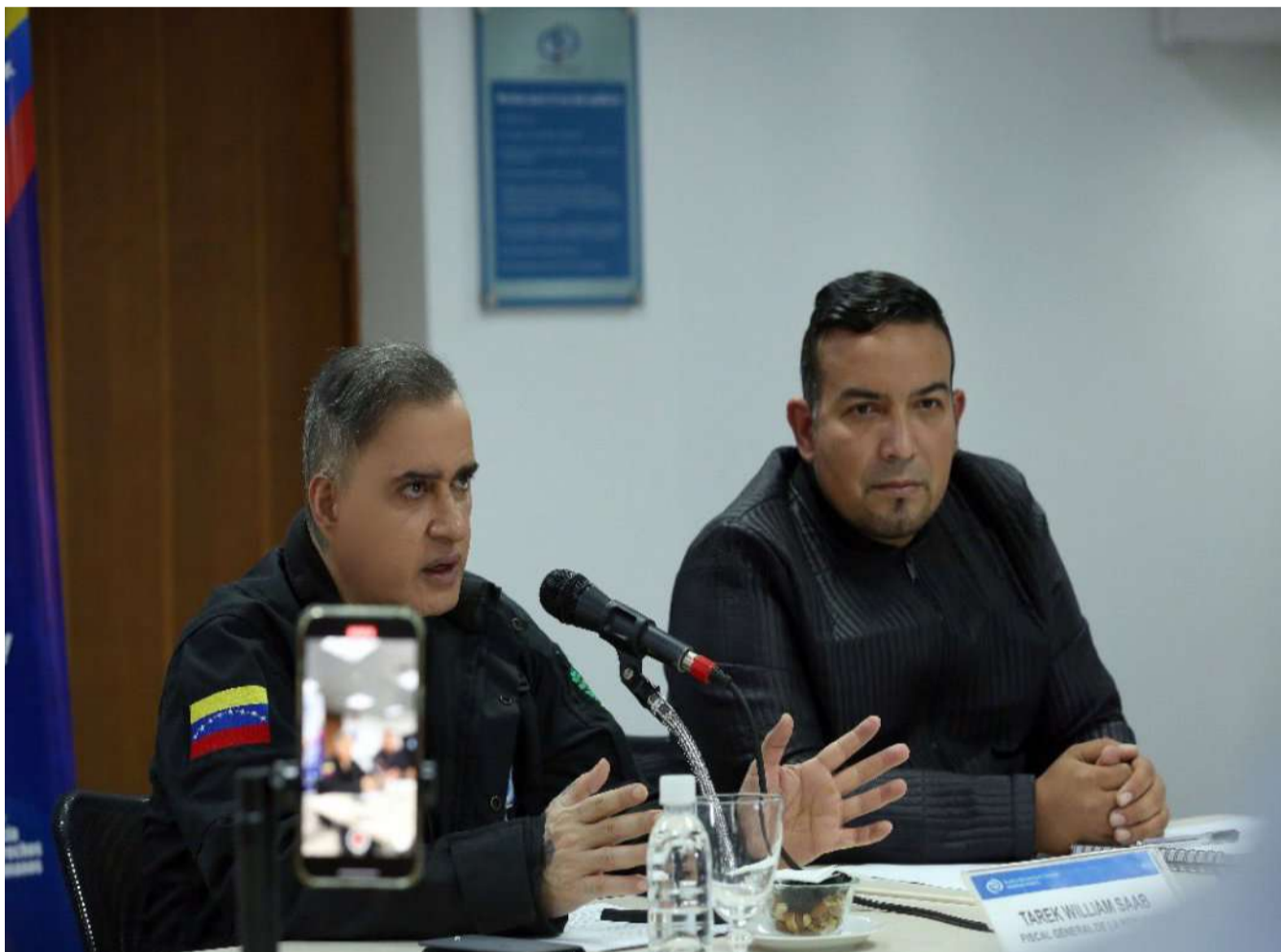
In a meeting held between the attorney general of the Republic, Tarek William Saab, and the People's Power Minister for Ecosocialism, Josué Lorca, they agreed to draw up a manual of procedures between both entities. (More info page 2).