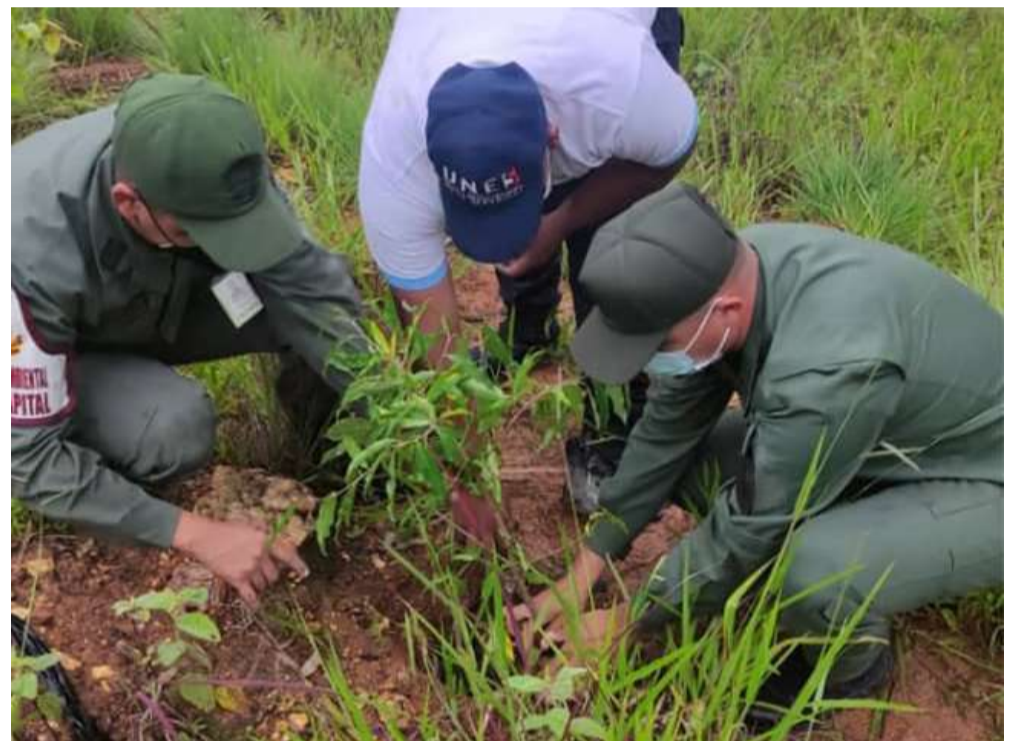
Strategy is part of the program "A student, a tree"

The event coincided with the closing of the 2021-2022 school year, and the conclusion of the first stage of the "One student, one tree" program.