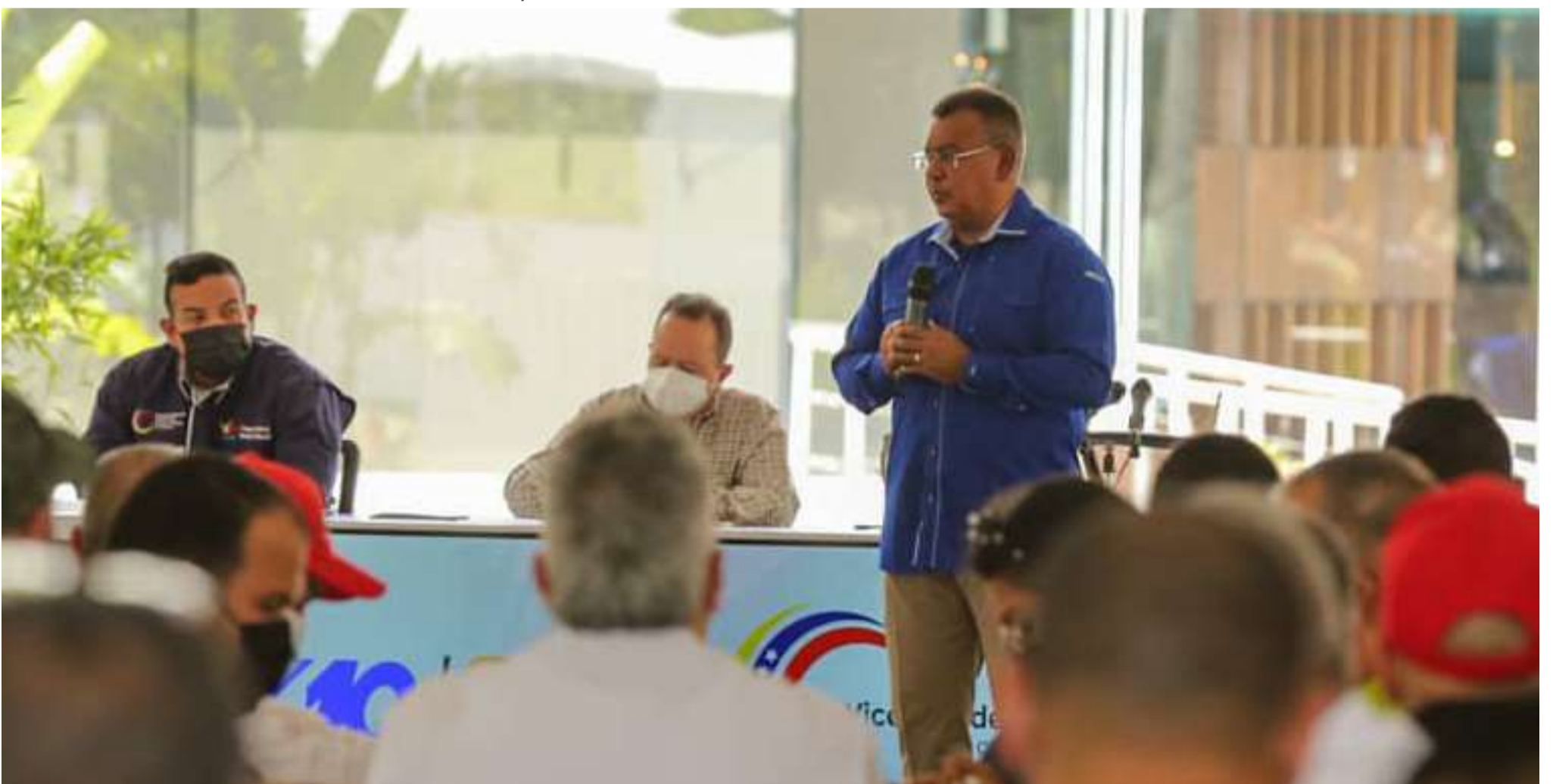
They reviewed concrete response actions for the people

Reverol indicated the importance of unification and cooperation between the members of the Vpsops and instructed that "a General Staff of Public Services must be formed in each entity, together with a 1 x 10 Situation Room to know in detail the situation of the communities and reach the most remote places of our country if there is a problem in the services".