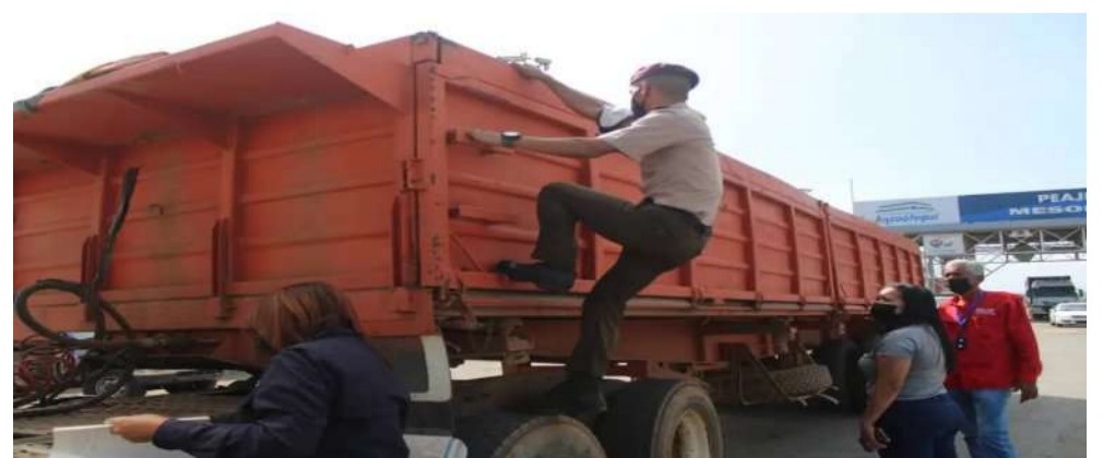
They did not have authorization to extract granzón

It is worth noting that this inspection day was carried out under the action of the 1 x 10 Good Government scheme, established by President Nicolás Maduro Moros.