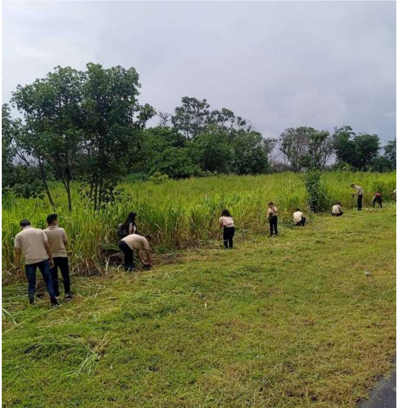
Action is part of the National Reforestation Plan

R obinsonian Technical School, the Manuel Palacio Fajardo Lyceum and the Assistive Robinsonian Technical School, and the accompaniment of the Ministry of People's Power for Ecosocialism (Minec), 150 trees were planted in the Park Bolivar Conservationist, located in the state of Barinas.