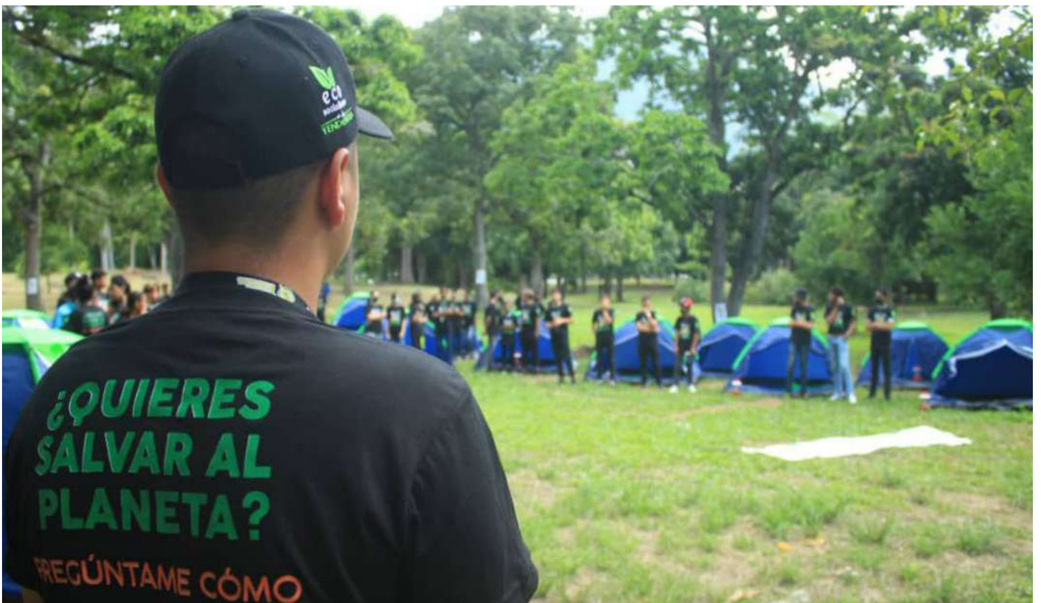
They will take the camp to the entire national territory

The constant training of the young Brigade Members against Climate Change is the key to building an eco-socialist conscience, because in the new generations the foundations are forged to achieve a new sustainable world.