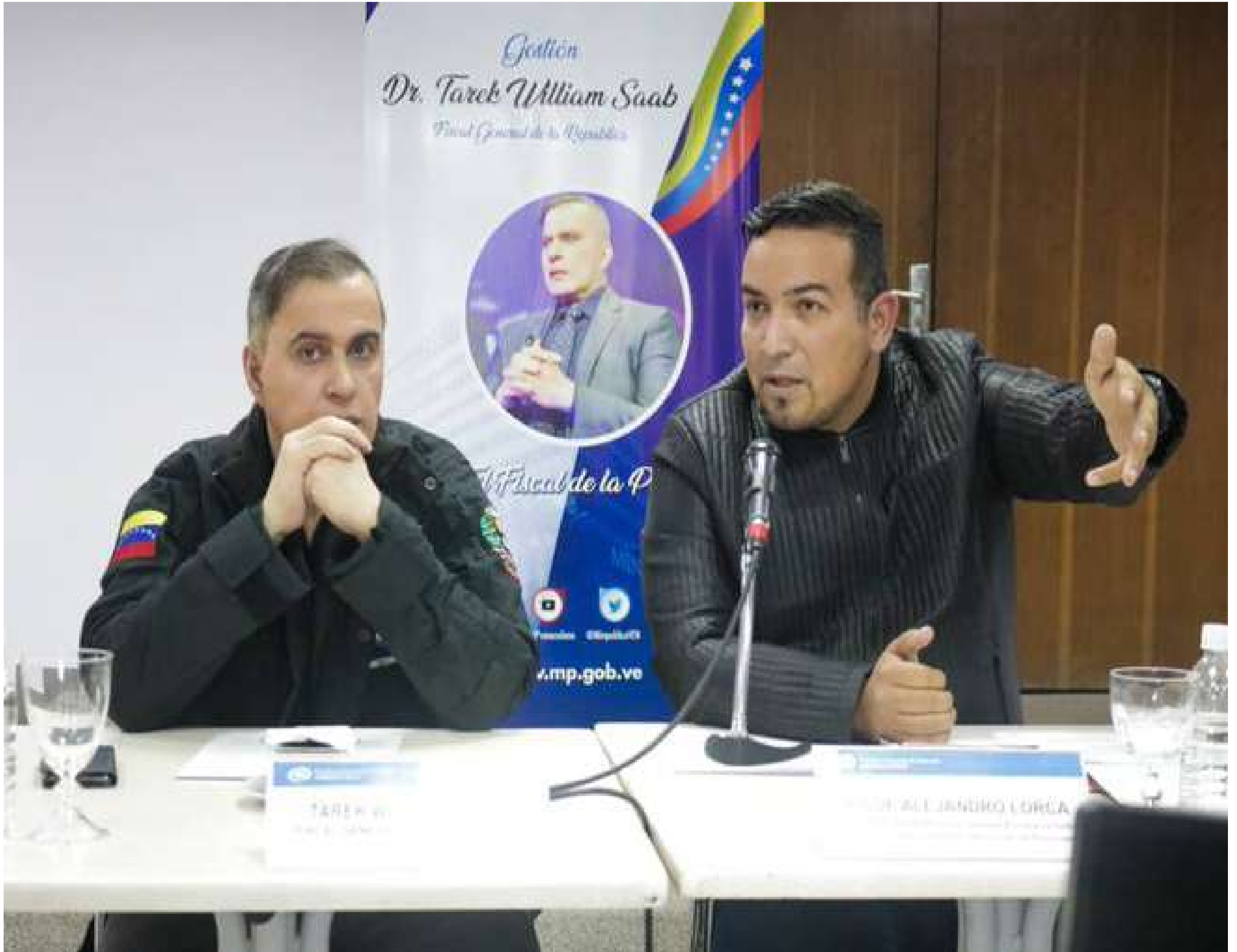
They will hold a national meeting of Environmental Prosecutors

I n a meeting held between the attorney general of the Republic, Tarek William Saab, and the People's Power Minister for Ecosocialism, Josué Lorca, they agreed to draw up a manual of procedures between both entities.