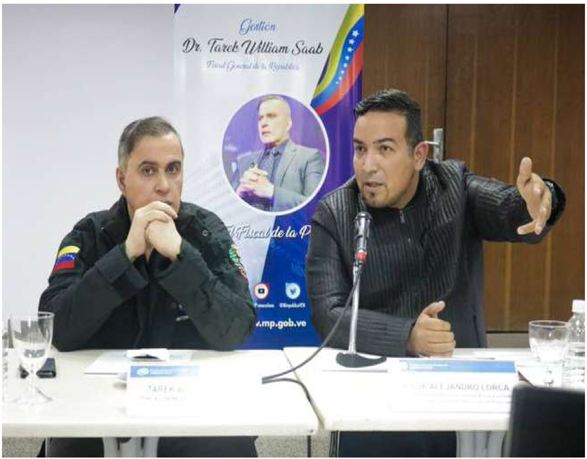
They will hold a national meeting of Environmental Prosecutors

n a meeting held between the attorney general of the Republic, Tarek William Saab , and the People's Power Minister for Ecosocialism, Josué Lorca, they agreed to draw up a manual of procedures between both entities.