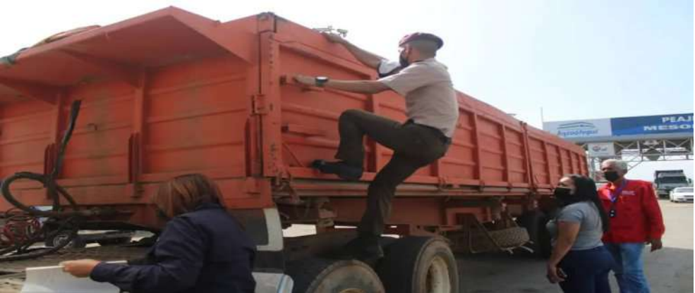
They did not have authorization to extract grazón

In the inspection procedure, it was verified that although the vehicles traveled with a traffic guide, it was found that the place of origin of did present the load not the proper authorization to carry out the activity of extraction and affectation of the natural resource.