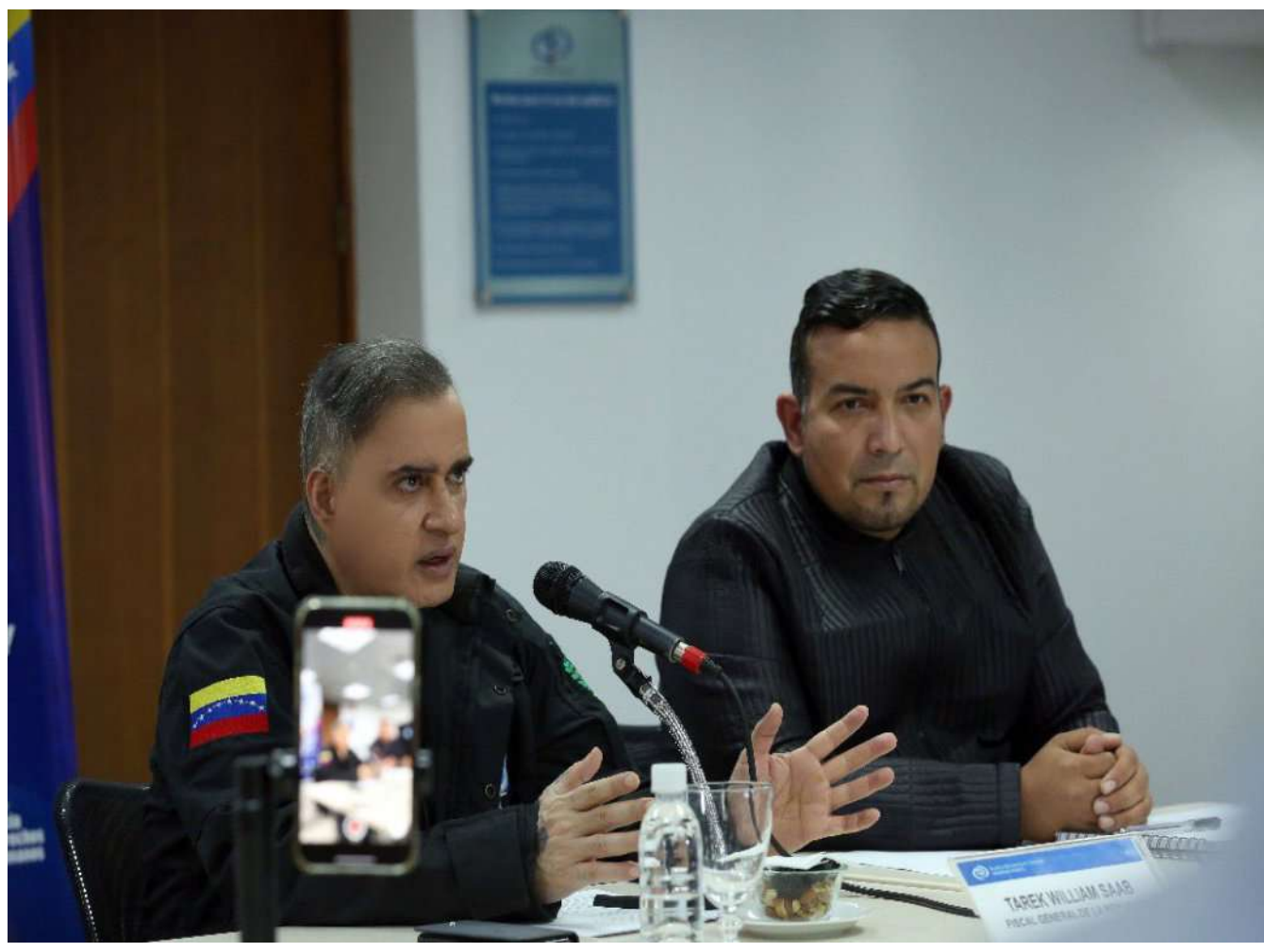
In a meeting held between the attorney general of the Republic, Tarek William Saab , and the People's Power Minister for Ecosocialism, Josué Lorca, they agreed to draw up a manual of procedures between both entities. (More info page 2).