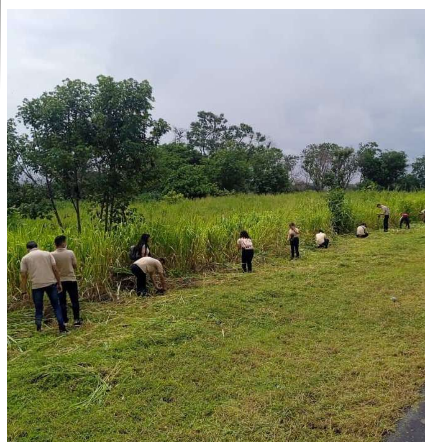
Action is part of the National Reforestation Plan