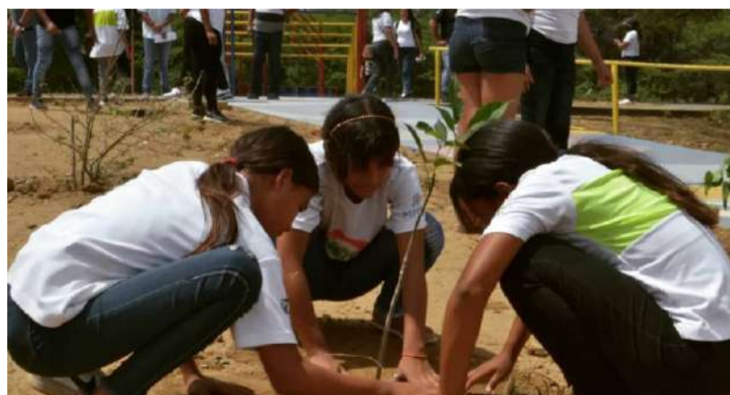
The ecobrigades constitute the new ecosocialist culture

The Ministry of Popular Power for Ecosocialism (Minec), with the support of the recently sworn-in Brigades Against Climate Change in the state of Falcón, planted more than two hundred trees in the Bicenten-