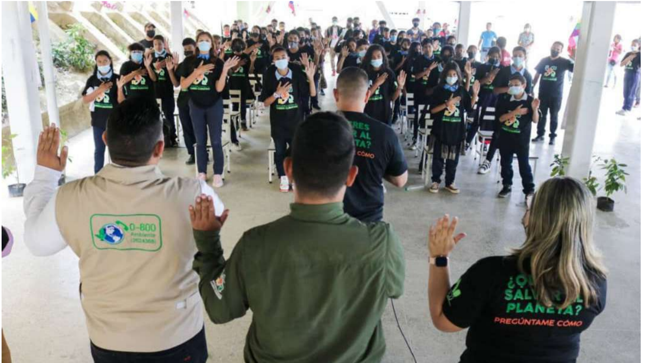
Students of the Gran Cacique Guaicaipuro National Lyceum of Ciudad Caribia were sworn in

The Minister of People's Power for Ecosocialism, Josué Lorca, swore in 65 young people who will become part of the Brigades against Climate Change.