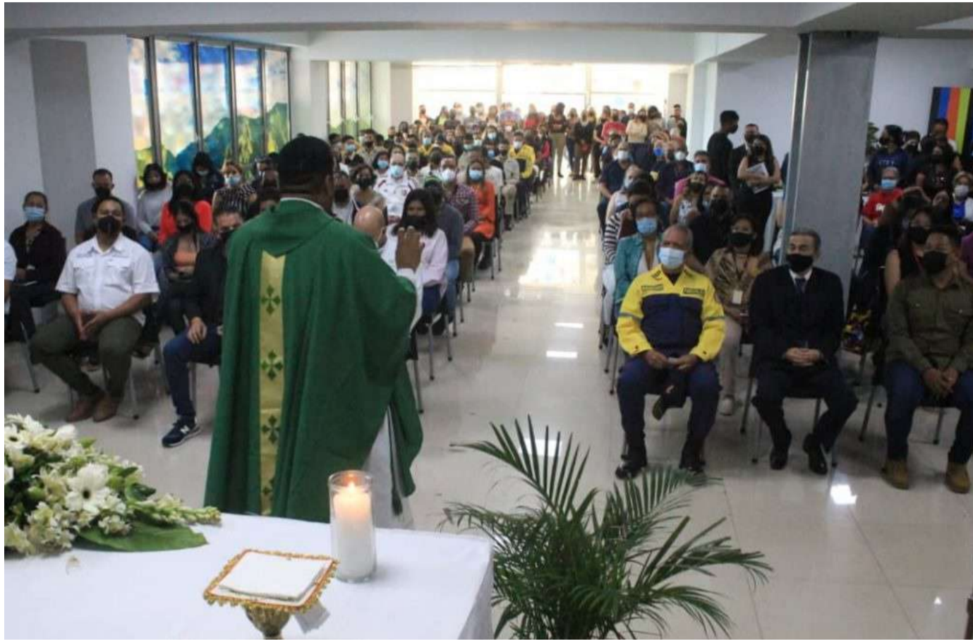
The parish priest extended blessings to the workers

As part of the commemorative acts for the four years of the Ministry of People's Power for Ecosocialism (Minec), a mass was celebrated in the Waraira Hall Repano, located on the 6th floor of the institution, in the South Tower of El Silencio, in the center of the capital.