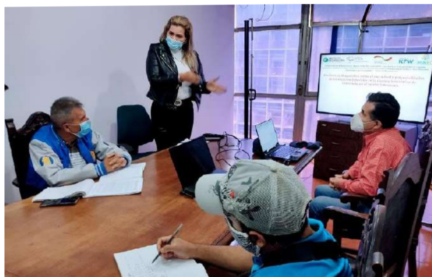
Evaluate and analyze the traceability proposal

In this line, the Minec, Topam CA and the Amazon Cooperation Treaty Organization (OTCA), evaluate and analyze the proposal of the company Topam CA to strengthen the System of Electronic Guides of Forest Goods (Sigefor).