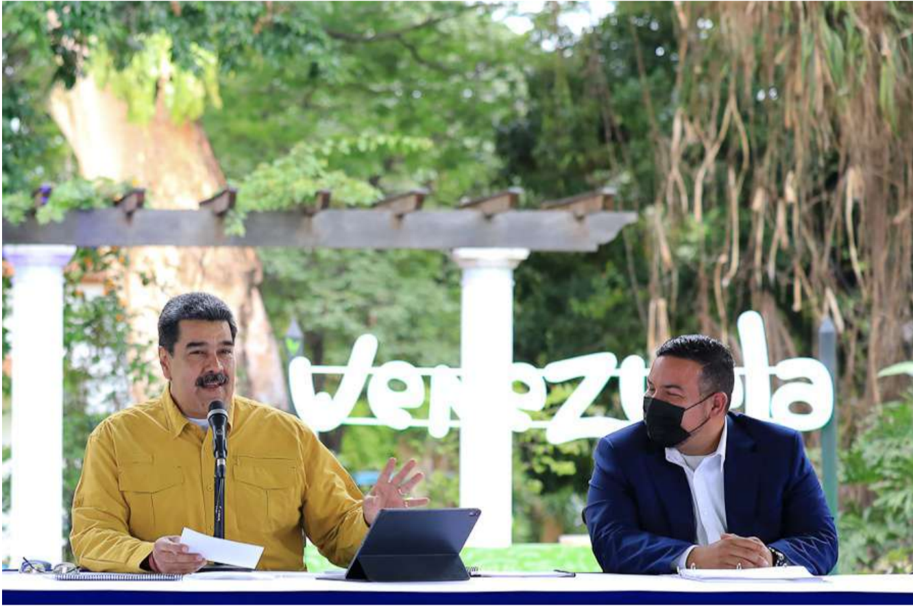
10 concrete actions against climate change were approved

Expressing his concern about the effects and consequences of climate change in the world, the President of the Republic, Nicolás Maduro Moros, approved a plan that will allow the application of measures to face the crisis generated by the atmospheric phenomenon.