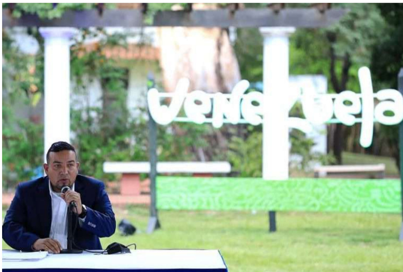
Lorca described as successful the balance of the activity

During the closing ceremony of the First National Congress of Researchers on Climate Change, which was attended by the President of the Bolivarian Republic of