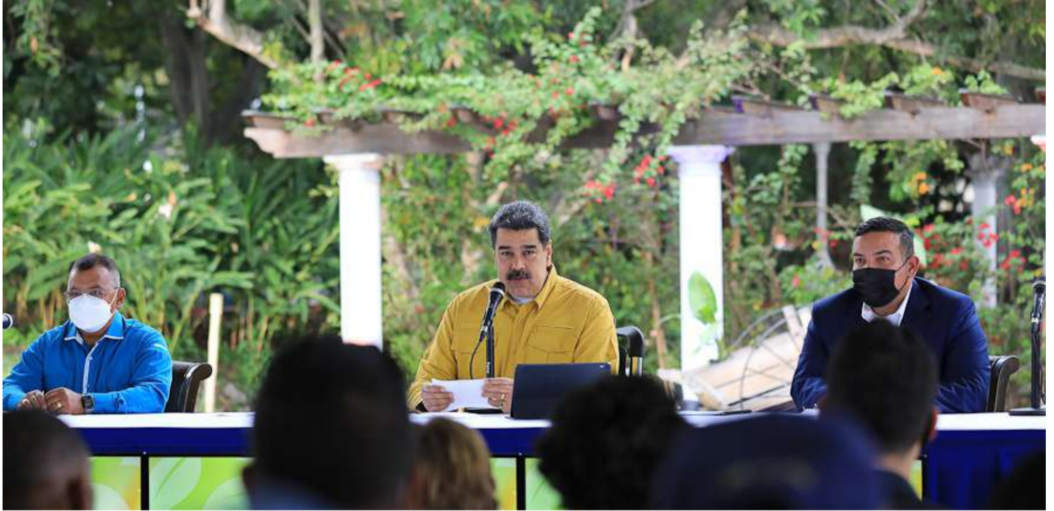
The activity took place in the Casona Cultural Aquiles Nazoa

From the spaces of La Casona Cultural Aquiles Nazoa, located in the state of Miranda, the President of the Republic, Nicolás Maduro Moros, closed the First National Congress of Researchers on Climate Change, which promoted joint actions to reduce the effects of the atmospheric phenomenon by convene the participation of specialists, students and researchers linked to the area.