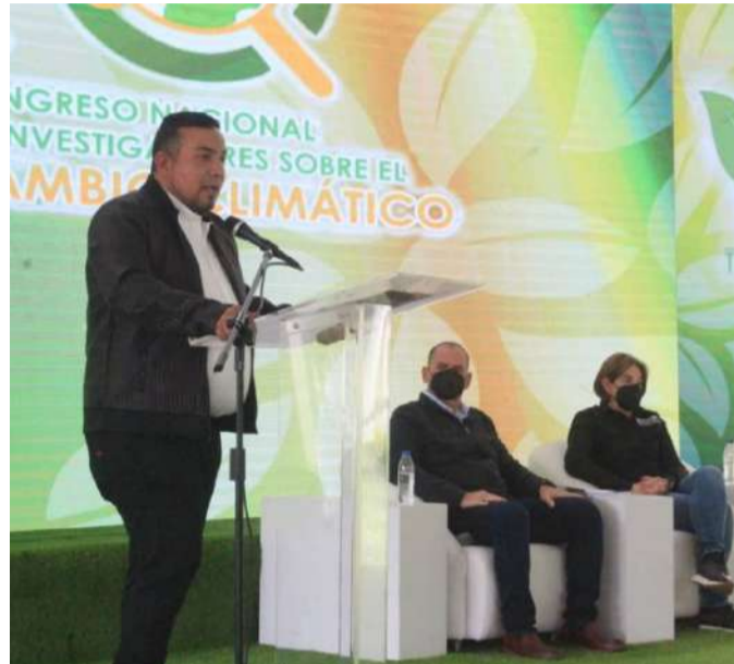
The activity dealt with comprehensive risk management

After the deliberations and presentations at the First National Congress of Researchers on Climate Change, this Thursday, with the presence of authorities from the Executive Power, a central presentation of the papers was made.