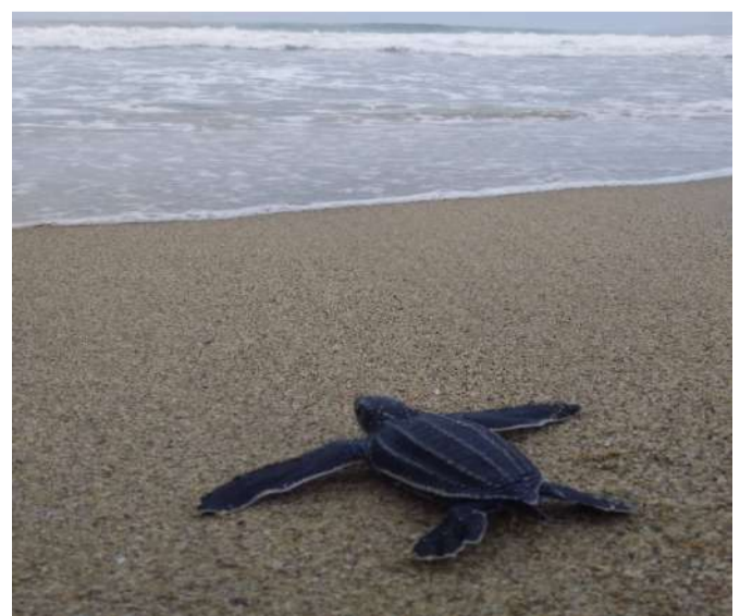
30 baby turtle hatchlings were released

The activity was accompanied by the staff of the General Di-