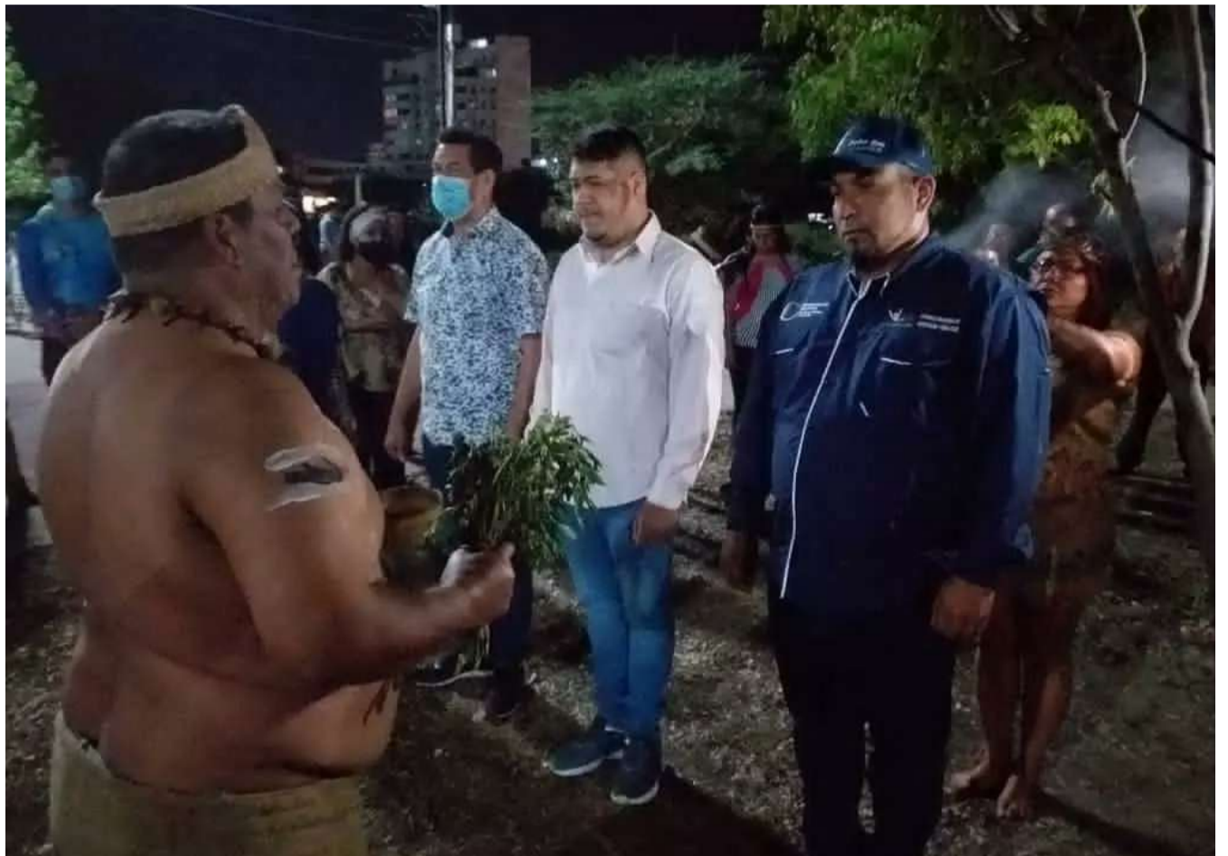
The works received the blessing of the native peoples

Minister Lorca reflected on the meaning of World Earth Day: "every April 22 the whole world reflects on the negative actions of human beings that directly im-