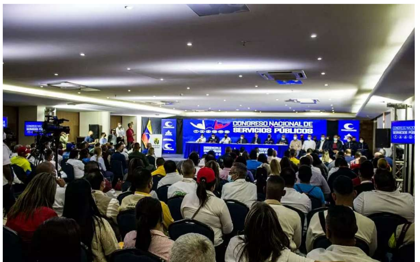
It is expected to respond to the requirements of the communities