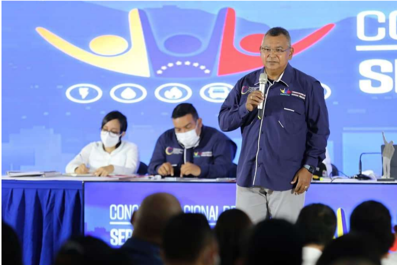
During the congress they outlined roadmaps with solutions

The Sectoral Vice President of Public Works and Services, G/J Nestor Reverol, pointed out that this Friday the National Congress of Public Services, Sucre chapter, was installed in Cumaná, with the purpose of “to know directly the requirements of their communities, through Social Cartography, which allows for early victories in basic services.”