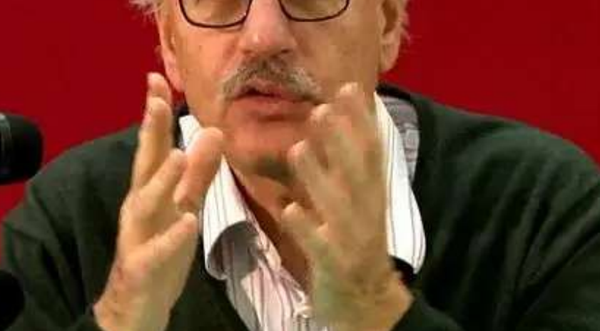
Michäel Löwy, theorist of Ecosocialism

a political system that articulates good the management of ecosystems and a co-management of equitable and harmonious society, it should not be content ideas, with beautiful good intentions and pleas, but must assume a