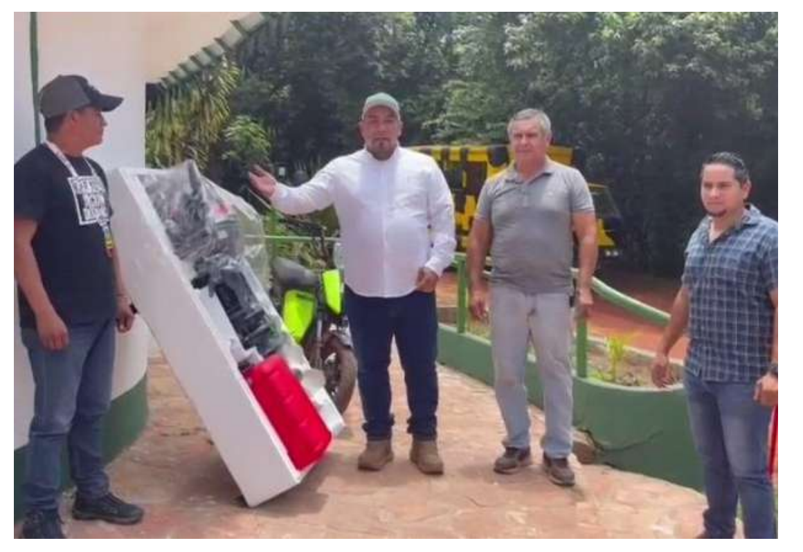
The operations module was also rehabilitated

he Minister of People's Power for Ecosocialism, Josué Lorca, delivered to the Captaincy General of sector 2 of the Canaima