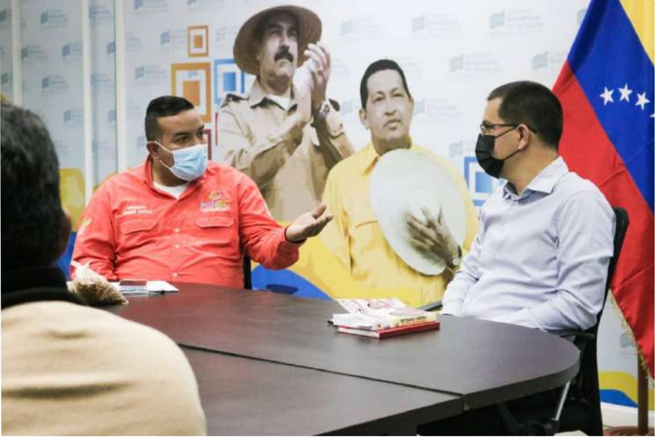
The Recycling and Cleaning Technical Tables will be strengthened

with the Federal Council of Go-Cleaning Technical Tables, for vernment of the Conuco project was examined, which will allow the fulfillment of more than 20% of the goal of the National Reforestation Plan 2022-2023".