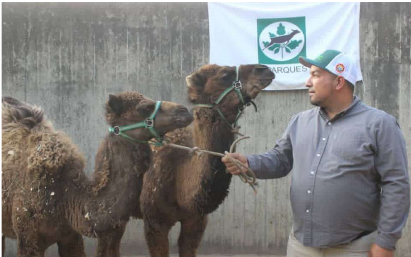
The two camels arrived as part of a cooperation agreement with Spain

At the reception of the animals was the Minister of People's Power for Ecosocialism, Josué Lorca, who pointed out that they received the two animals from Spain "in an agreement with an important zoo in that country, to join the list of animals that we have received this year.