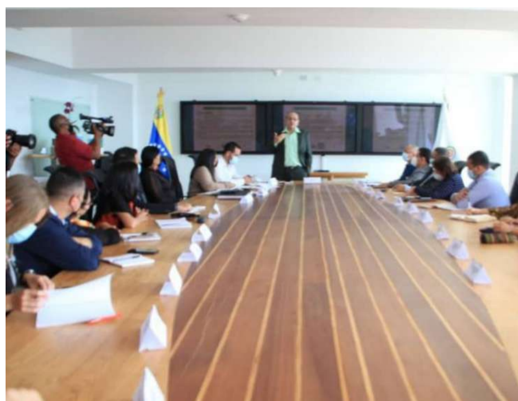
This initiative brings together different actors from the public and private sectors