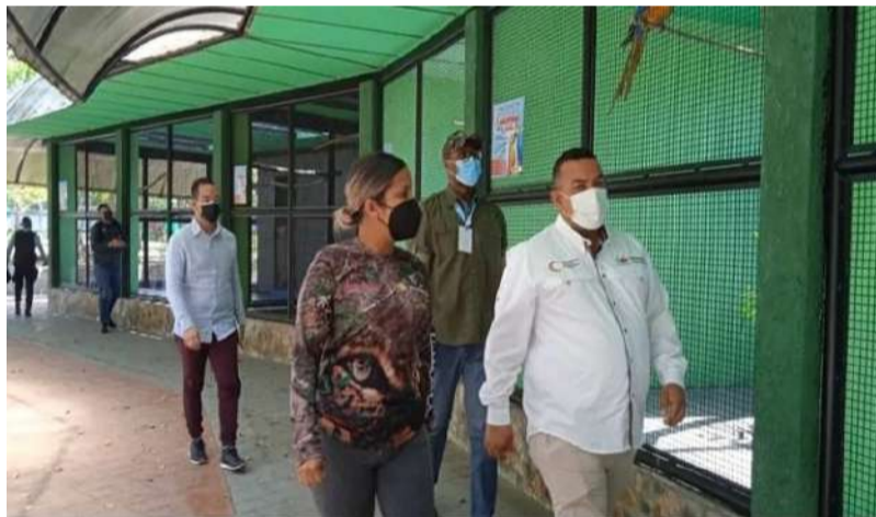
La Guaricha is part of the plan to strengthen zoos

The head of Ecosocialism inspected the place carefully, especially the pits and animal