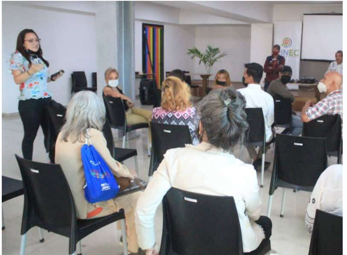
These activities seek to strengthen training in ecosocialist matters

The audiovisual, which was exhibited at the Waraira Repano Hall located on the sixth floor of the Minec headquarters, in the South Tower of El