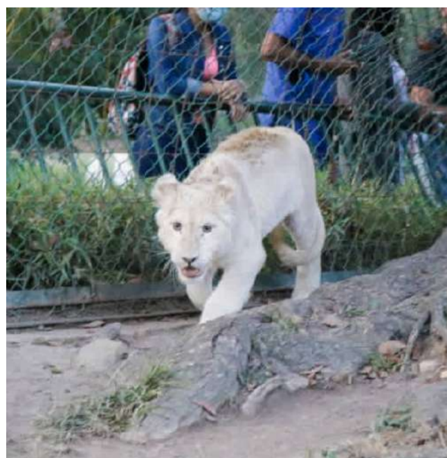
A copy of Leona Blanca is already part of the exhibition