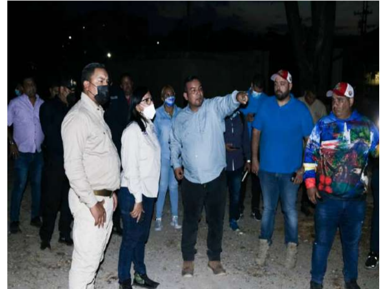
The Las Delicias Zoo will be reopened soon