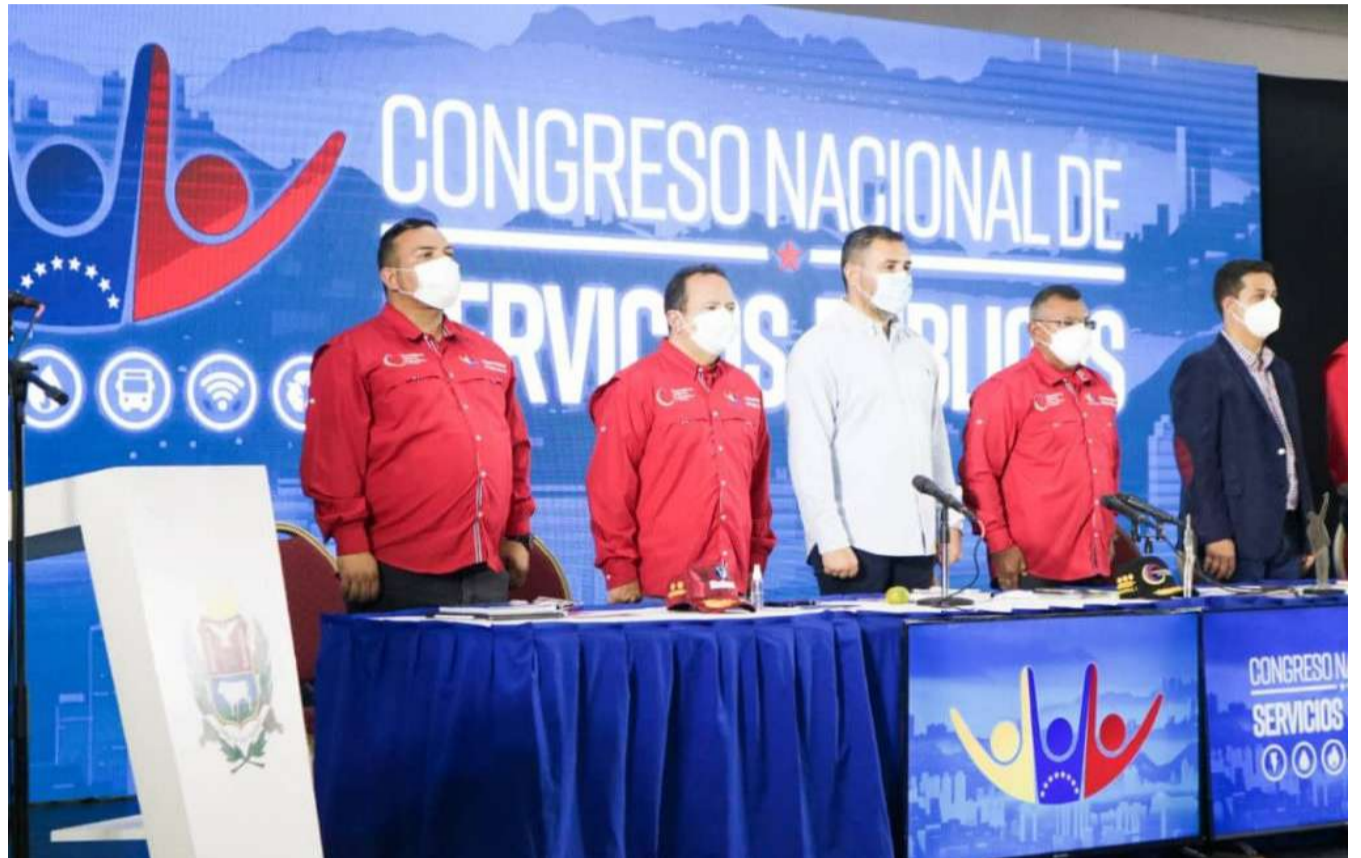
250 Recycling and Cleaning Technical Tables were formed

"Likewise, it will serve users who need to travel to and from San Félix, Puerto Ordaz, Upata, Tumeremo and Santa Elena, in Bolívar state; as well as El Tigre, Anaco, San Tomé, Urica, Santa Rosa and San Mateo de Anzoátegui. We will also have departures to Tucupita, in Delta Amacuro", he explained.