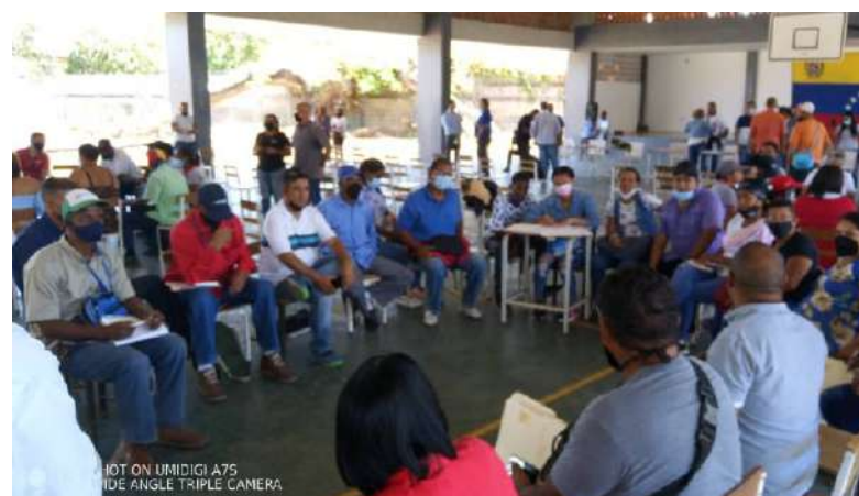
A General Staff of Public Services will be created in the area