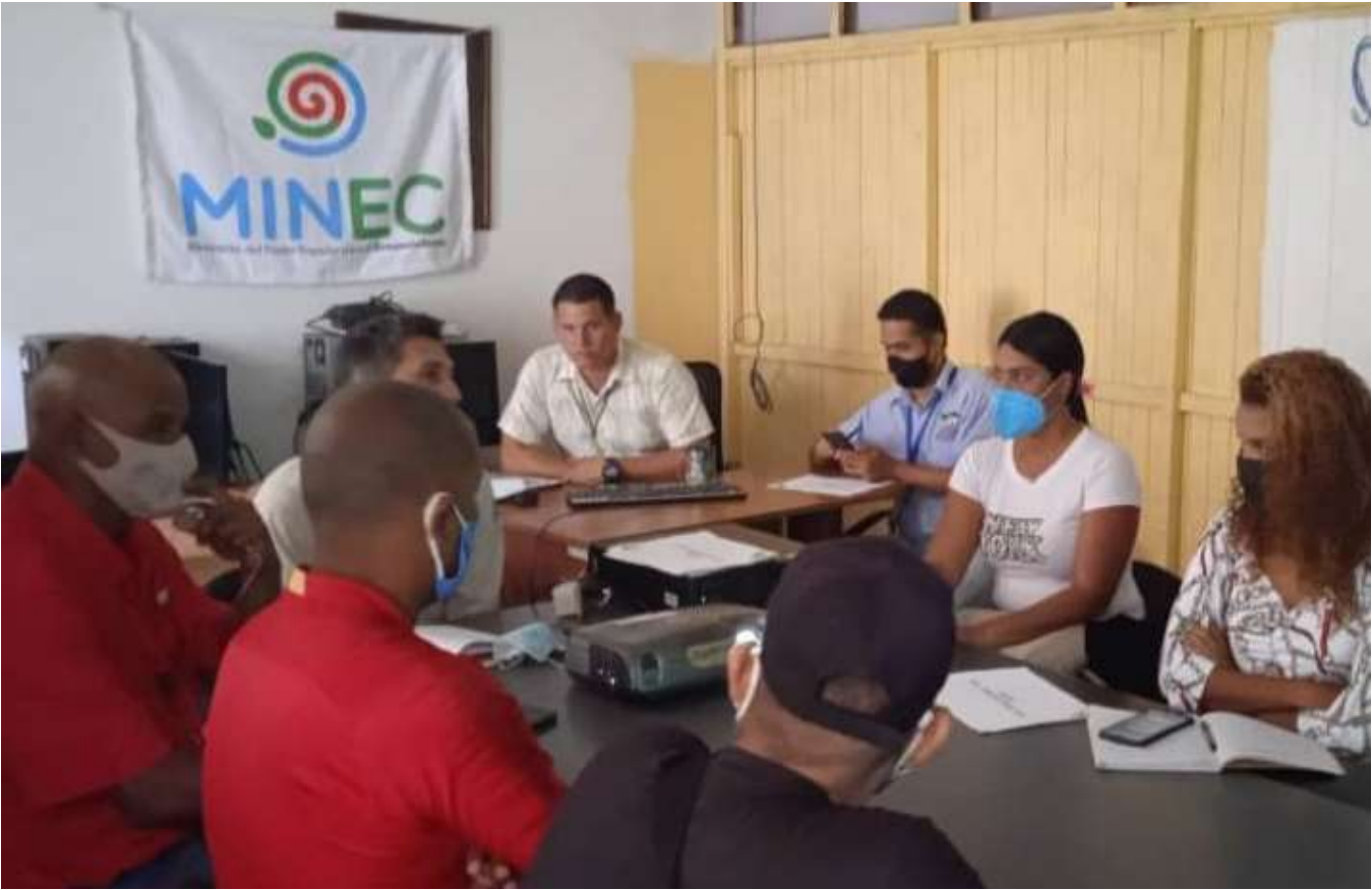
More than 50 METRAS were installed in two municipalities

Likewise, it was determined that the plan "One student, one tree" will be developed by the Educational Zone of the Ministry of Education, with guidance from