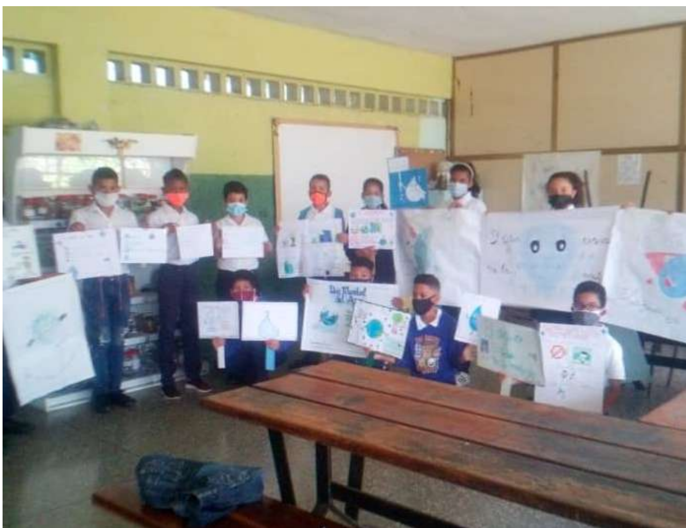
The representatives received a talk on drug prevention and safety

Young people were reminded how we should make rational use of water resources in homes, the water cycle and how important it is for the environment. Likewise, the theoretical-practical workshop on Californian earthworms was given.