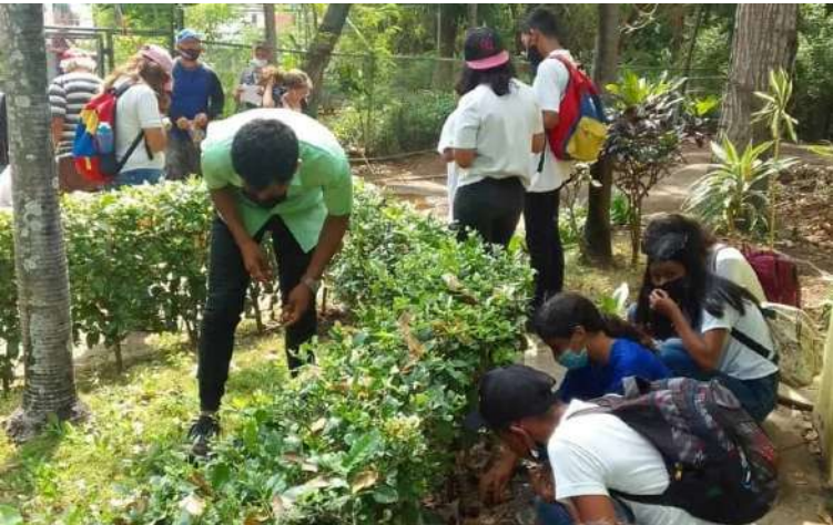
The advice focused on the forest species Apamate, Flamboyant and Samán

Members of the Brigades Against Climate Change and