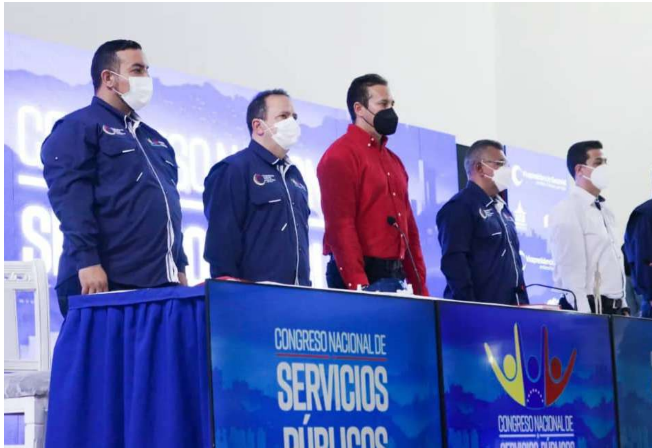
Activate expressway lighting plan

In order to meet the requests corresponding to the area by the Popular Power, the Congress of Public Services was installed in the town of Calabozo, Guárico state.