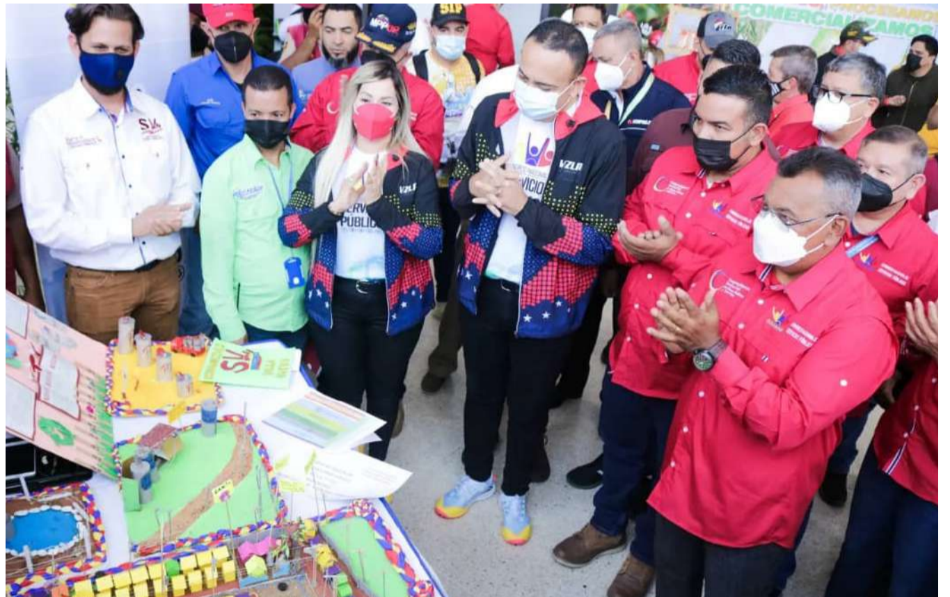
Discuss projects for the benefit of the community

The Sectoral Vice President recognized the work of the Bolivarian National Armed Forces (FANB) and assured that the transversal axis of the stabilization of public services has to go hand in hand with security and supervision, with the aim of