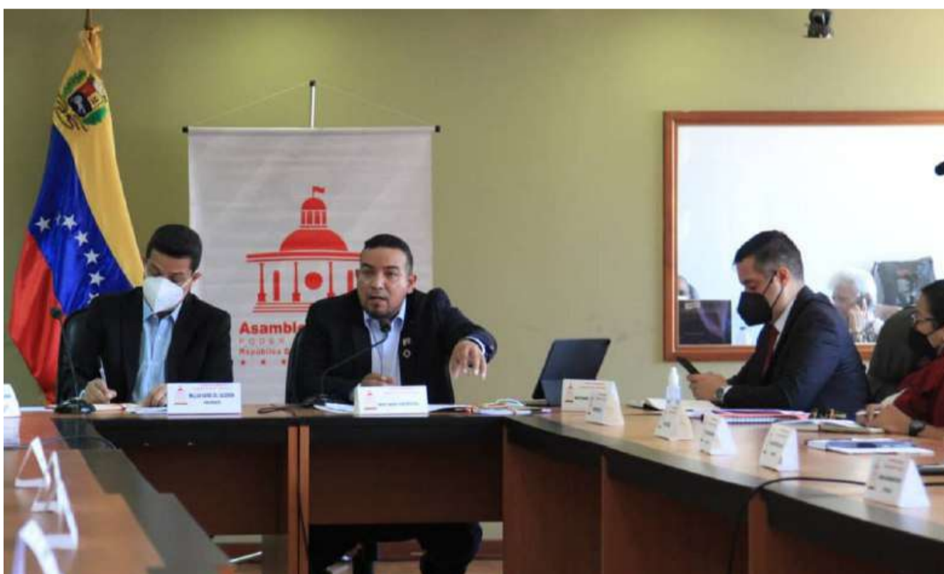
They will ensure efficient removal of garbage

"President Nicolás Maduro announced that this 2022 is the year of public services, and we are complying with the instruction with this presentation, which is now going to its natural cycle of debate with the People's Power to be