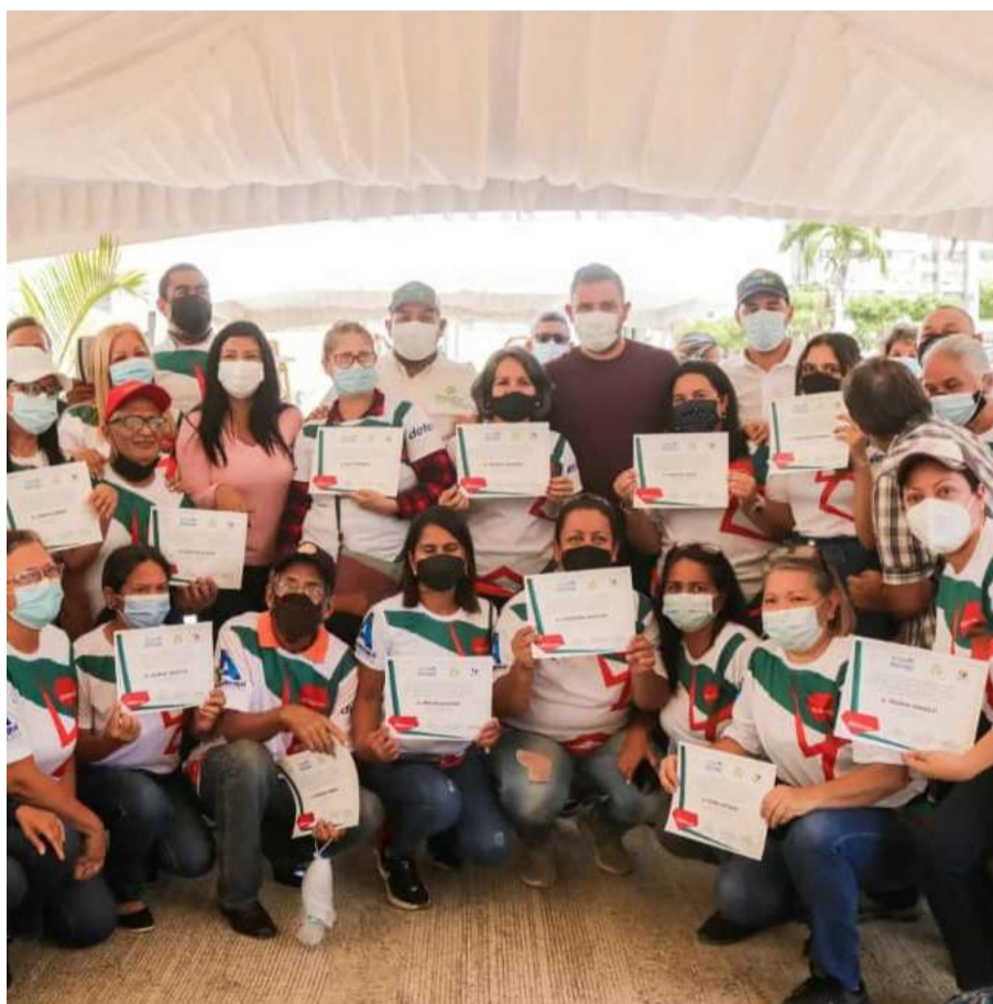
The plan "Everything is transformed" will be promoted

Last Saturday the 26th, the Minister of Popular Power for Ecosocialism, Josué Lorca, together with the Governor of the Anzoátegui state, Luis José Marcano, and the Mayor of the Simón Bolívar municipality of the aforementioned entity, Sughey Herrera, promoted the implementation of the recycling plan "Everything is transformed",