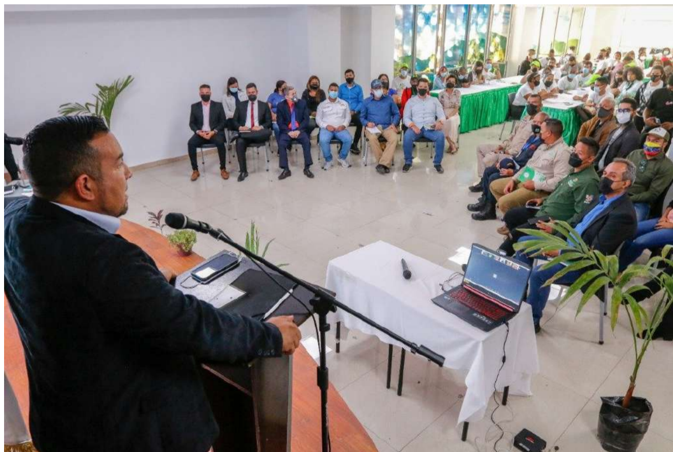
Through five strategic lines they will reach the goal

The Minister of Popular Power for Ecosocialism, Josué Lorca, announced that the National Reforestation Plan 2022-2023 includes five lines of action that will allow the establishment of 10 million trees in the aforementioned period.