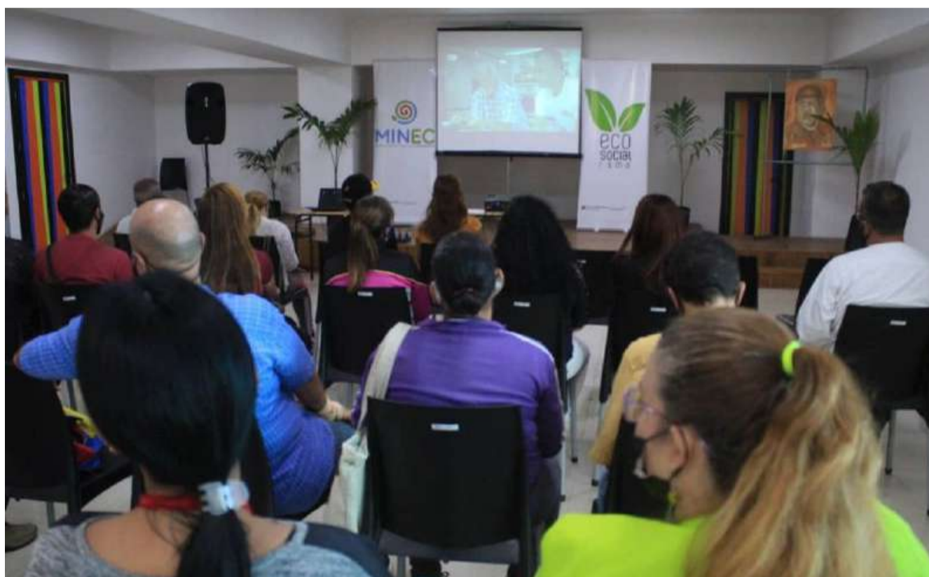
The documentary argues that planting trees saves the climate

In the continuation of the cycle of film forums called "Climate change, peoples, planet and life", the General Directorate of Training of the Ministry of the Popular Power for Ecosocialism (Minec), screened the documentary "New forests to better protect our climate".