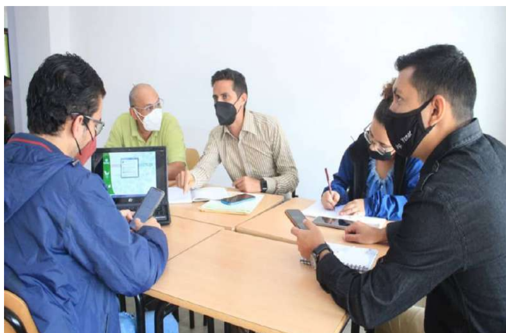
The launch of the National Reforestation Plan is scheduled for the end of this month

"In principle, the National Reforestation Strategy contains five programs: urban planning, family agroforestry, planting life, conservation, and one student one tree", he concluded.