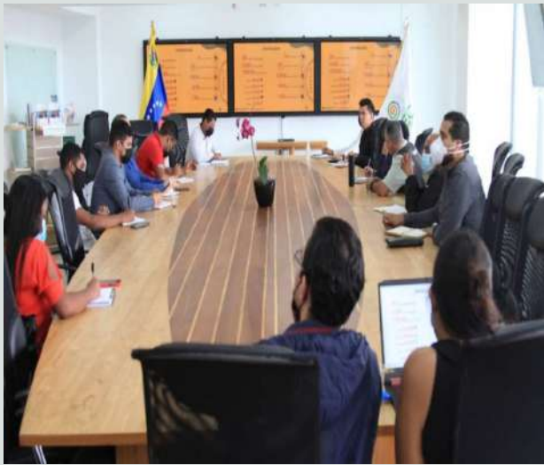
Plant production is expected to increase

At the headquarters of the Ministry of the Popular Power for Ecosocialism (Minec), the National Coordinator of Community Nurseries was installed this Tuesday. Through the figure it is expected that the organization will be facilitated, in order to obtain better results together with the community members and promote the production of fruit, forest, medicinal, ornamental, horticultural, forage plants and other species.