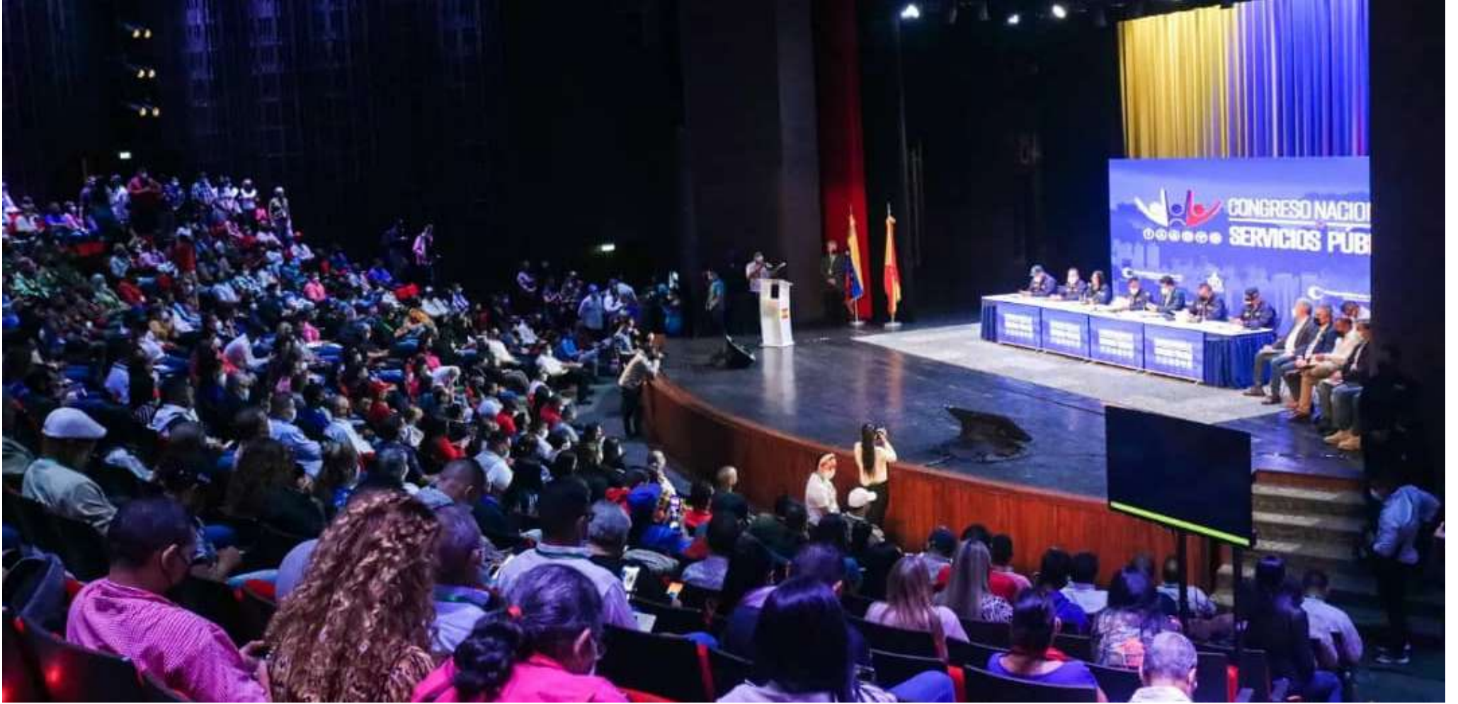
Work tables will be permanent

Last Wednesday, at the Teatro de la Ópera de Maracay (TOM), located in the Girardot municipality, the first Congress of Services, Chapter Aragua, was installed, with the presence of the Vice President of Services and Public Works, G/J Néstor Reverol, and the corresponding ministers of the Executive Power.