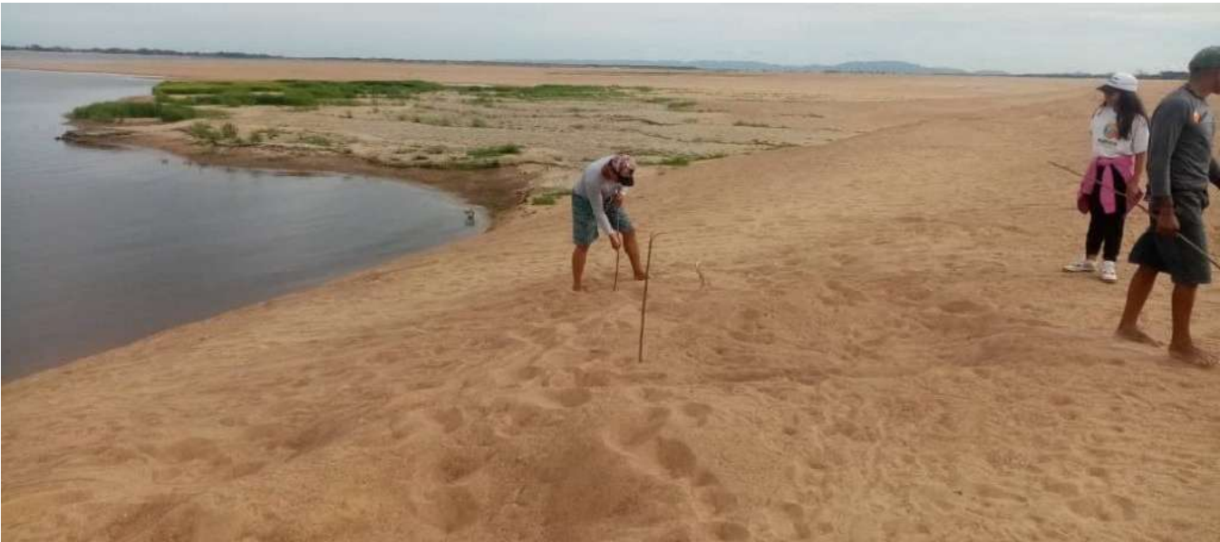
This action seeks to preserve the species

The work teams of the General Directorate for Coordination of the Ecosocialist Territorial Units (UTEC) of the Amazonas and Apure state, synchronized with the General Directorate of Biological Diversity of the Minec and the Amazonas State Government, continue with the