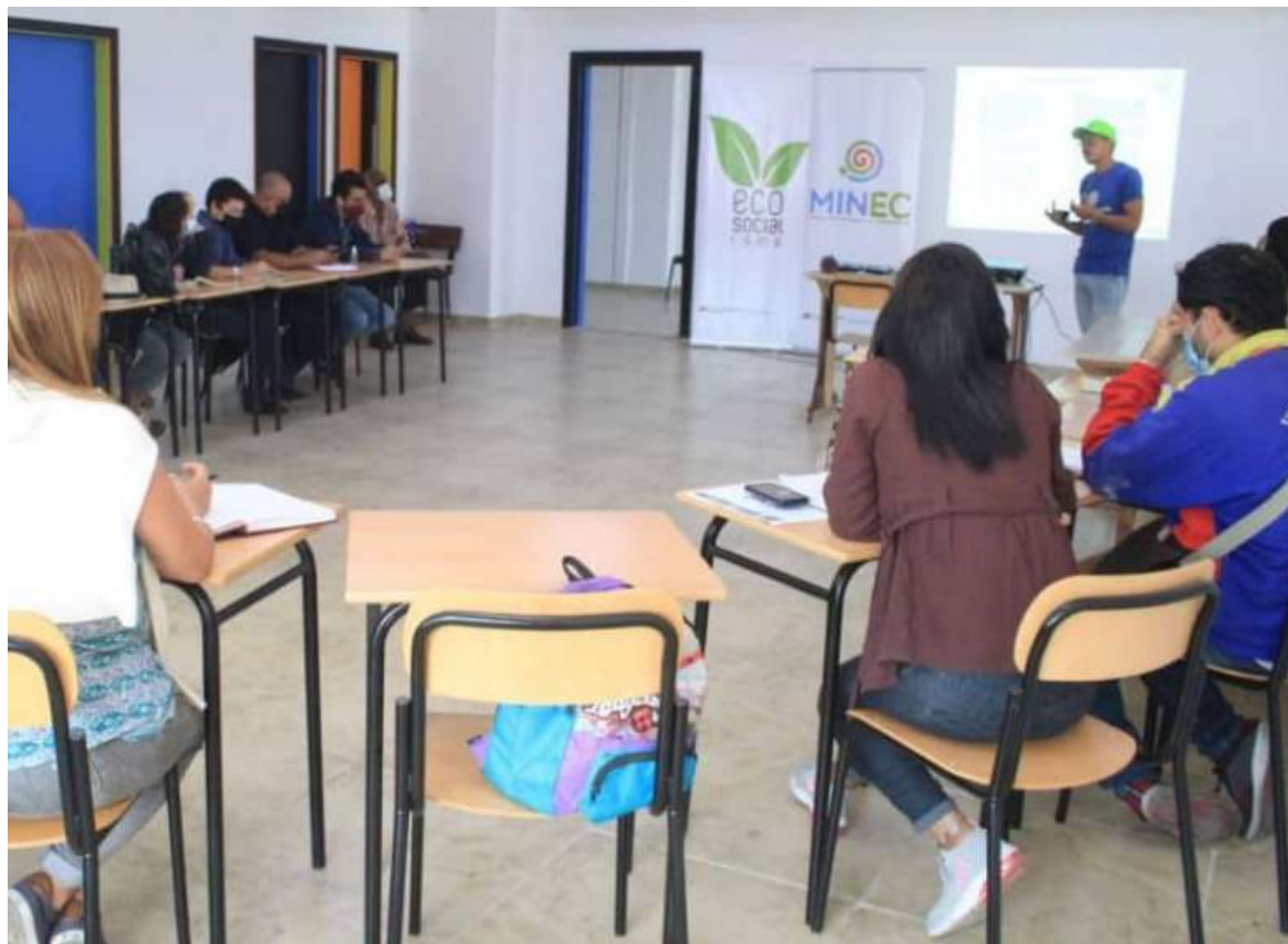
The goal for 2022 is to plant a million trees

In order to channel the efforts of the Ministry of the Popular Power for Ecosocialism ( Minec ) and its attached entities, technical tables were set up to strengthen the National Reforestation Strategy 2022-2023.