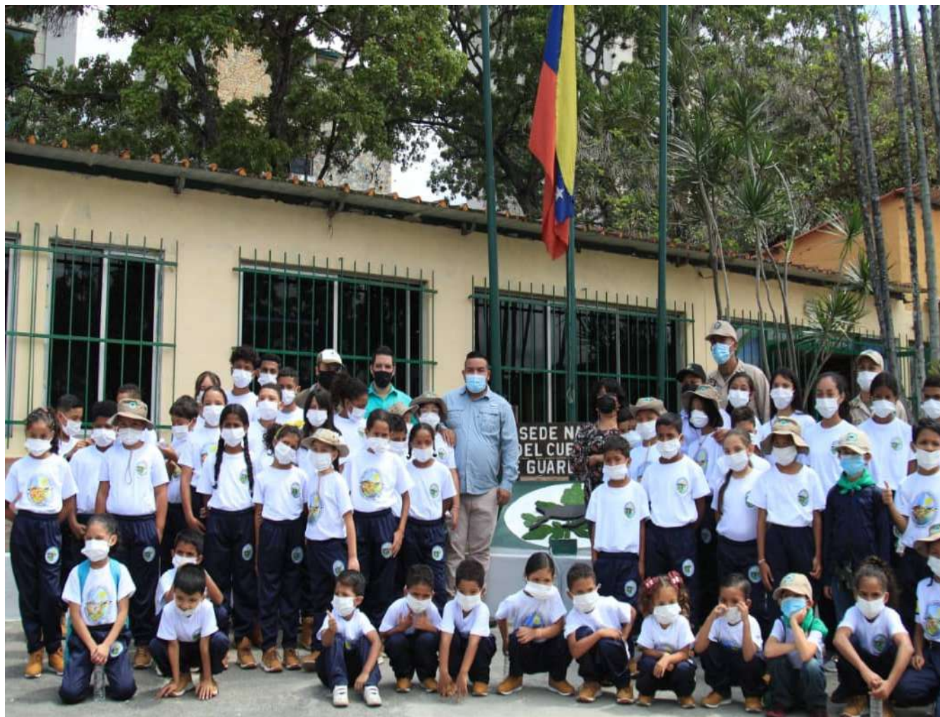
More than 2700 children make up the little park rangers

This Saturday, the Minister of People's Power for Ecosocialism, Josué Lorca, participated in the inauguration of the first headquarters of the Little Park Rangers, located on Rómulo Gallegos Avenue to the east of Greater Caracas, seat of the Civil Guard Corps.