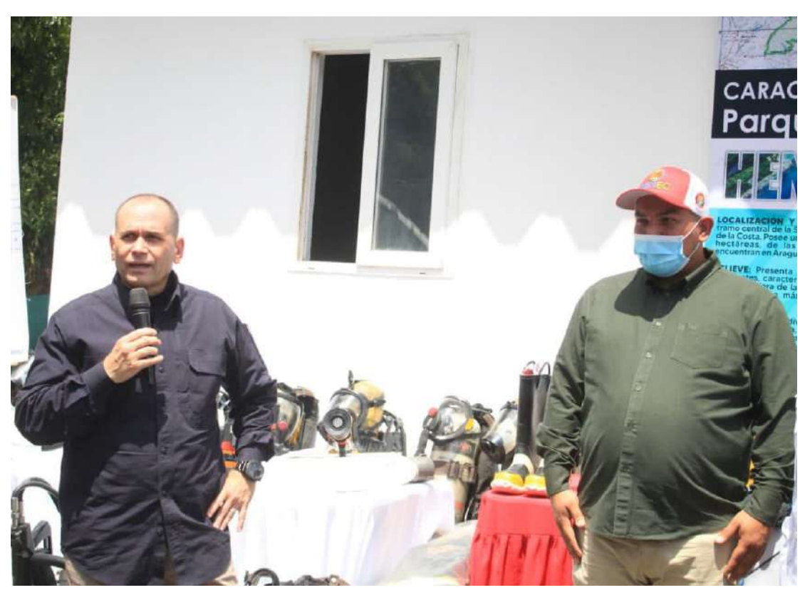
Ministers Lorca and Ceballos inaugurated the space

the occasion commemorating the Day of the Forest Combatant in the state of Aragua, the Ministry of People's Power for Ecosocialism (Minec), the Sectoral Vice Presidency of Citizen Security and the Governor's Office of the entity, inaugurated the Forest Fire Station "Cap /B Alirio de Jesús Quintero" Las Cocuizas, in the Henri Pittier National Park, located in the Girardot municipality.