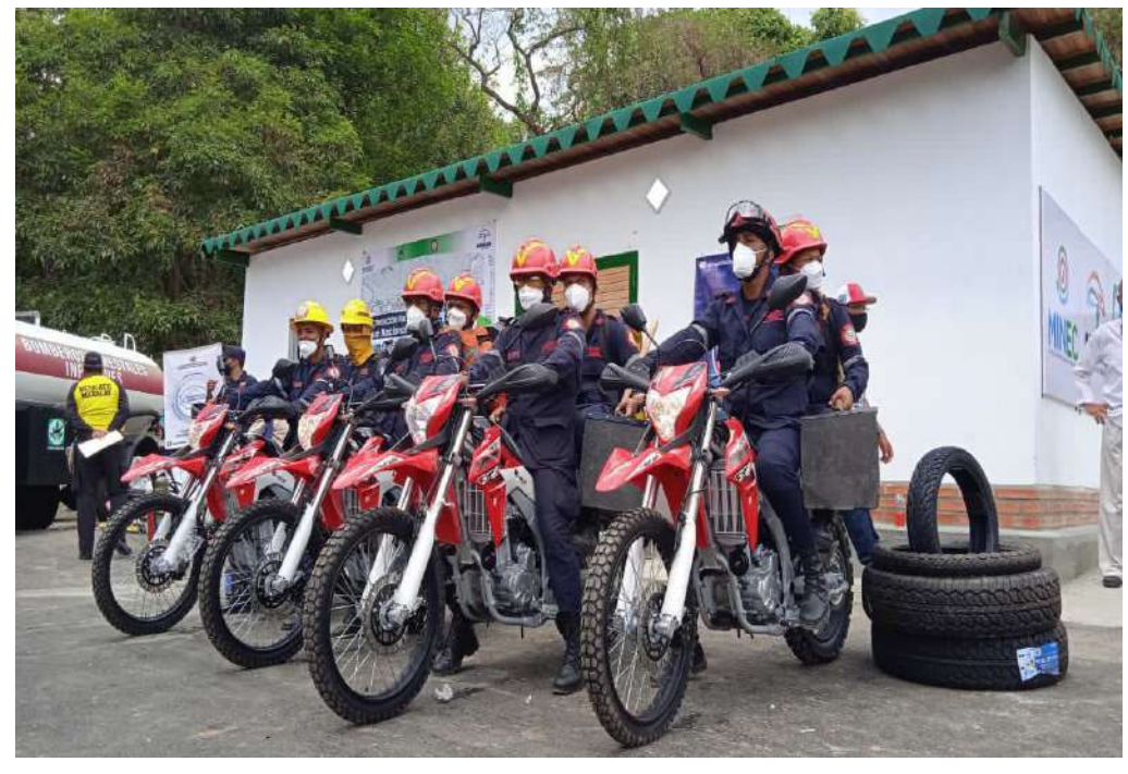
The activity commemorated the day of the forest combatant

"We are organizing ourselves to personal System and we are moving towards its empowerment. Here we are delivering a significant In this regard, Minister Lorca amount of materials. In addition,