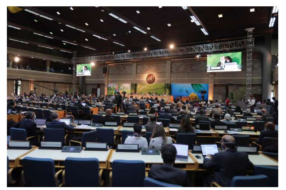
The summit was held in the city of Nairobi, Kenya

Assembly adopted be resolutions, two declarations and a decision on a reduction of pollution and for the protection and restoration that of nature.