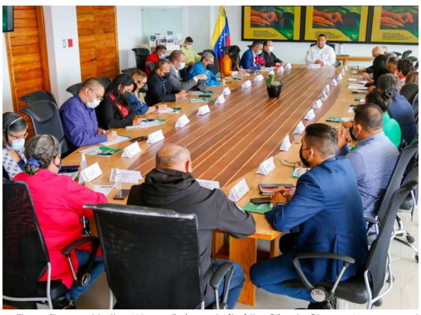
They will present to the AN a preliminary draft of the Climate Change Management