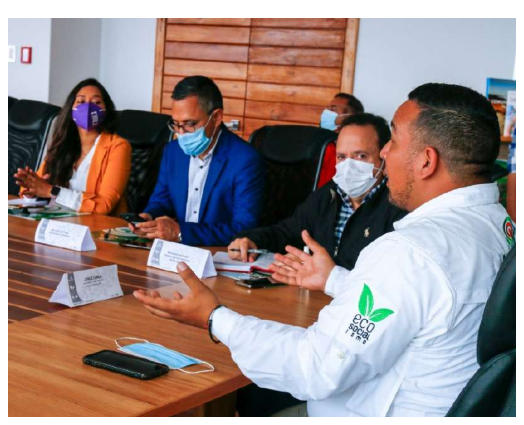
Various institutions make up the commission

"The proposal is novel and will comes to complement all the the decisions of National the Government, so that it is not only the central government and the Bolivarian Revolution, but also private companies and universities, that are committed mitigation to to the care and preservation of Mother Earth," he assured.