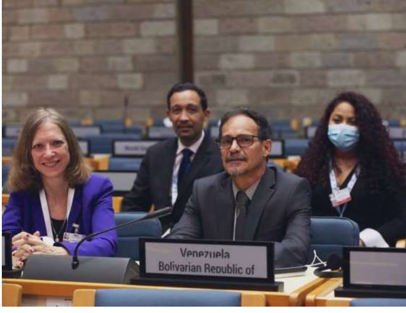
The Venezuelan delegation defended the country's progress in environmental matters

delegation The Venezuelan important announced that resolutions on environmental matters were adopted, among which the historic approval of working on the creation of a legally binding instrument to combat pollution produced by plastic stands out.