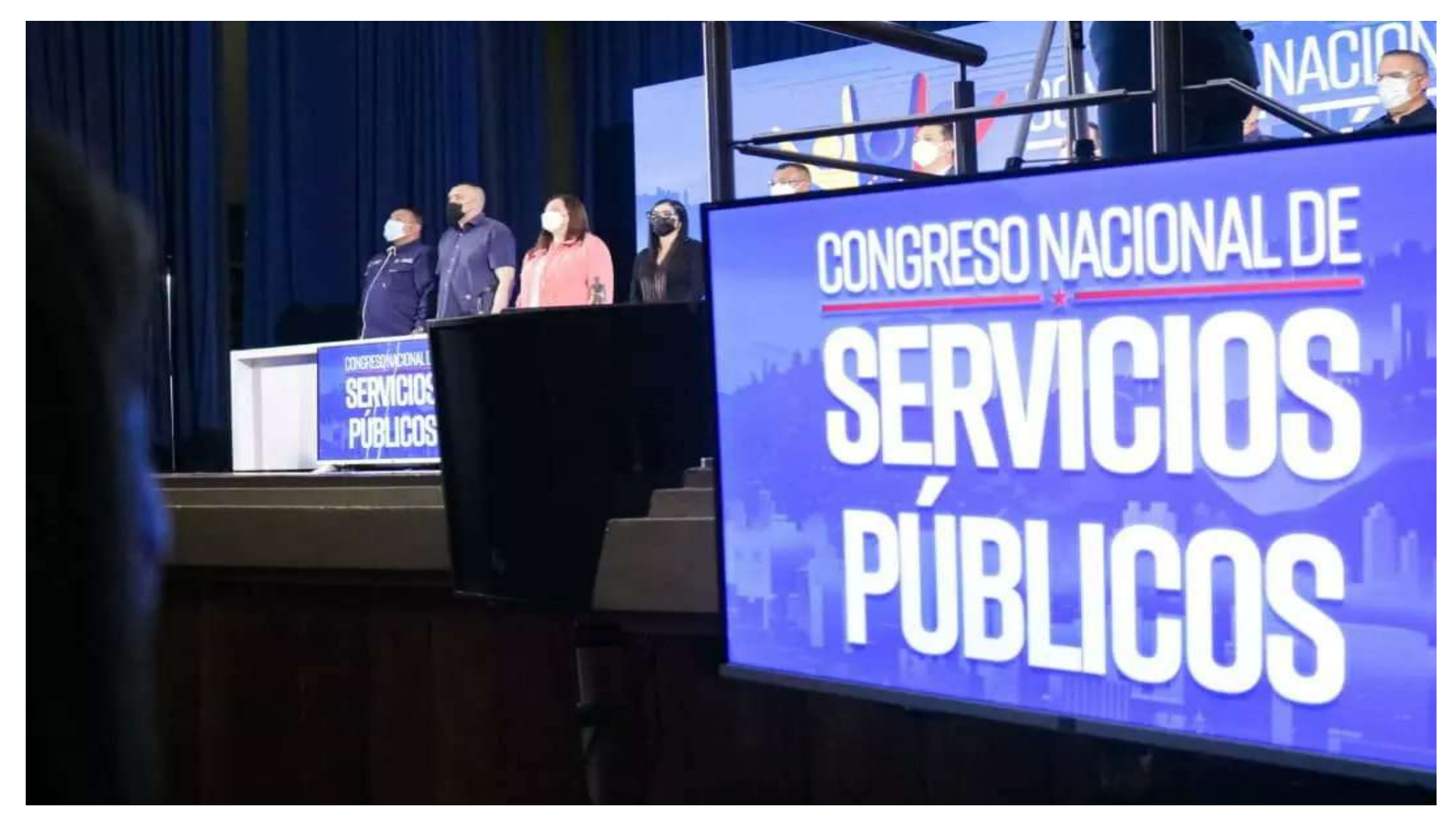
The congress has spread throughout the country

his Friday, at the Military People's Academy of the Bolivarian National Guard (Amgnb), in Caracas, Tiuna, Congress of Services, Capital District chapter, was installed.