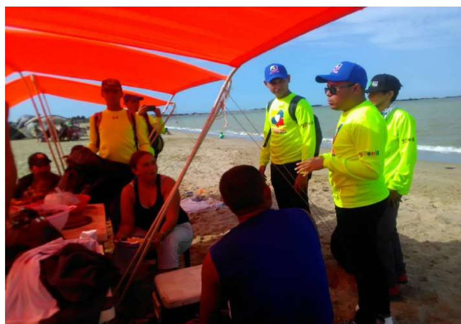
The Minec workforce was deployed during the operation

preserve natural spaces and their visitors, registering a very high incident rate low with just 36