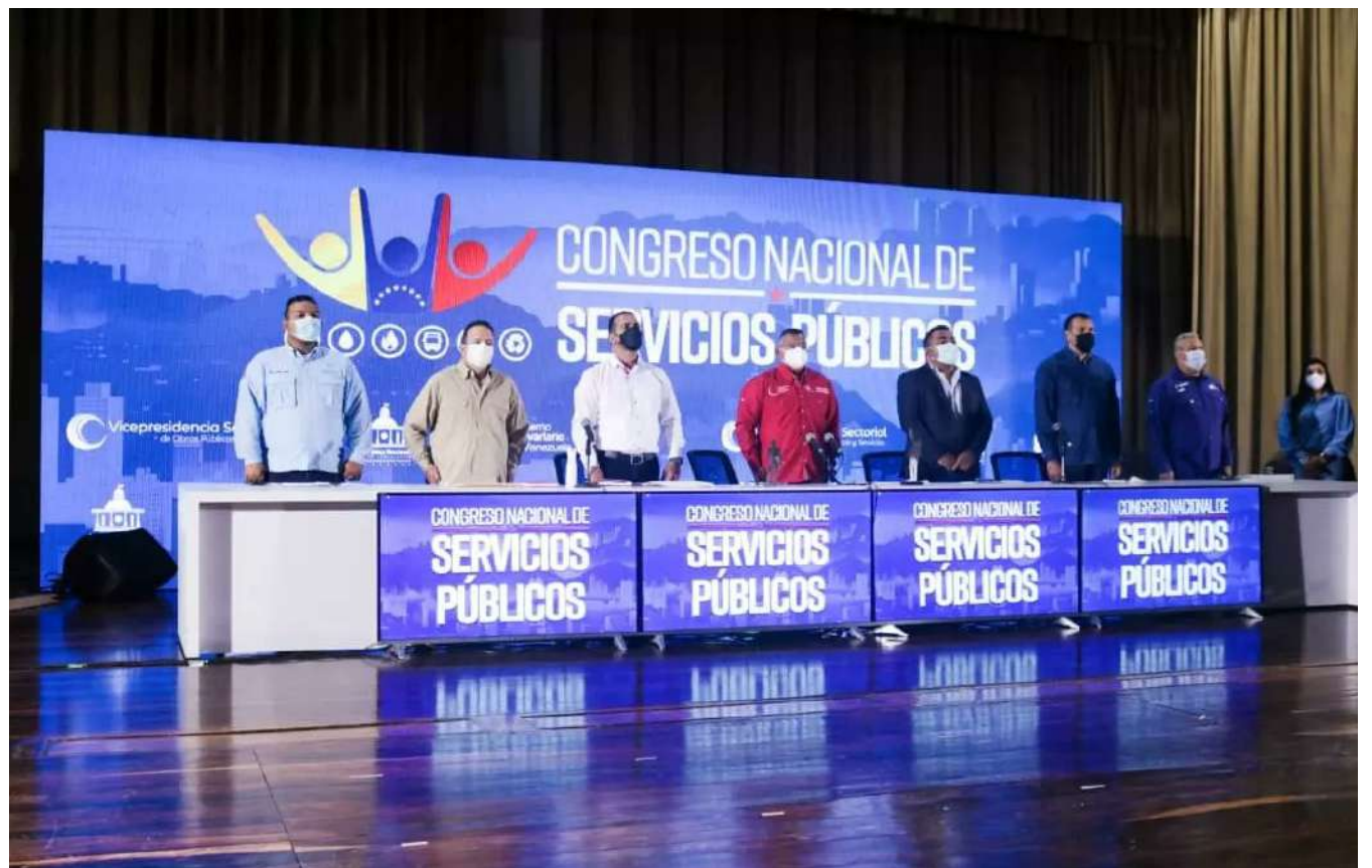
The Ministries that make up the public services sector serve each entity

Governor José Alejandro Terán indicated that public services