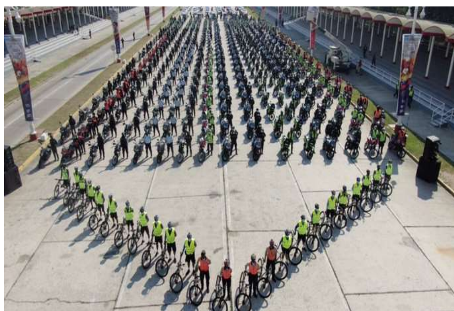
MINEC servers join the Biosafe and Happy Carnivals operation

Likewise, during the Carnival holiday, the campaign "Give a ride to the garbage" will be developed, an initiative that adds more than 600 people, between men and women who make up the Brigades Against