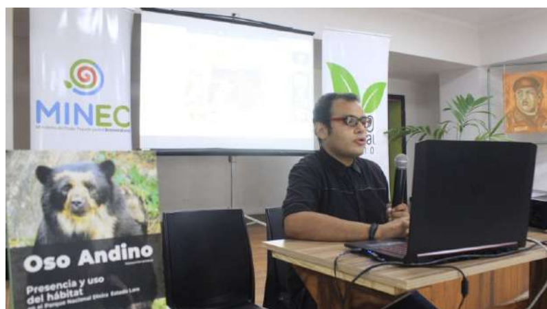
There were national and international speakers

"This is basic to continue in the environmental education of the Venezuelan population and beyond our borders," he said.