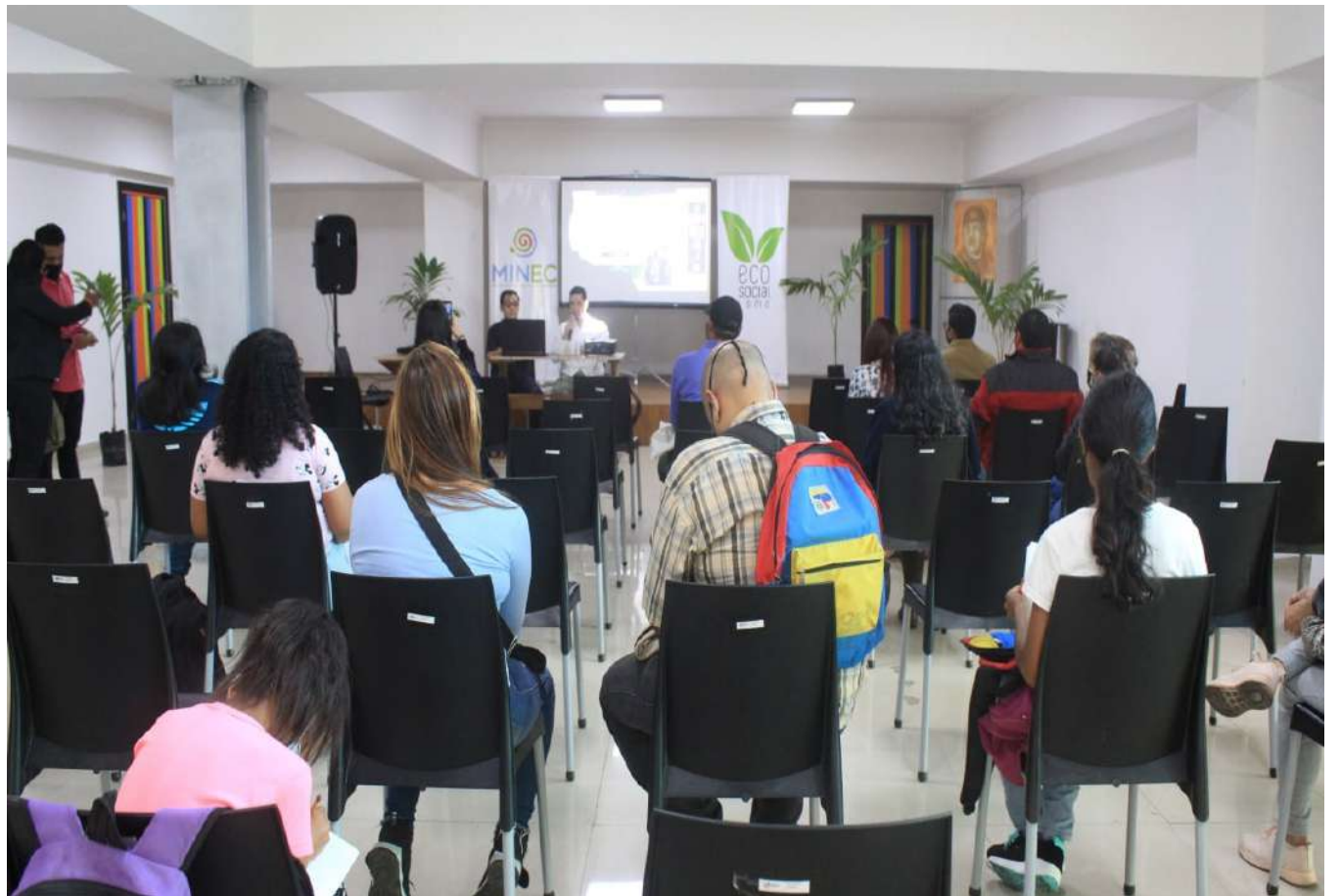
These activities are intended to massify research in environmental matters

"We have had a high level presentation, with three level speakers with experience on this species", he said.