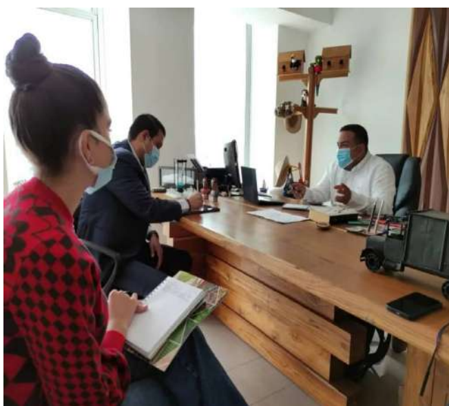
They worked on expanding the supply of wood products

The Ministry of Economy, Finance and Foreign Trade, together with the Ministry of Ecosocialism and the company Maderas de Venezuela and Turkey (Mavetur), held a meeting to establish a roadmap that will speed up procedures with a view to strengthening exports from the forestry sector in 2022.