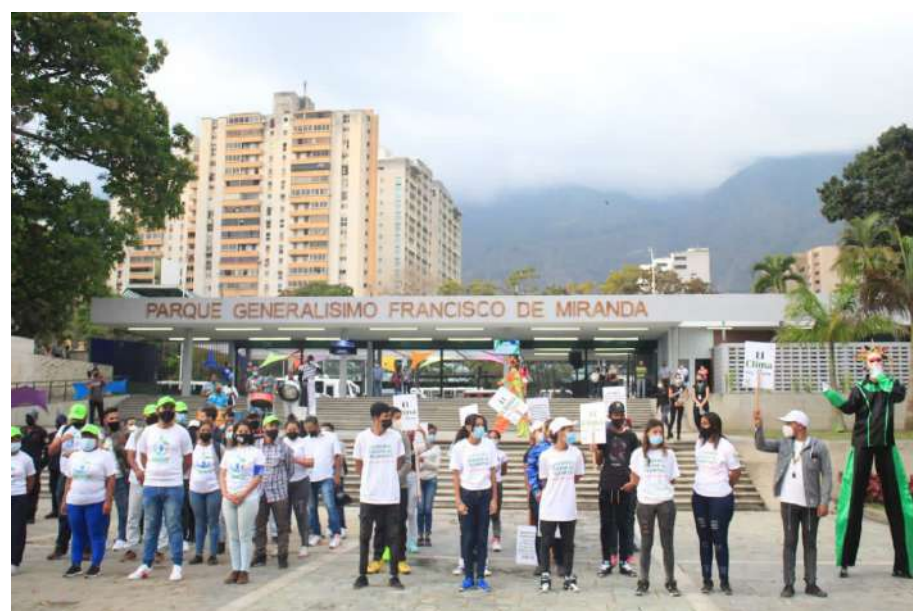
Girls and boys will be able to fully enjoy the Park