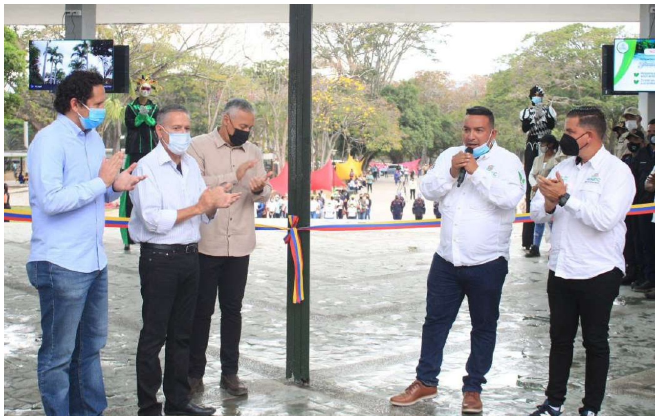
With this reopening the park is 100% operational in all its parts

This Friday, the Minister of People's Power for Ecosocialism, Josué Lorca, together with other Executive, state and municipal authorities, participated in the reopening of the main facade of the Generalissimo Francisco de Miranda Recreational Park.