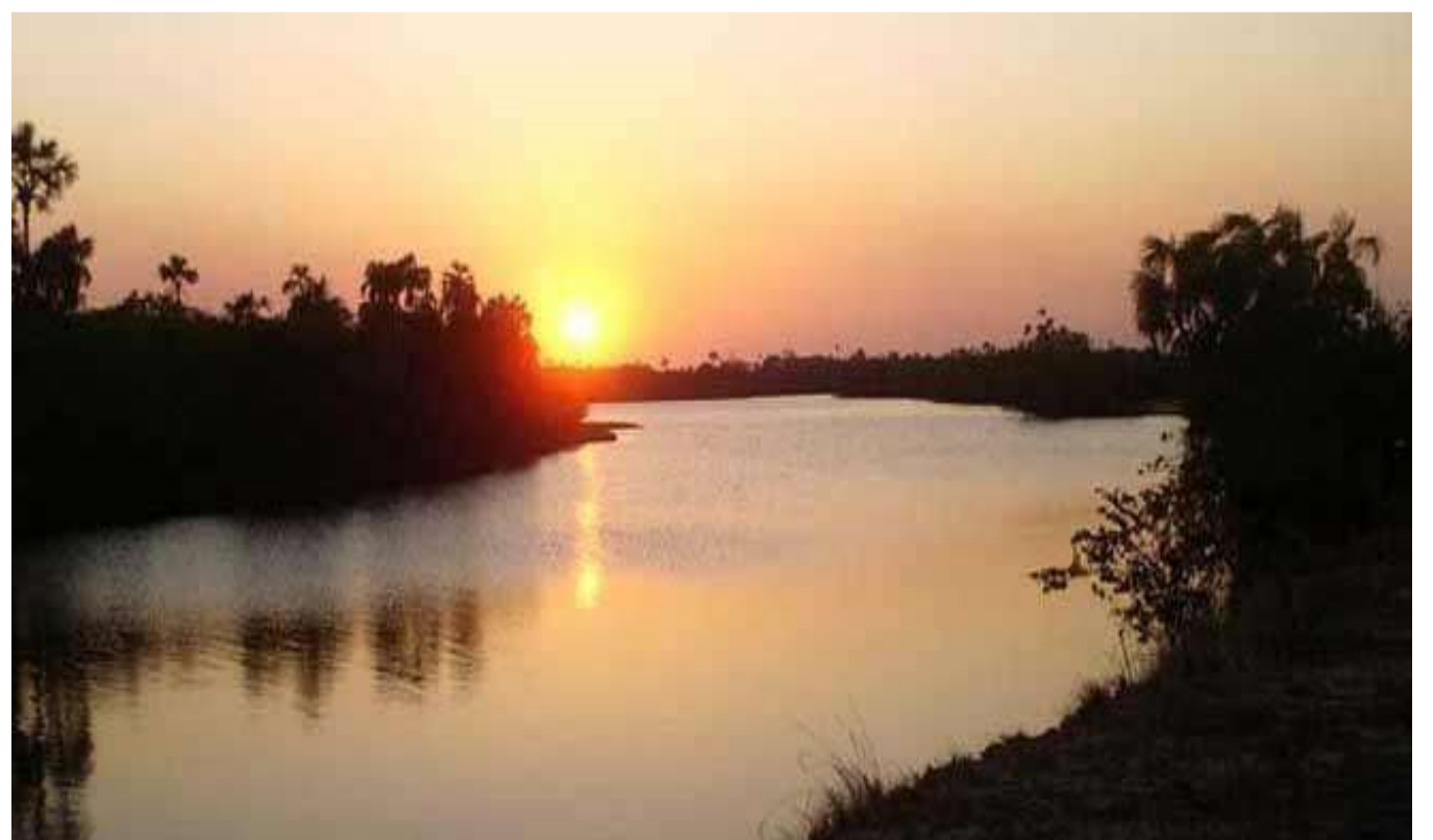
The Park has an area of 584,368 hectares

Macanilla freshwater beach, considered the largest in Venezuela and the second in Latin America, another of the main attractions are the Galeras de Cinaruco, unique rock formations in the Venezuelan plains.