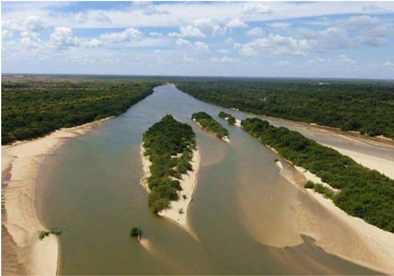
It was created in 1988 according to presidential decree No. 2018 on February 24

The Santos Luzardo National Park, also known as the Cinaruco - Capanaparo National Park (or vice versa), is located between the Capanaparo and Cinaruco rivers and their confluence with the Orinoco River, in the jurisdiction of the Pedro Camejo and Achaguas municipalities of Apure state.