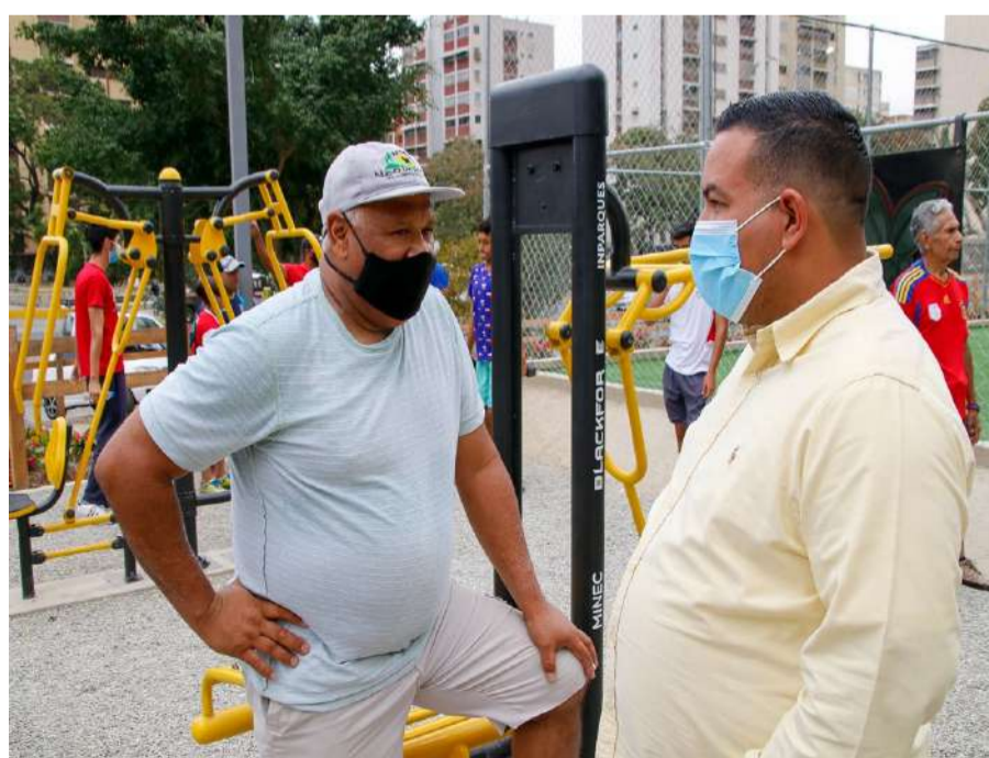
Minister Lorca supervised the activity

He recalled that the mobilization of disinfection is national "in the places with the highest traffic of the population. Usually, these sessions are cyclical because they are repeated from time to time".