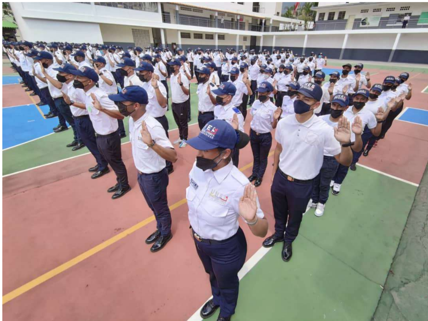
The new brigade members join 5,000 young people in the process of training in environmental matters

The People's Power Minister for Ecosocialism, Josué Lorca, swore in students from the National University for Security (UNES), as brigade members against Climate Change and Guardians of the Tree, in an act that took place in the multipurpose patio of the educational institution in the Sucre parish (Catia) of the capital.