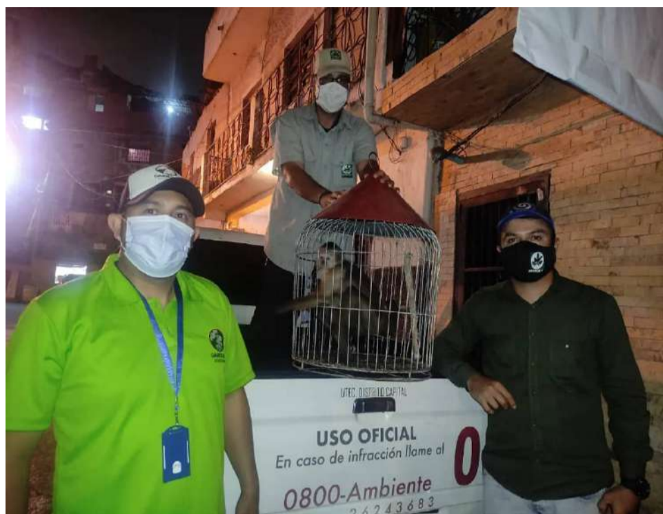
The specimen was moved to the Caricuao Zoo

A commission made up of personnel from the National Parks Institute (Inparques) and the