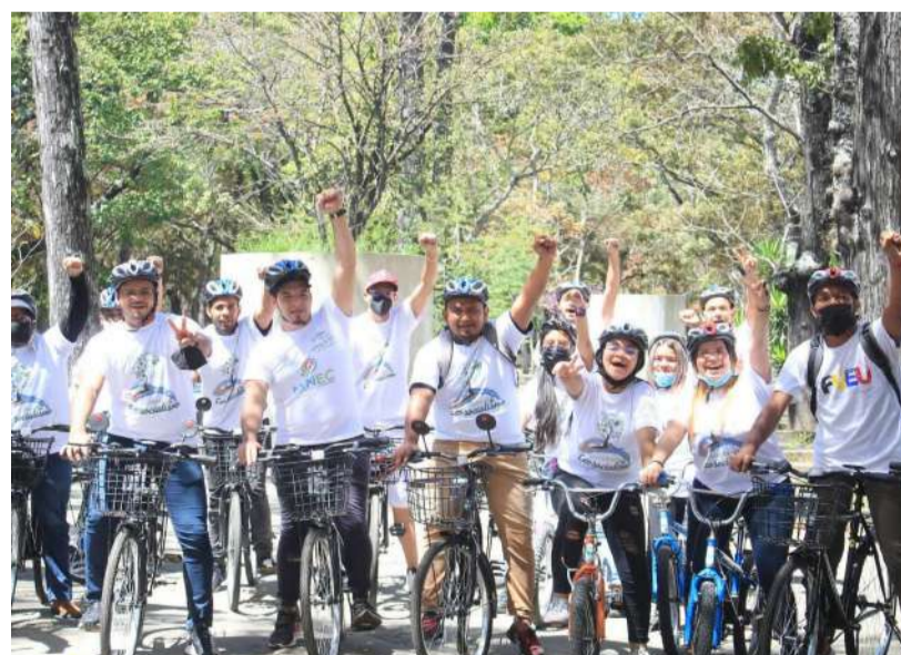
The delivered bicycles will strengthen the use of bike lanes

Likewise, the provision of bicycles will strengthen the use of bicycle lanes in the capital by university students. These actions seek to strengthen the environmental education of our people and contribute to the realization of the 5th historical objective of the Plan de la Patria