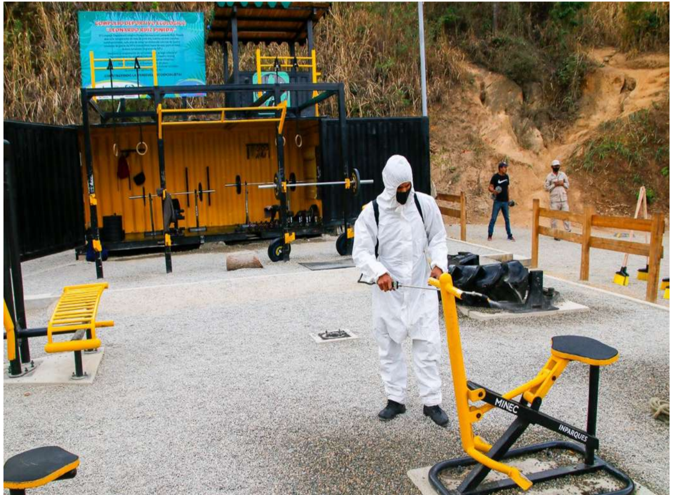
The operations are carried out for the health and good living of Venezuelans

He commented that this time it was for the "Ruiz Pineda de Montalbán Recreational Park, recently reopened, with the news of having courts made with