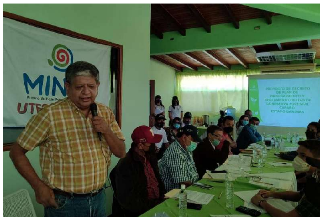
On March 14, an approach will be held in the communities of the Caparo Forest Reserve

the following addresses: dgpatrimonioforestal@gmail.com , supervisionycontrolforestal15@gmail.com and inveforestal@gmail.com