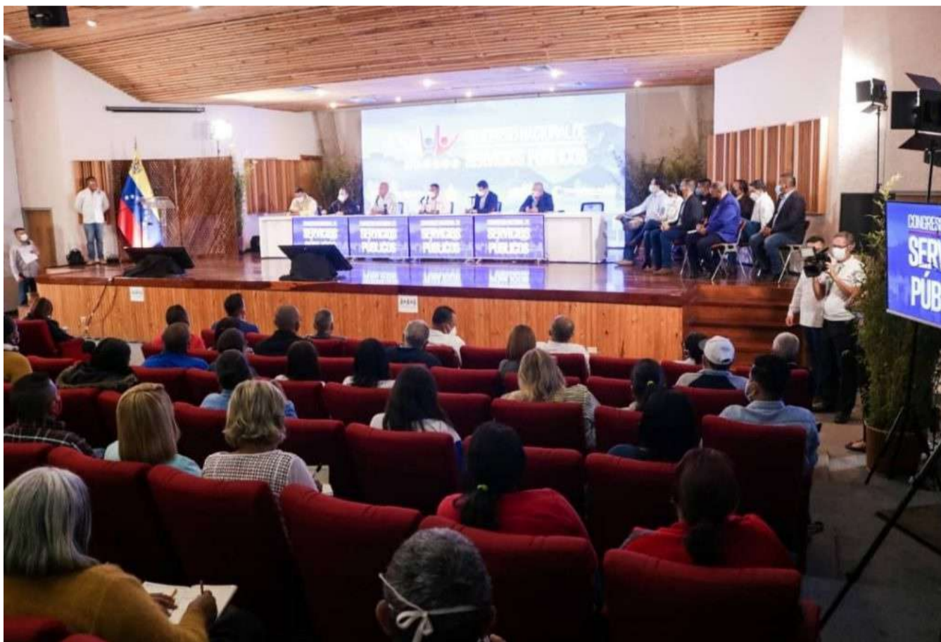
The Congress will be deployed in the 23 states of the country

The Sectoral Vice President indicated that firstly, the purpose of the Congress is to create a joint planning and structure, with all the expressions of People's Power, secondly, street parliamentarism is added with