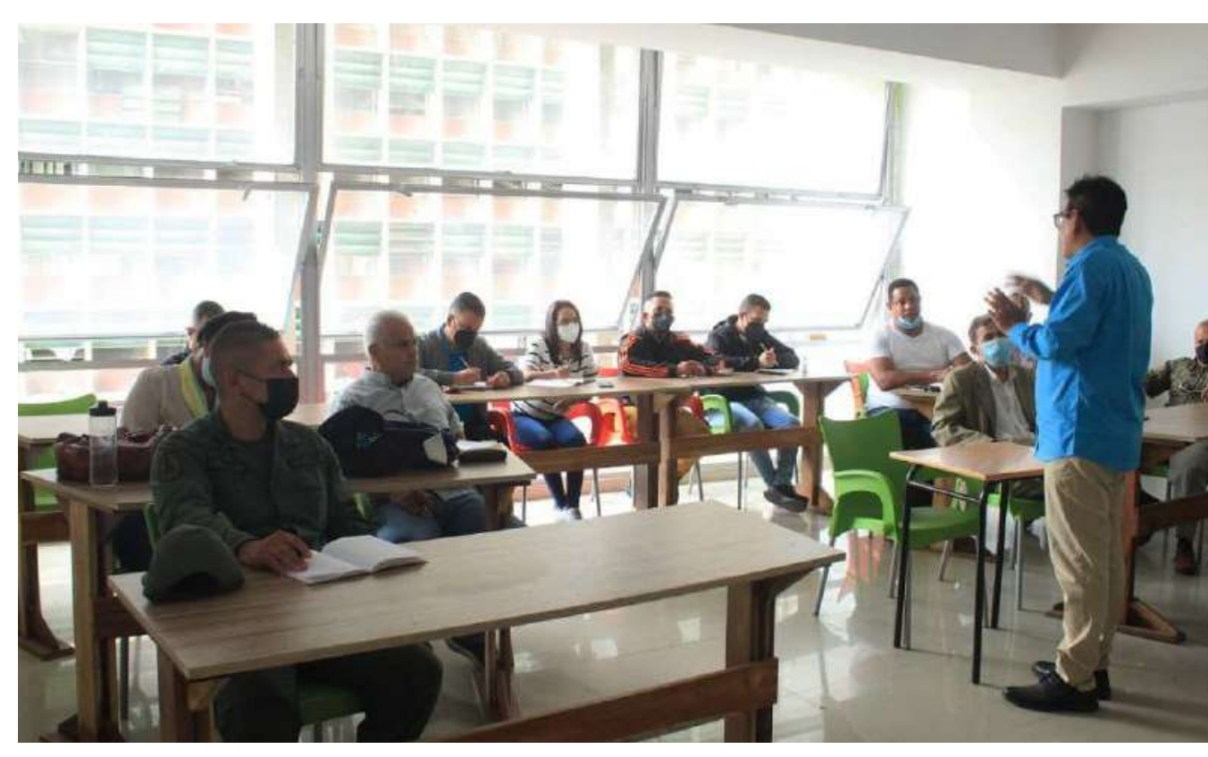
The objective is to train MINEC personnel in Prior Environmental Control

n order to expand knowledge in the Environmental Prior Control, the Ministry of People's Power for Ecosocialism ( MINEC ), developed four conferences to strengthen the capacities of the institution's servers in the matter.