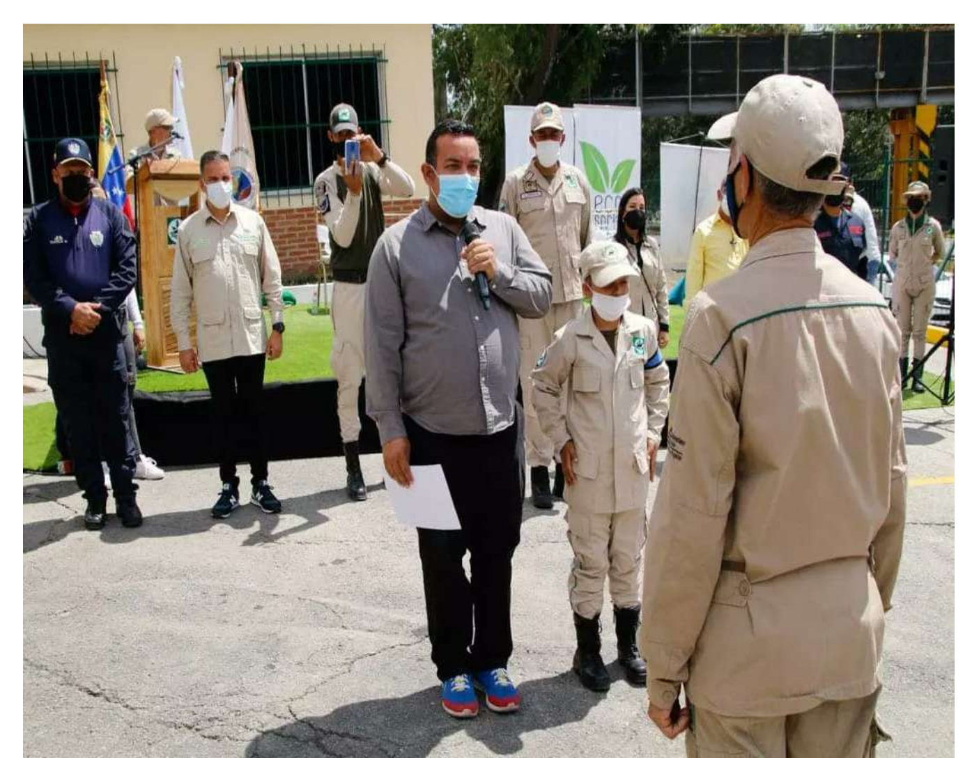
93 park rangers join the work to protect the environment

ithin the framework of the Day of the Park Rangers, the Minister of People's Power for Ecosocialism, Josué Lorca, an emotional act of promotion of a new cohort of 93 heroes and heroines of the country, to whom he also gave a supply of uniforms and equipment the all environmental protection, with the purpose of joining the important work safeguarding 28% of natural The protected areas in country.