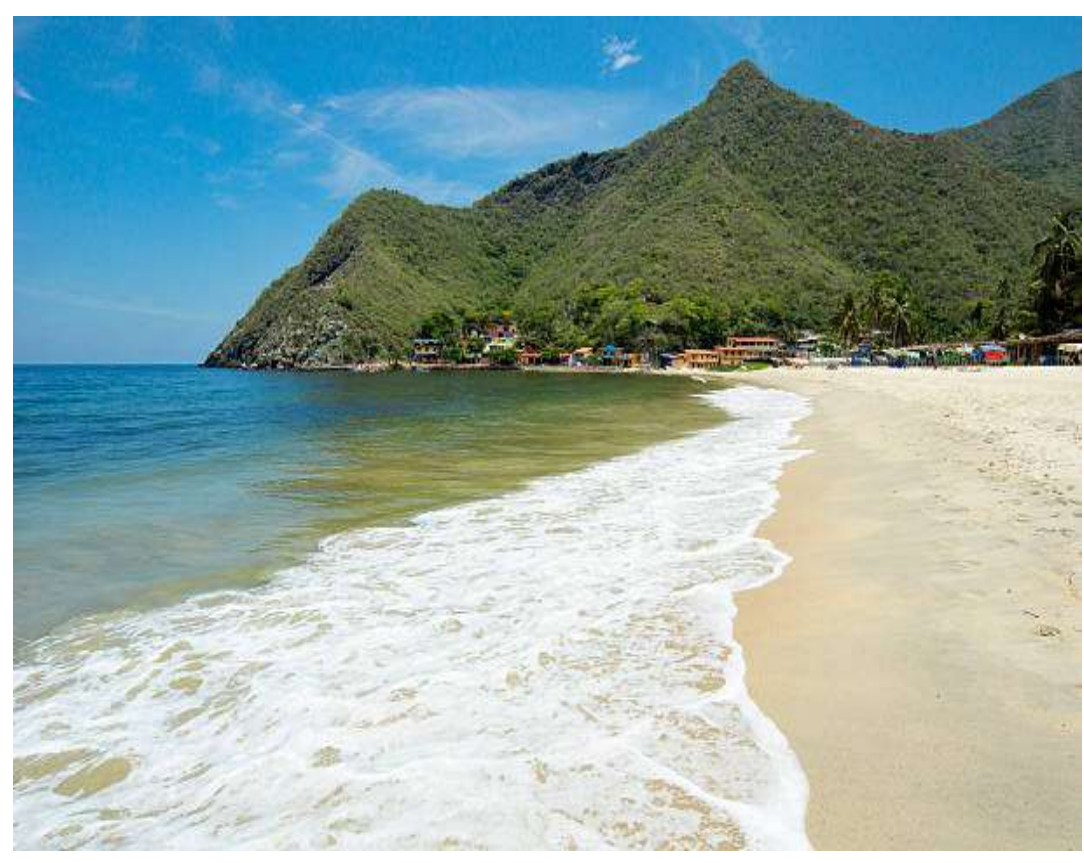
The park also encompasses marine ecosystems

That is why, from MINEC we invite you to conveniently enjoy the natural spaces located in that beautiful place.