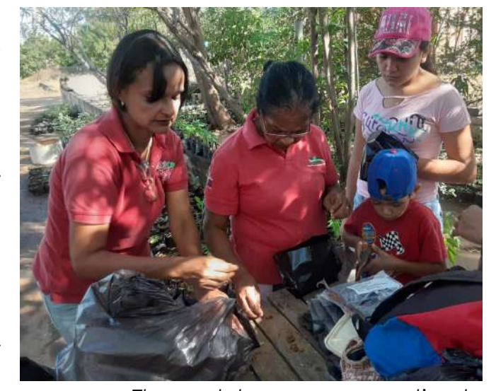
The workshops are a practice to promote environmental education

place in the environmental equipment of the Iclam educational nursery, where parents, grandparents, uncles and children