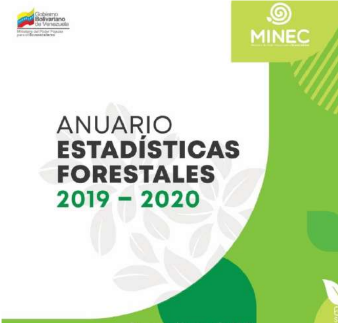
10 forest reserves complete the territory authorized to exploit

Directorate of Forest of the Ministry of Heritage People's Power for Ecosocialism (Minec), published on the Minec website