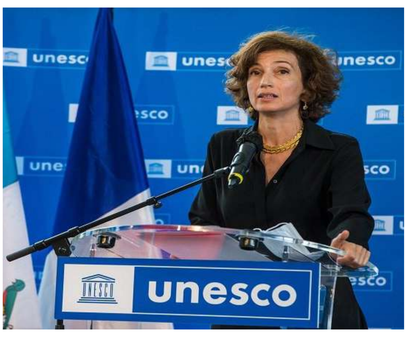
The goal is to update educational programs before 2025

The first step in supervising application be will carried out during the COP27 climate summit,