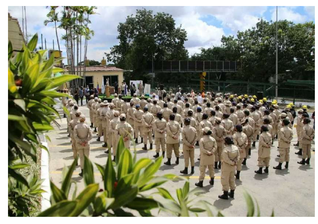
More than 3,000 thousand women and men currently carry out environmental protection tasks

Minister Lorca thanked "this group of men and women who daily make the country continue to grow in terms of biodiversity, continue strengthen all its operational capacities in the protection of nature and continue to meet the 5th Objective of the Plan of the Homeland".