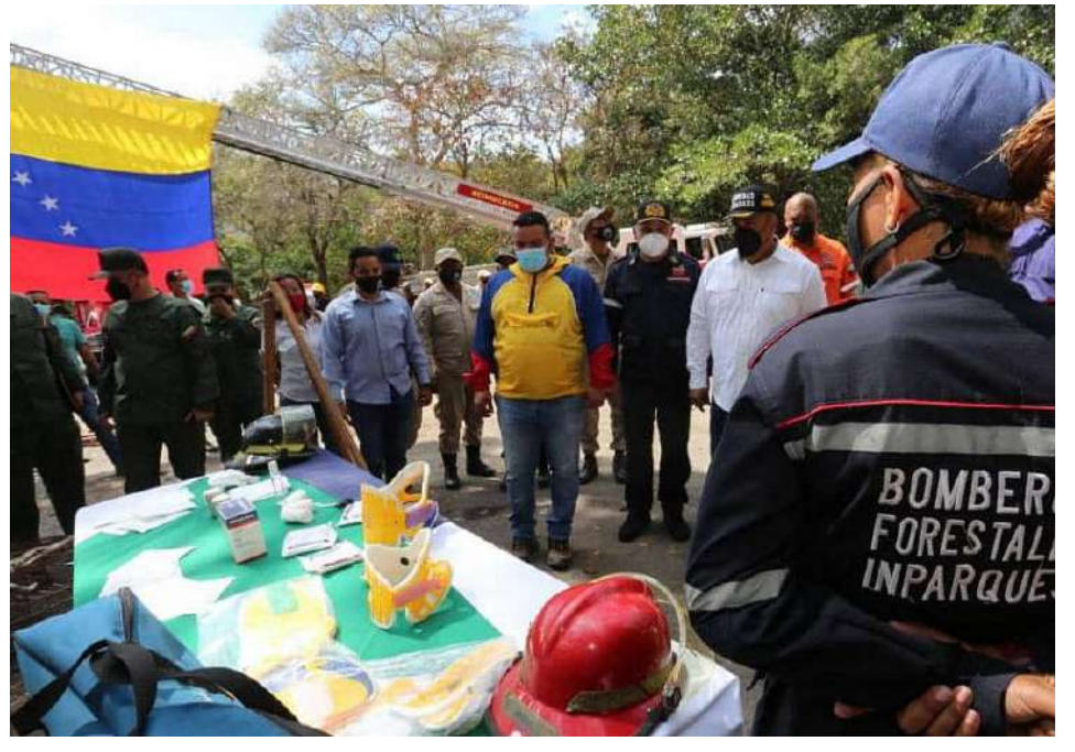
The objective is to reduce the impact of forest fires in the entity

"In that sense, we have acquired leverage new commitments in revolutionary dynamics, which state. Aragua," he said.