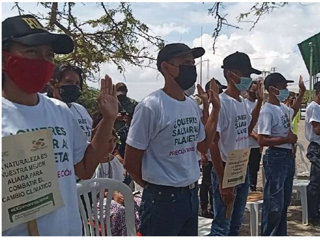
This activity is part of the environmental training offensive throughout the country

Méndez expressed that this is an activity for reflection "we must call our people because we do not have more time, every day our planet is giving us symptoms of