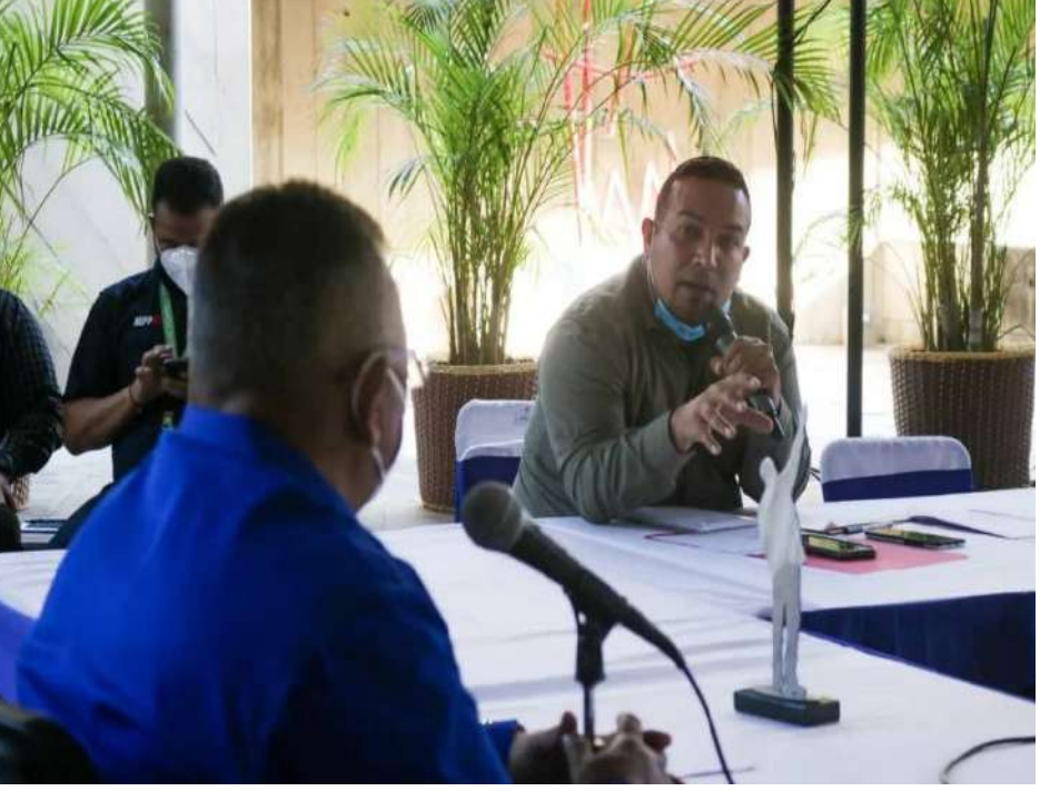
Representative of various ministries participating in the activity

the sociopolitical 1 x 10 in each of the institutions, and the plan in the Federal conjunction with