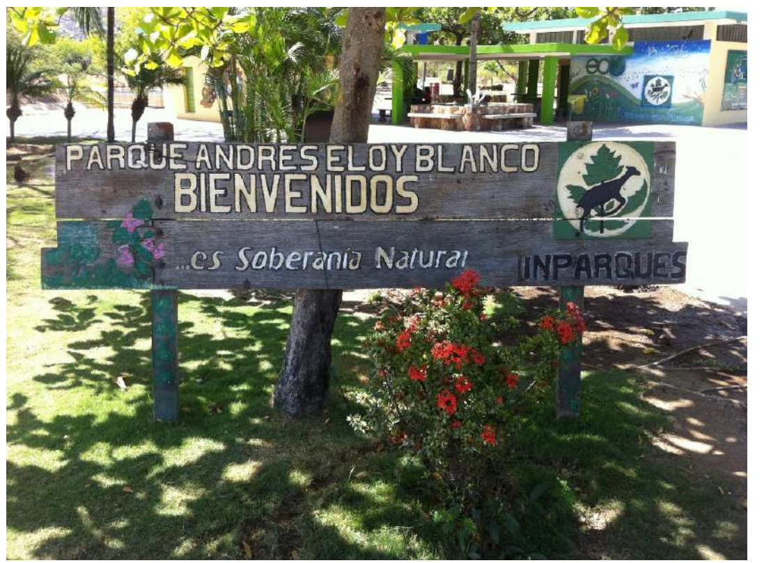
The park is the vegetable lung of Maturín

eight hectares of its extension, its numerous trees and complete facilities, the Andrés Eloy Blanco Recreation Park constitutes the vegetable lung of Maturín, capital of the Monagas state, and the most important recreational area of this city, this February 4th it comemorates its 35th anniversary.