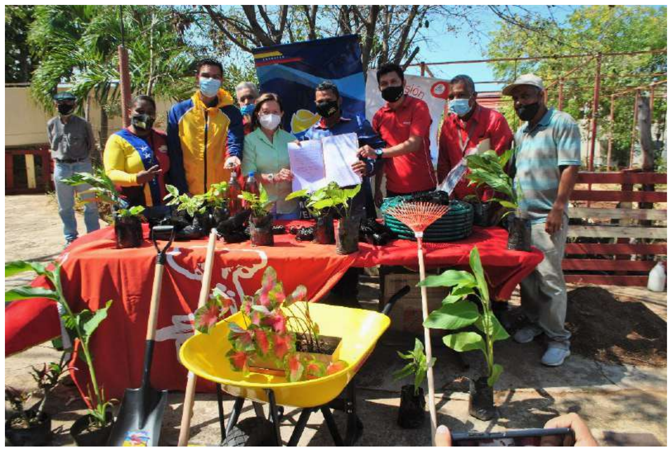
Fruit and medicinal trees will be planted in the production center

The Ministry of Popular Power for Ecosocialism through the Tree Mission, delivered a Community Nursery to the elderly who live in the National Institute of Social Services (Inass), in the town of Catia La Mar, La Guaira state.