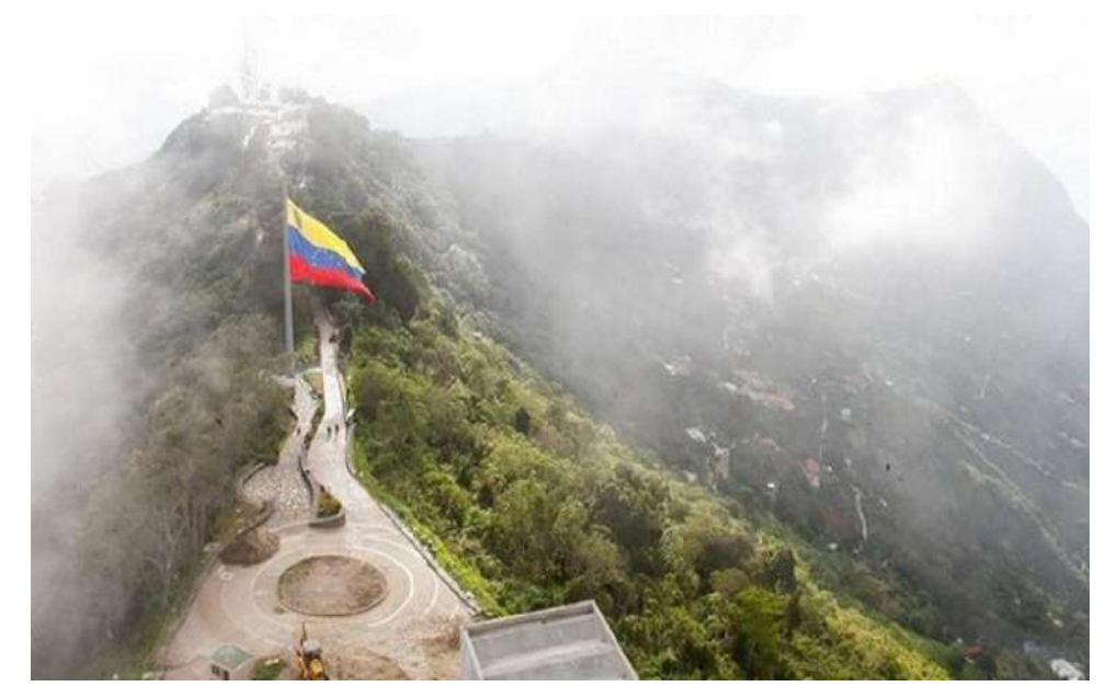
More than 85,192 hectares make up the Waraira Repano National Park

his December 12, the Waraira Repano National Park celebrates 63 years of having been declared the vegetal lung of Caracas. The mountain gives identity to the capital city, in addition to being an extraordinary space that for more than a century has been an icon and reason for representation for Venezuelans.