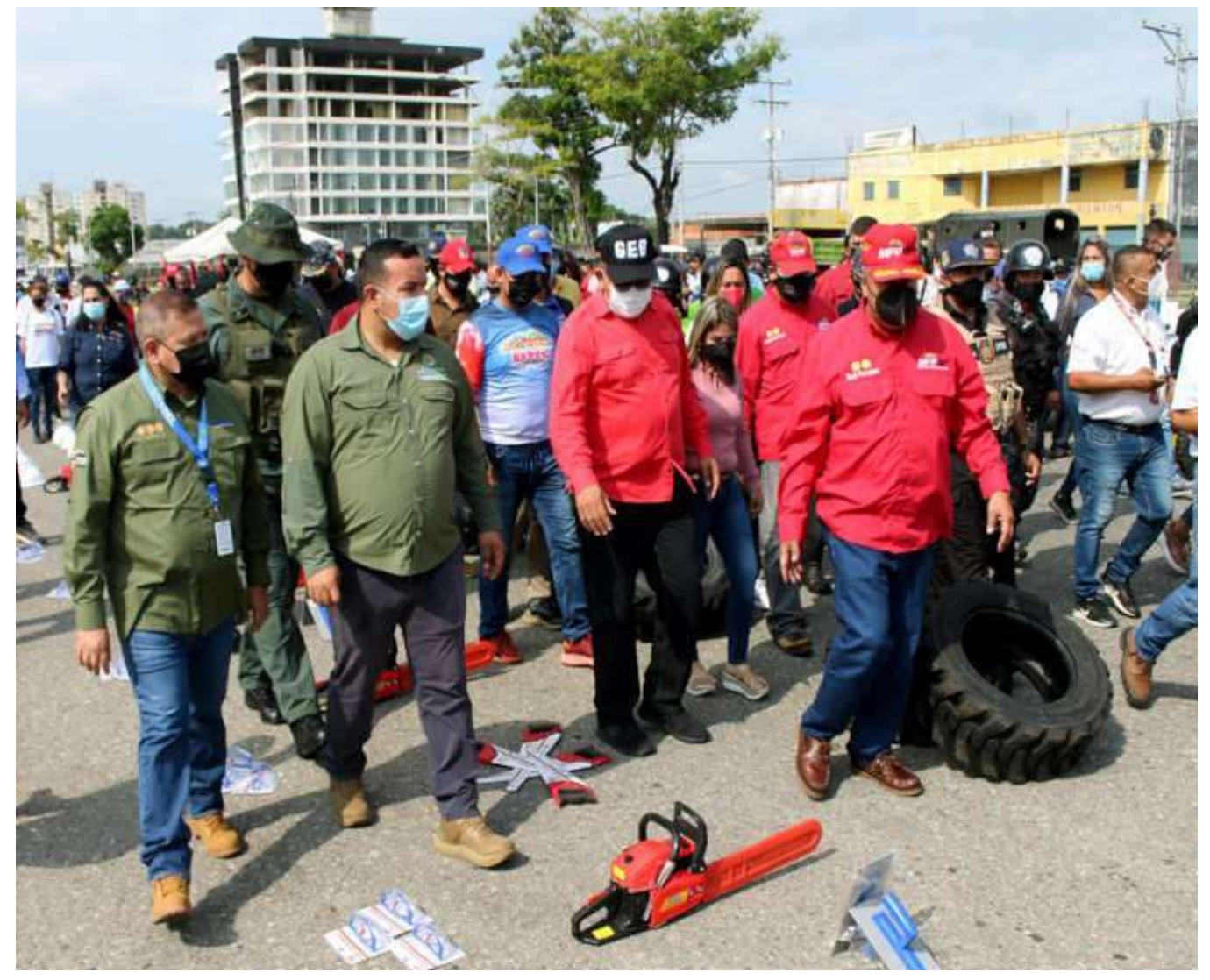
Heavy vehicles were equipped with tires, batteries and oils

Minister Paredes stressed that among various institutions of the national and regional aovernment, the facilities of the parks will be improved: Federación, La Carolina and Los Mangos, in addition, more than 28 kilometers of internal roads will be intervened, between avenues and streets.