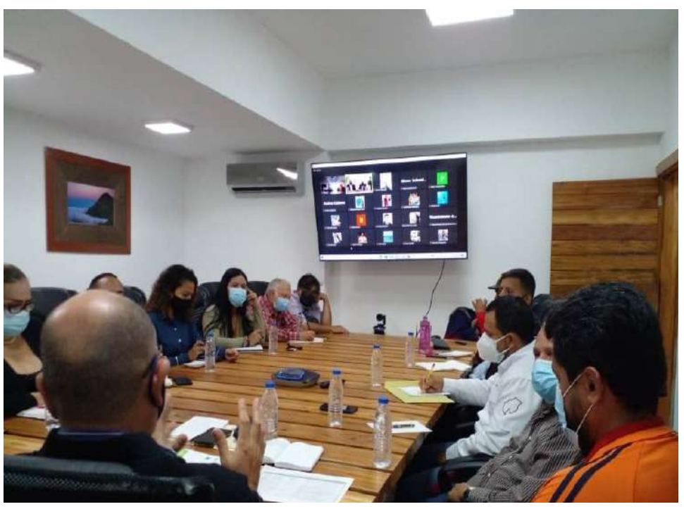
Representatives of various ministries participated in the activity

pay tribute to the formation of this report, which will highlight the achievements of Venezuela in the midst of the economic crisis and the pandemic", he said.