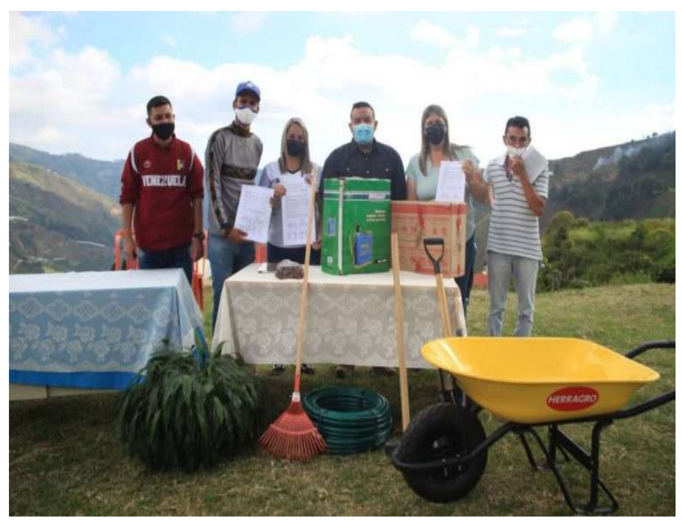
The El Jarillo community thanked MINEC for the comprehensive care session

he Minister of Popular Power for Ecosocialism, Josué Lorca, within the framework of the International Mountain Day celebration, led a series of activities in the community of El Jarillo, in the Guaicaipuro municipality of Miranda state.