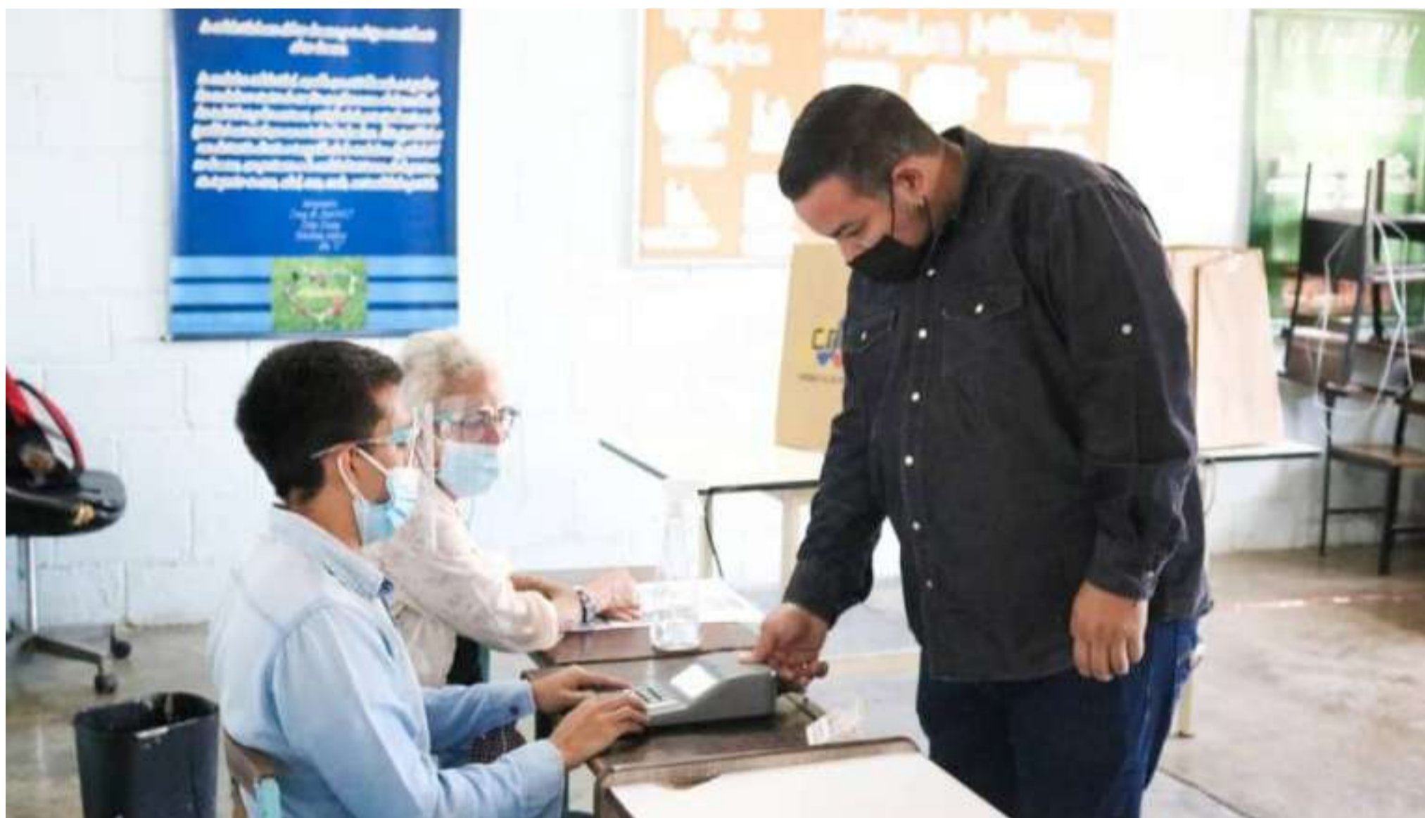
Lorca exercised his right to vote in the state of Miranda

The Minister of Popular Power for Ecosocialism, Josué Lorca, went to the voting center installed in the Vicente Salias Bolivarian National Educational Unit in the early hours of the morning of this Sunday to exercise his right to vote.