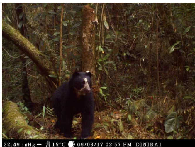
The frontin bear in its natural habitat

He added that "we want to tell the country that these books are part of the launching policies of the entire training, research, publication and dissemination process carried out by Minec".