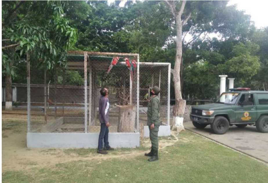
The specimens are in the custody of the Minec

The Ministry of the Popular for Ecosocialism (Minec), through the Territorial Ecosocialist Unit (UTEC) Miranda, in the