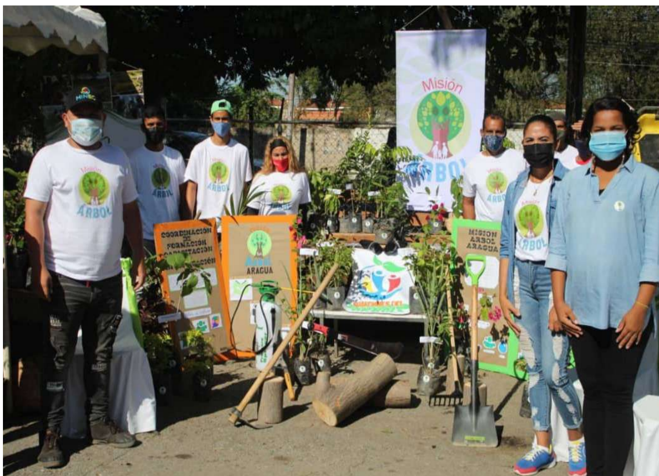
With this certification, producers will generate work spaces in their communities

In continuity of the Days of Adequacy of Forest Industries, the Ministry of Popular Power for Ecosocialism (Minec), delivered 32 certificates of installation and operation, to people linked to the wood sector in the state of Aragua, with which it is 592 authorizations in the country.