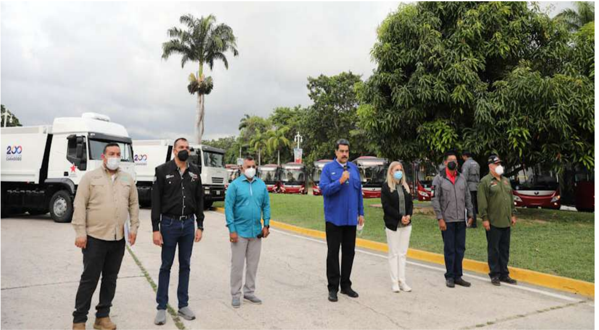
Bolivarian Government travels the country in order to offer improvements to the people

The president of the Bolivarian Republic of Venezuela, Nicolás Maduro Moros, during a day of productive work, dedicated to the attention of public services and direct action on transportation, solid waste, gas, electricity and water services, delivered a batch of trucks compactors to various municipalities of the country.