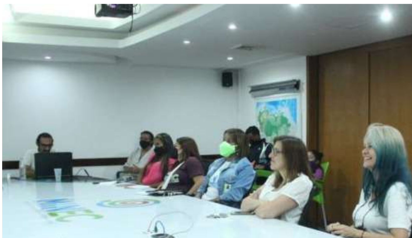
The meeting showed the progress of various investigations

Slibe pointed out that Minister Lorca had an intervention that he described as "extraordinary at COP26", with which Venezuela comes to the fore with the Fifth Historical Objective of the Plan de la Patria 2019-2025.