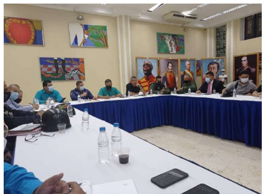
In perfect gear, institutions of the Bolivarian Government attend to the problem of pruning

Likewise, the Minec called for attention to the multiple entities and municipalities that arbitrarily carry out pruning and felling