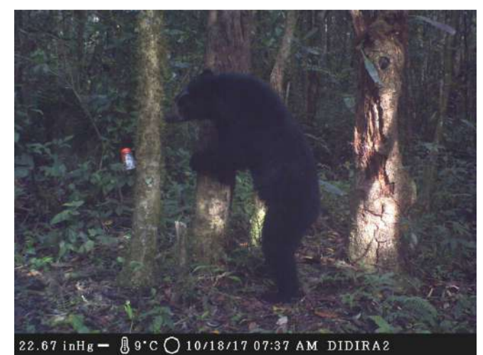
The frontin bear in its natural habitat

"We have exchanged via voice and audiovisual notes with their authors. Also, with colleagues from the National Parks Institute (Inparques) and of course, with one of the people who was particularly motivated,