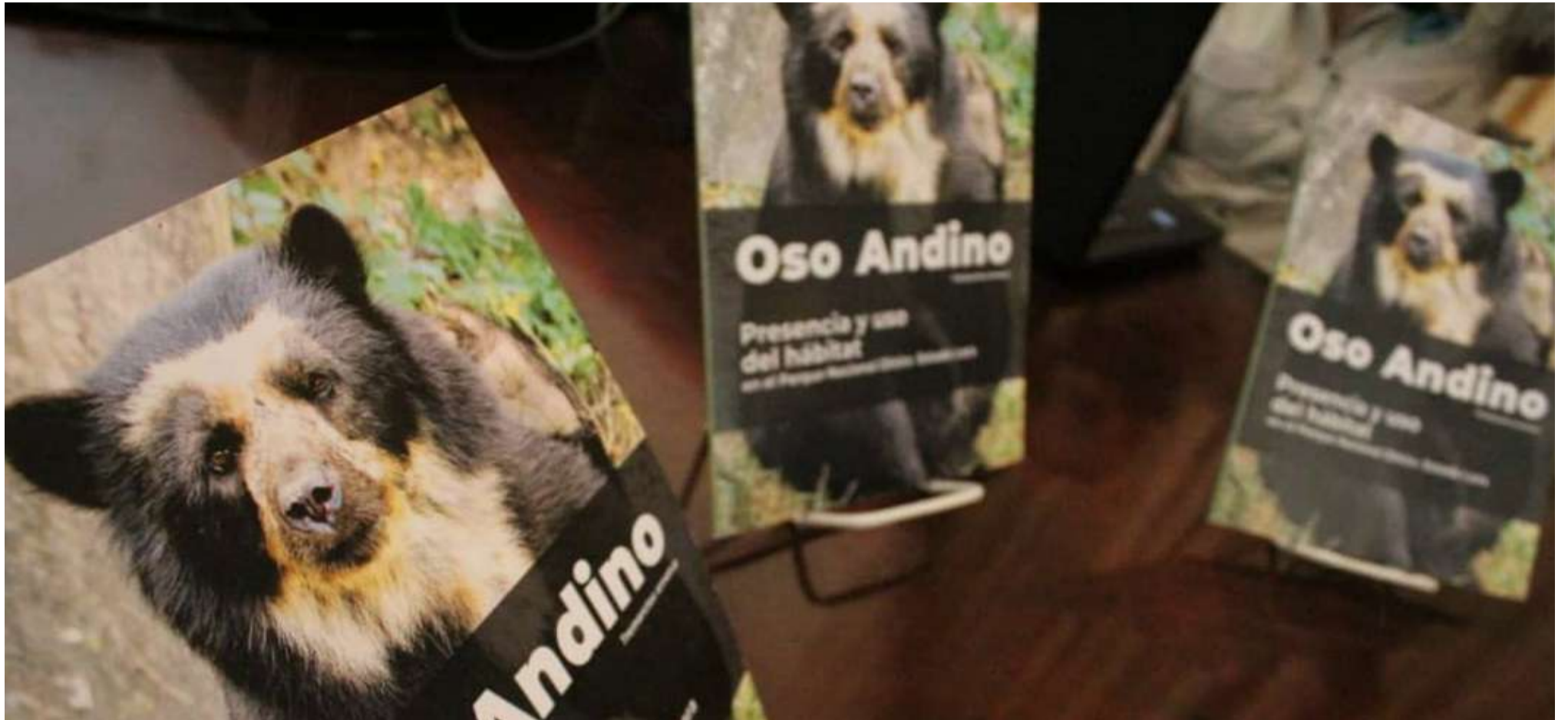
The publication is available in the Amalivaca editions catalog since last FILVEN 2021

During the annual edition of the International Book Fair of Venezuela (Filven 2021), the Ministry of Popular Power for Ecosocialism, through the National Foundation for Environmental Education (Fundambiente), presented books related to biological diversity, among which The Frontin Bear stands out: Presence and use of the habitat in the Dinira National Park.