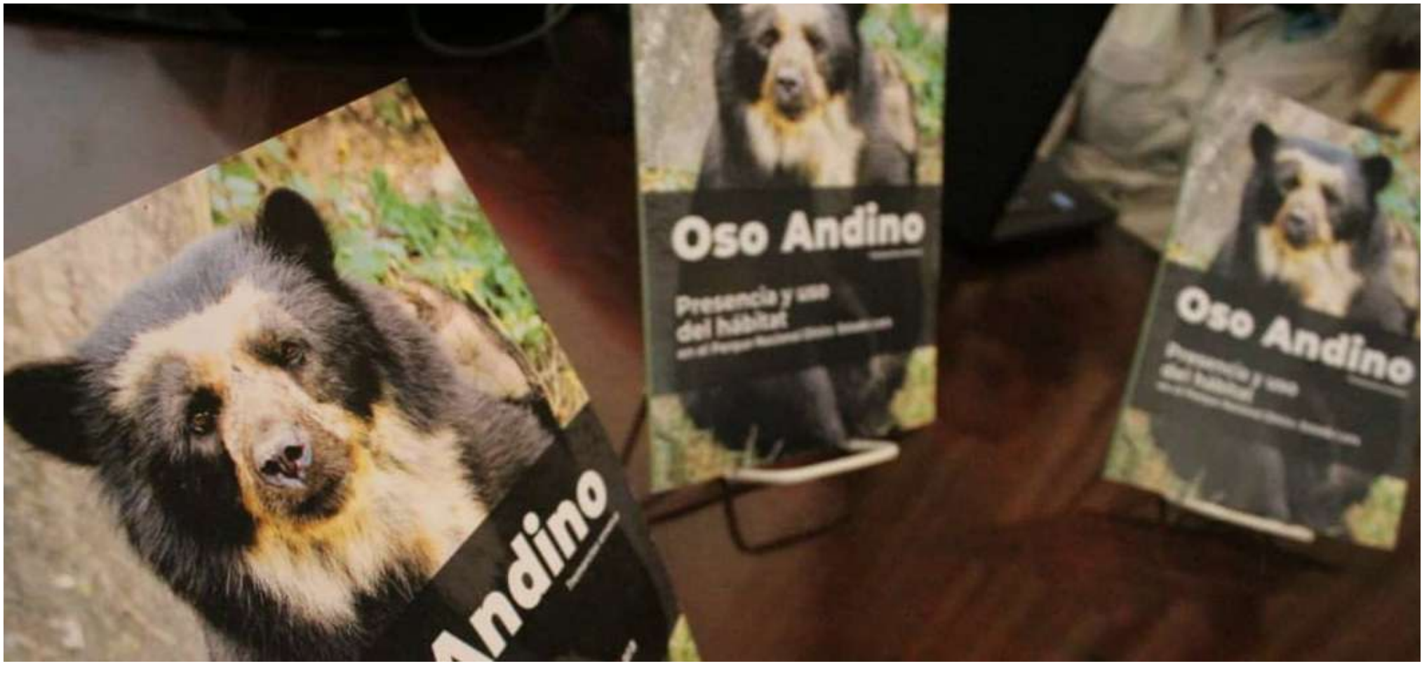
The publication is available in the Amalivaca editions catalog since last FILVEN 2021

uring the annual edition of the International Book Fair of (Filven 2021), the Venezuela Ministry of Popular Power for Ecosocialism, through the National Foundation for Education Environmental (Fundambiente), presented books related to biological In this which The diversity, among stands out: Frontin Bear Presence and use of the habitat president in the Dinira National Park.