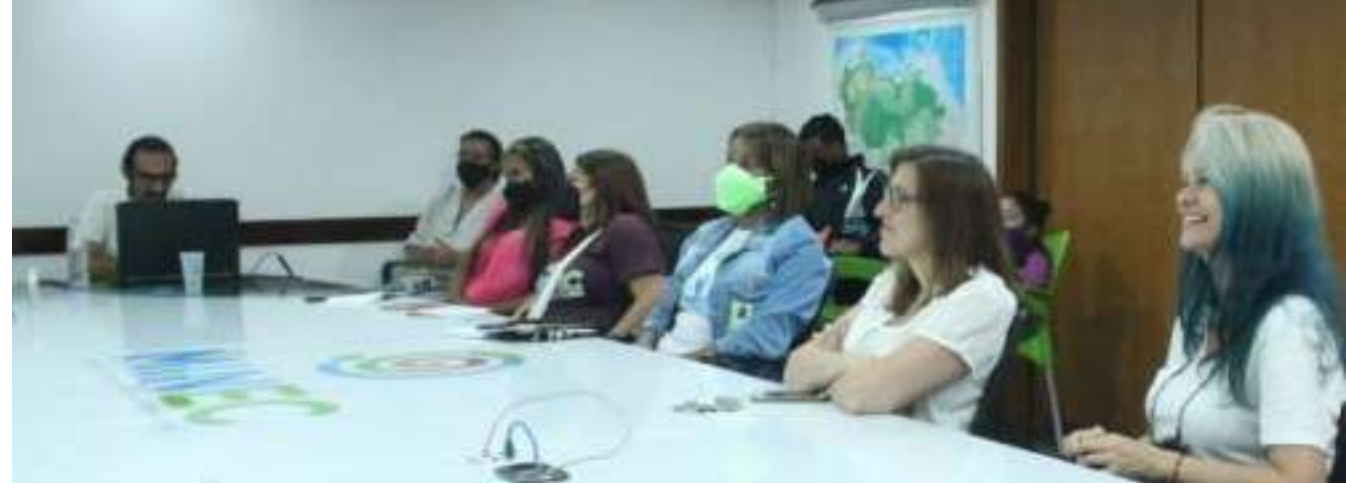
The meeting showed the progress of various investigations

Slibe pointed out that Minister Lorca had an intervention that he described as "extraordinary at COP26'', with which Venezuela comes to the fore with the Fifth Historical Objective of the Plan de la Patria 2019-2025.