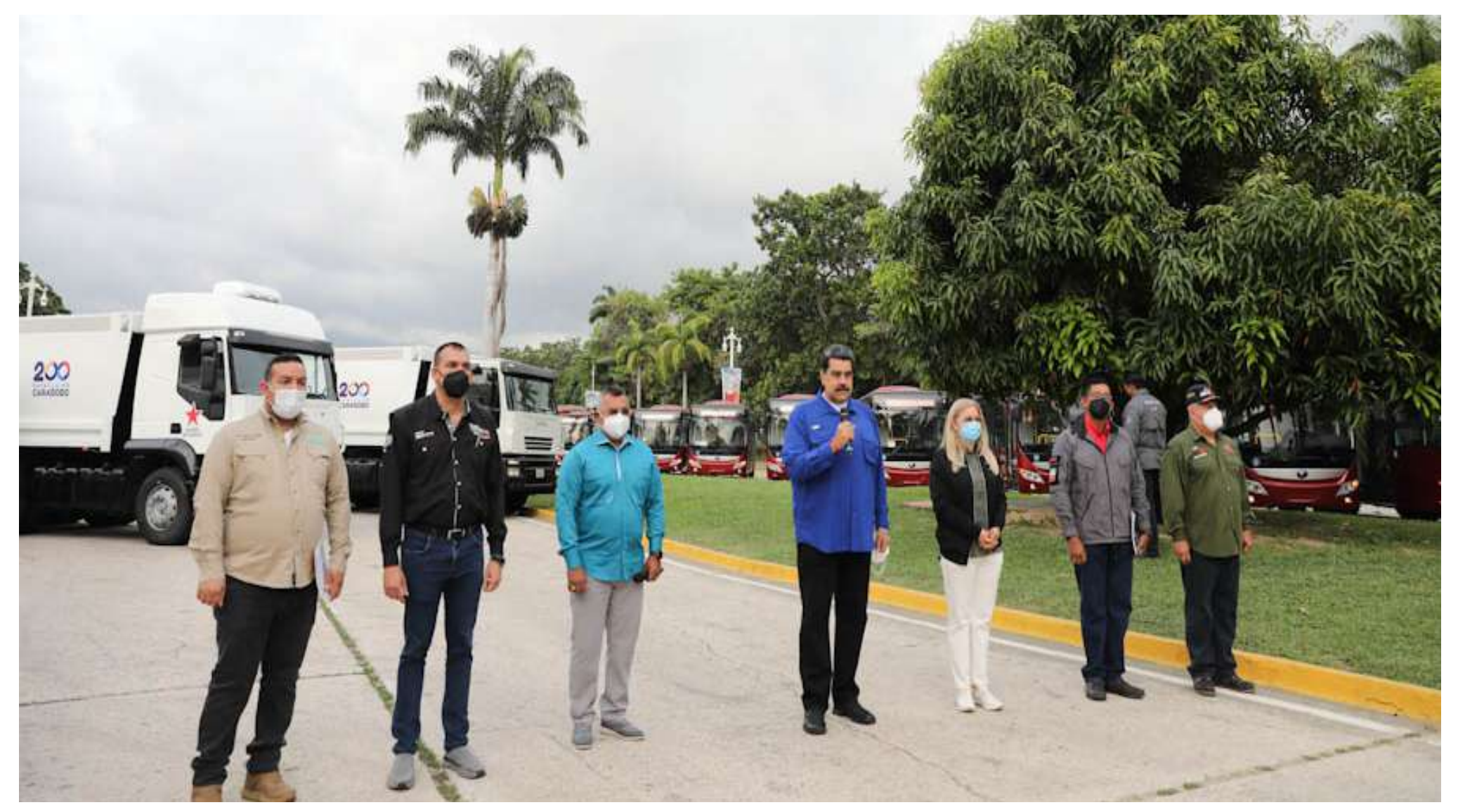
Bolivarian Government travels the country in order to offer improvements to the people

he president of the Bolivarian Republic of Venezuela, Nicolás Maduro Moros, during a day of productive work, dedicated to the attention of public services and direct action on transportation, solid waste, gas, electricity and water services, delivered a batch of trucks compactors various to municipalities of the country.