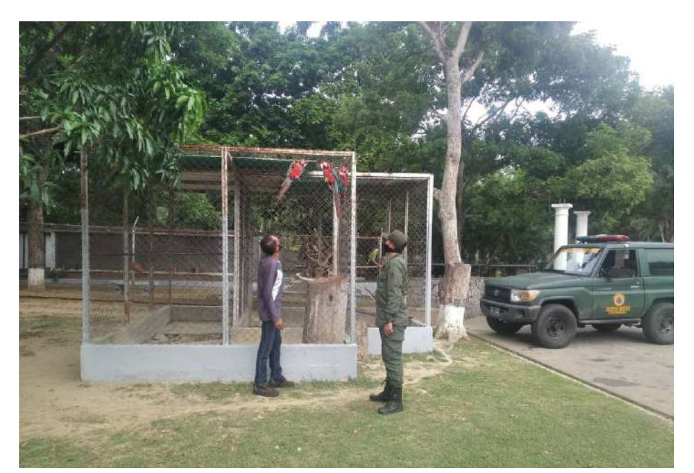
The specimens are in the custody of the Minec

he Ministry of the Popular for Ecosocialism (Minec), through the Territorial Ecosocialist Unit the (UTEC) Miranda, in