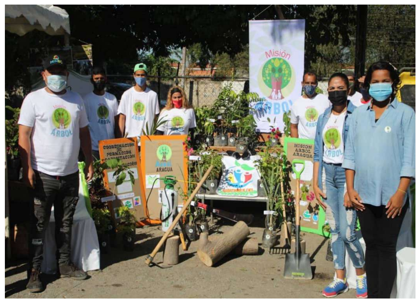
With this certification, producers will generate work spaces in their communities

n continuity of the Days of Adequacy of Forest Industries, the Ministry of Popular Power for Ecosocialism (Minec), delivered 32 certificates of installation and operation, to people linked to the wood sector in the state of Aragua, with which it is 592 authorizations in the country.