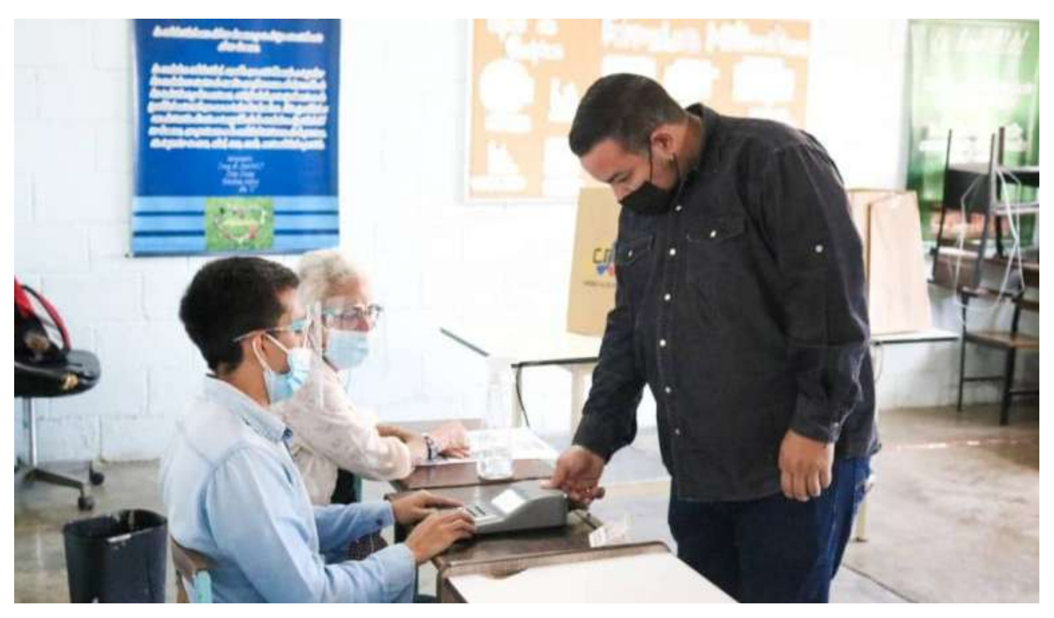
Lorca exercised his right to vote in the state of Miranda

the to Venezuela for all," he added. he Minister of Popular Power voting centers early. for Ecosocialism, Josué Lorca, Through a message broadcast In the electoral process on went to the voting center on his social networks prior to Sunday 21, more than 21 million installed in the Vicente Salias the voting, Minister Lorca Venezuelans were authorized Bolivarian National Educational to to participate, and 335 mayors, made an invitation Unit in the early hours of the participate in the election day 23 governors, 2,471 councilors morning of this Sunday to and added that voting implies and 253 representatives were exercise his right to vote. а commitment to the elected to the regional head of Ecosocialism construction of better legislative councils. Likewise, а The moved to his electoral center country. 70 thousand around candidates from the entire located in the Guaicaipuro parish of the municipality of Participating the political "is spectrum of the the same name, in the state of consolidation of a country that country participated in the his has been growing, that has contest. Miranda, to execute in been emerging, that has been constitutional right and of defeating sanctions, this is the call response to President Nicolás Maduro that proof that Venezuela wants the peace, that it does not bow to all voters aualified for this anyone and that we are going mega-election of