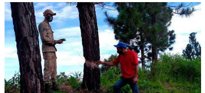
It was declared a National Park under Decree No. 2,347 on June 5, 1992

Within the park there are a large number of human settlements