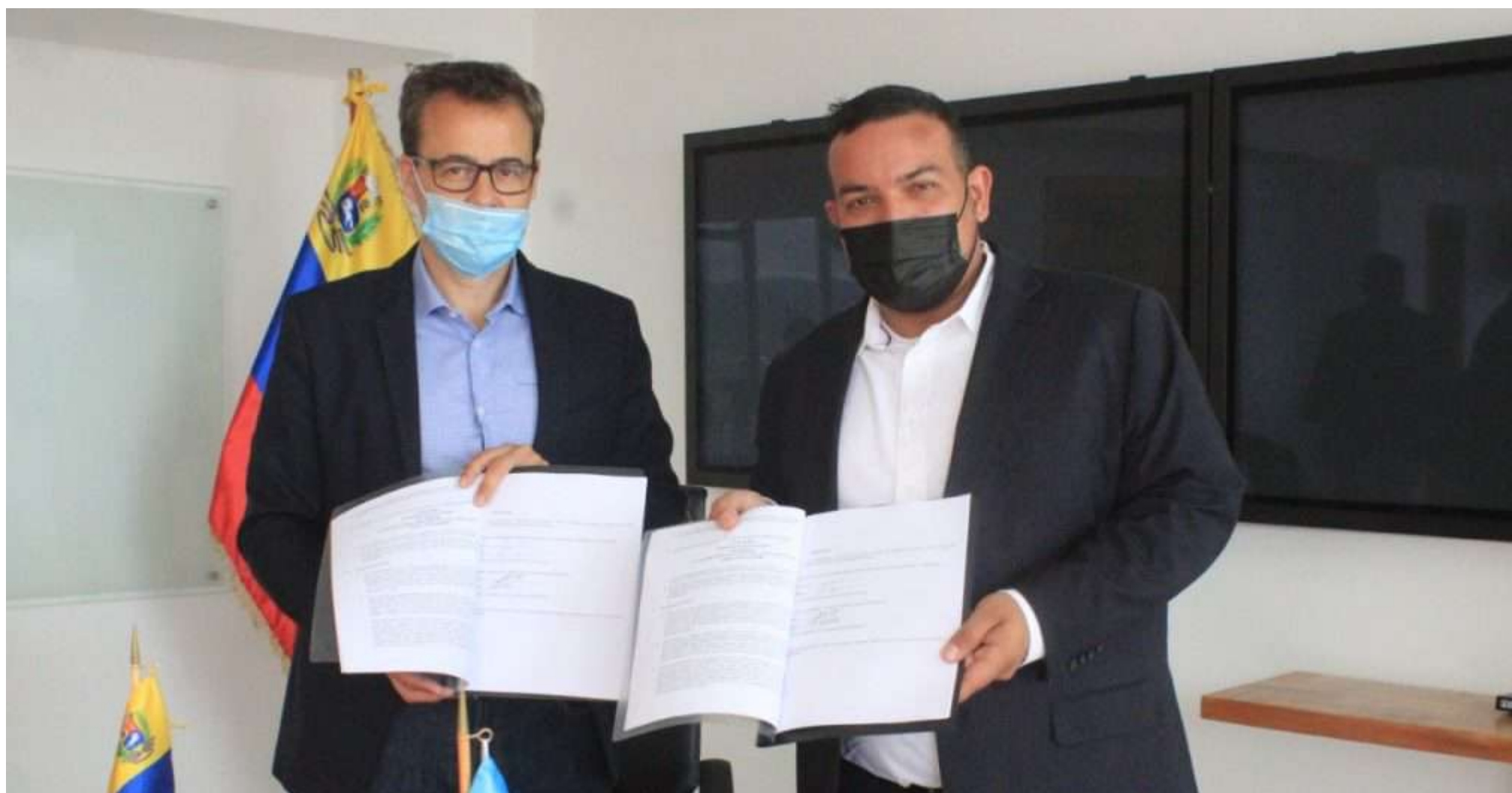
Venezuela will receive service and technical support from FAO

T he Ministry of Popular Power for Ecosocialism (MINEC), through the National Reforestation Company (CONARE) and the National Park Institute (INPARQUES), signed a service and technical support agreement with the United Nations Organization for the Food and Agriculture (FAO) as part of the Sustainable Forest Management and Forest Conservation in the Ecosocial Perspective project.