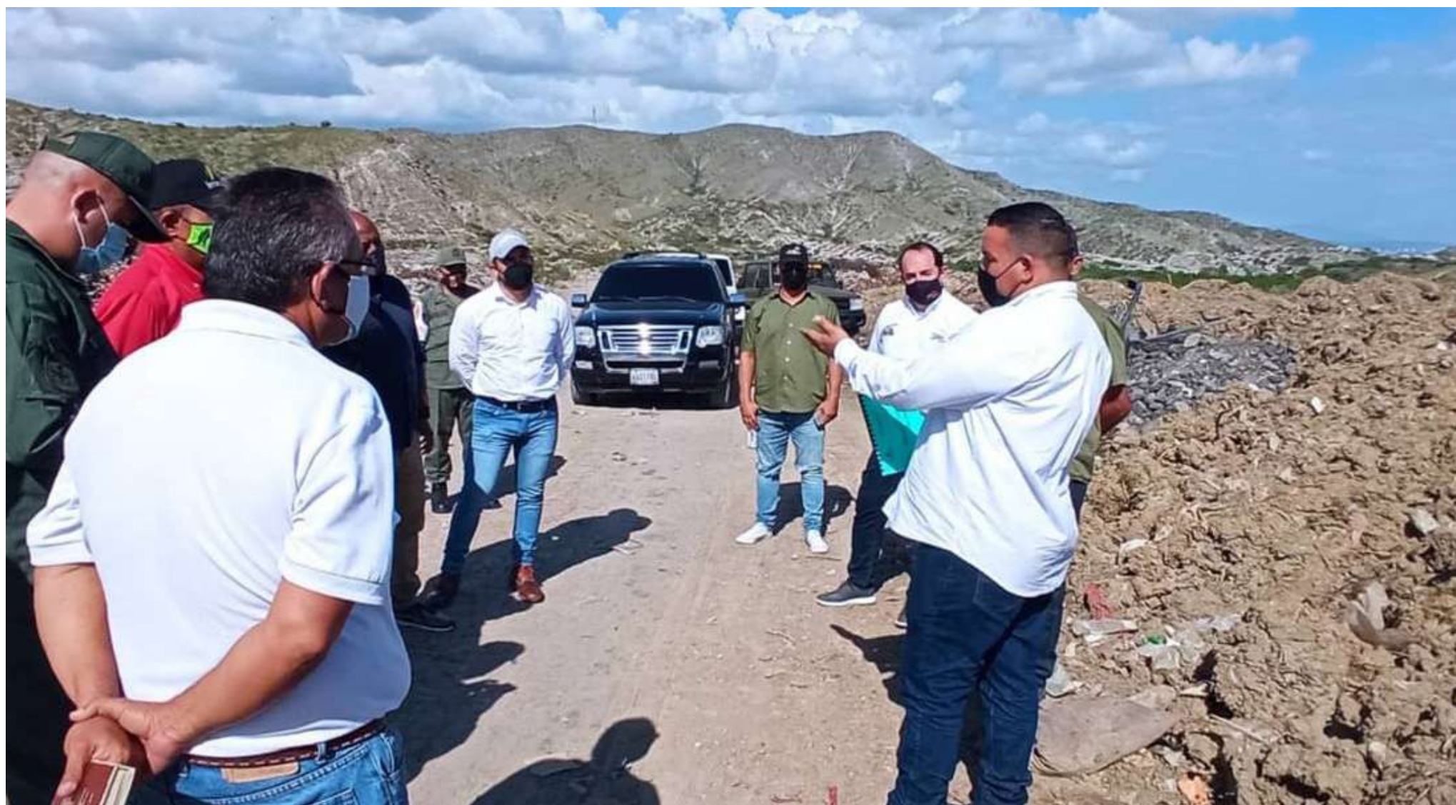
National deployment of the Sectoral Vice Presidency seeks to offer quality services

In addition, the incorporation of four new deep water wells to the Lara state water system was agreed, in order to guarantee the supply of drinking water in the entity.