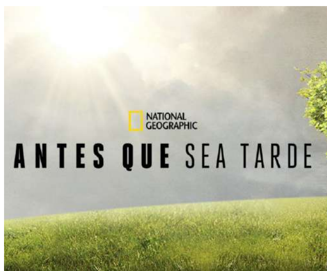
Leonardo DiCaprio meets with experts, scientists and world leaders to discuss climate change and consequences

The audiovisual piece produced by National Geographic Channel, presents as moderator the actor and environmental activist Leonardo DiCaprio, designated in 2016 messenger of the United Nations Organization (UN) against climate change, who travels several countries and interviews different personalities of the scientific and political world, in order to know the seriousness of the problem that Planet Earth is going through.